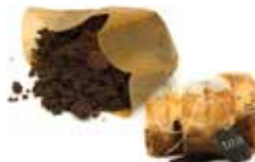
COFFEE GROUNDS, FILTERS & TEA BAGS