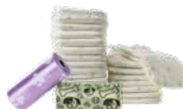
DIAPERS OR PET WASTE