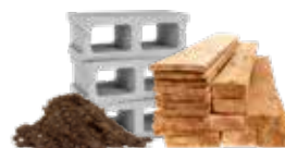
CONCRETE, WOOD OR CONSTRUCTION DEBRIS