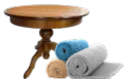
RUGS, CARPETS OR FURNITURE