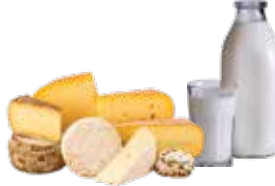
CHEESE & DAIRY PRODUCTS