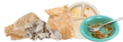
PLATE SCRAPINGS & MINIMAL AMOUNTS OF FOOD SOILED PAPER