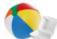
POLYSTYRENE OR NON-RECYCLABLE PLASTIC