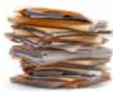
OFFICE PAPER & JUNK MAIL