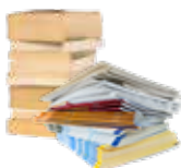
MAGAZINES, NEWSPAPERS & PHONE BOOKS