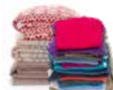
BEDDING OR CLOTHING