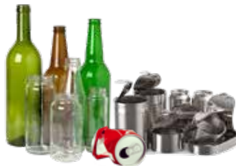
GLASS & METAL