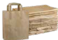
FLATTENED CARDBOARD & PAPER BAGS

Keep recyclables loose and dry in your cart