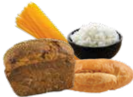
BREAD, PASTA, RICE & GRAINS