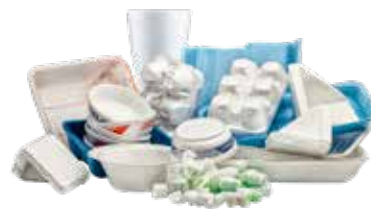
FOOD PACKAGING MATERIAL