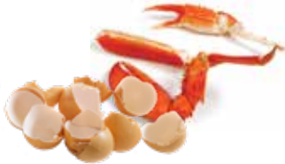
EGGSHELLS & SEAFOOD SHELLS

Your food waste will be recycled into renewable energy or nutrient-rich compost