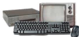
ELECTRONICS OR SMALL APPLIANCES