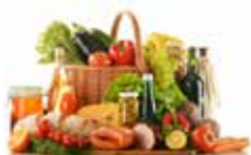
FOODS OR LIQUIDS