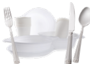
SILVERWARE & DISHWARE