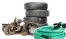
GARDEN HOSES, TIRES, AUTO PARTS OR SCRAP METAL