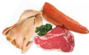
MEAT, FISH & POULTRY