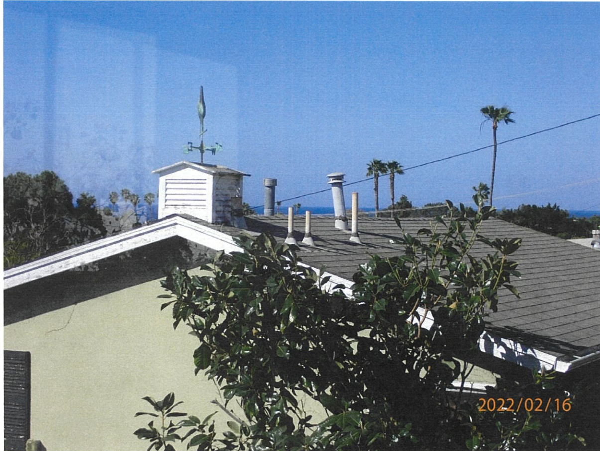
276 Cajon Street

The photograph above was taken from the dining area, living room and master bedroom on the main upper level of the primary residential structure.