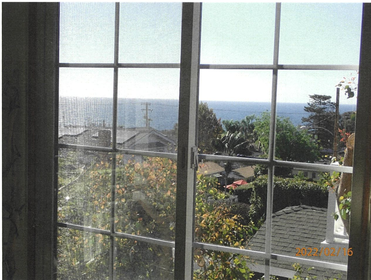
276 Cajon Street

The photograph above was taken from the dining area, living room and master bedroom on the main upper level of the primary residential structure.