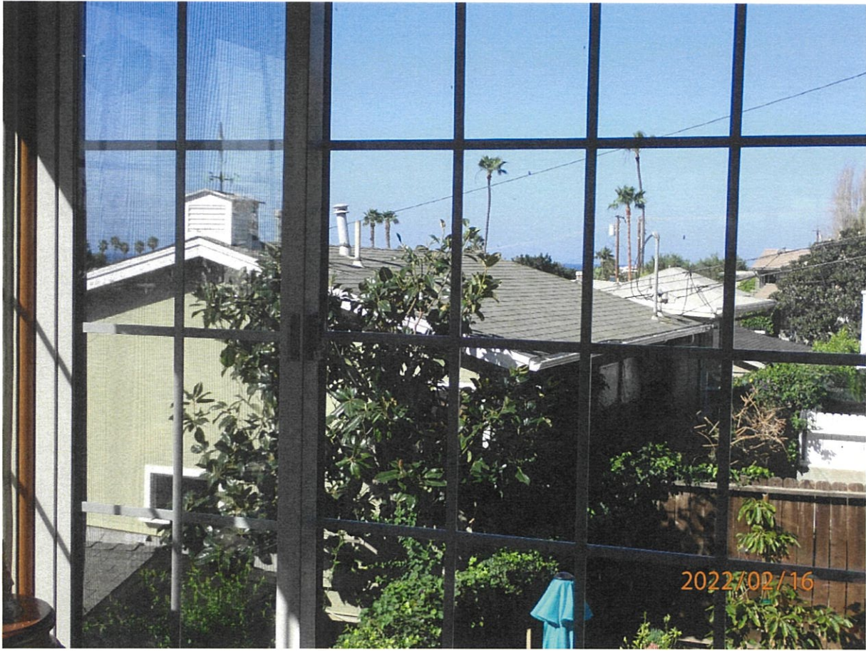
276 Cajon Street

The photograph above was taken from the dining area, living room and master bedroom on the main upper level of the primary residential structure.