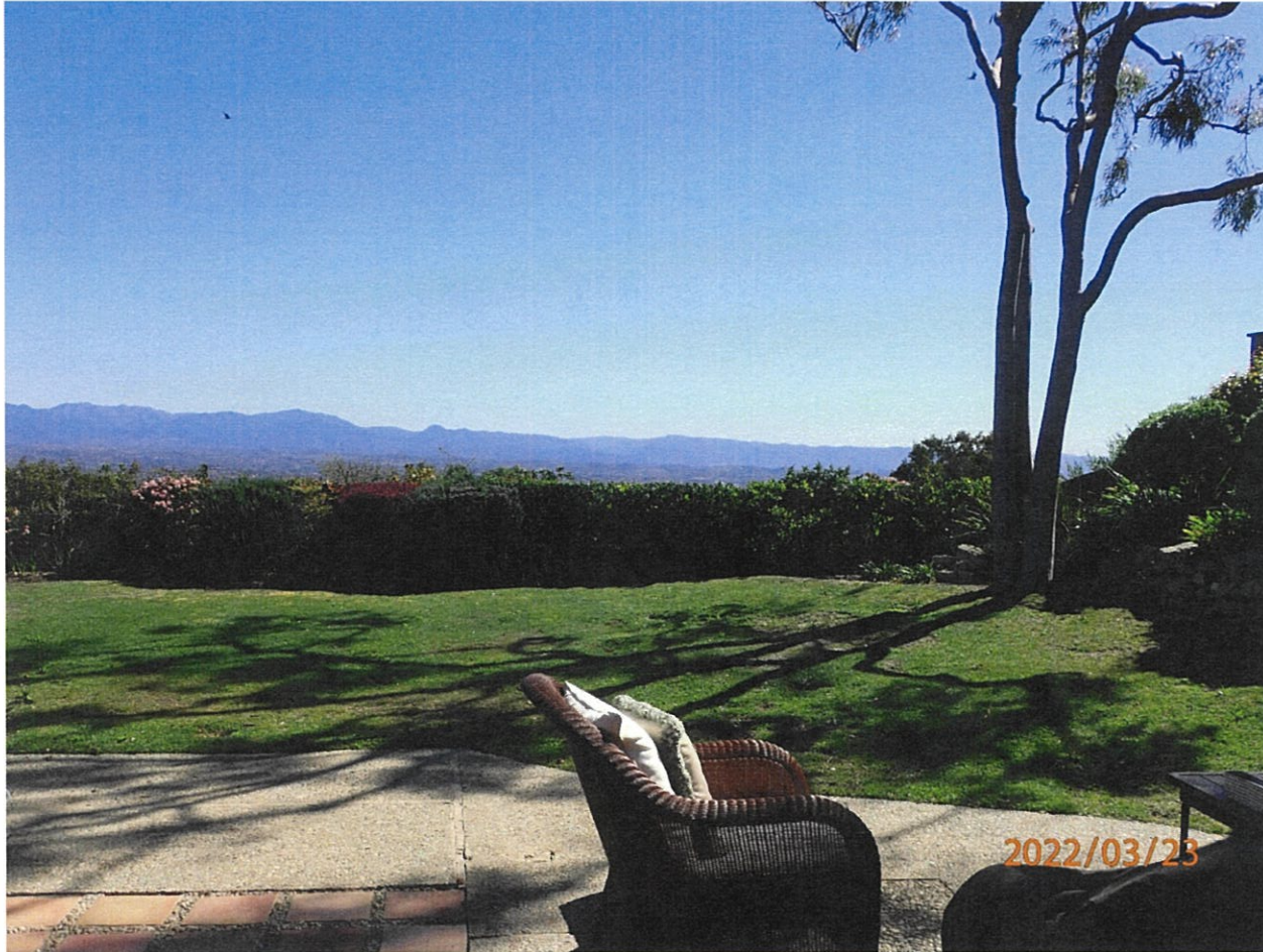
3170 Tyrol Drive

The photograph above was taken from the dining room on the main level of the primary residential structure.