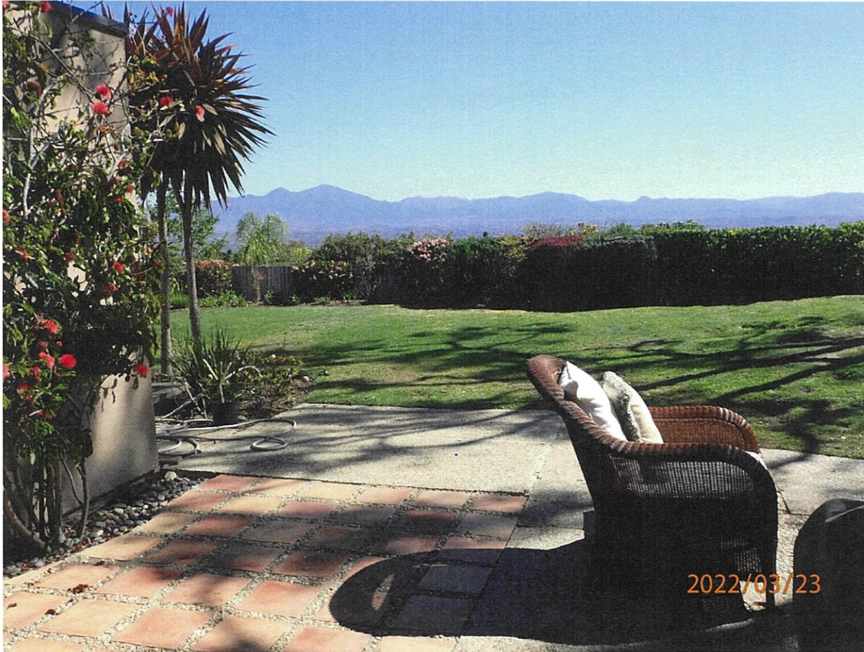
3170 Tyrol Drive

The photograph above was taken from the living room on the main level of the primary residential structure.