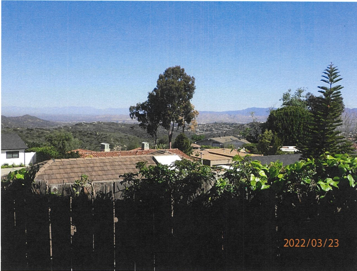
3170 Tyrol Drive

The photograph above was taken from the dining room on the main level of the primary residential structure.