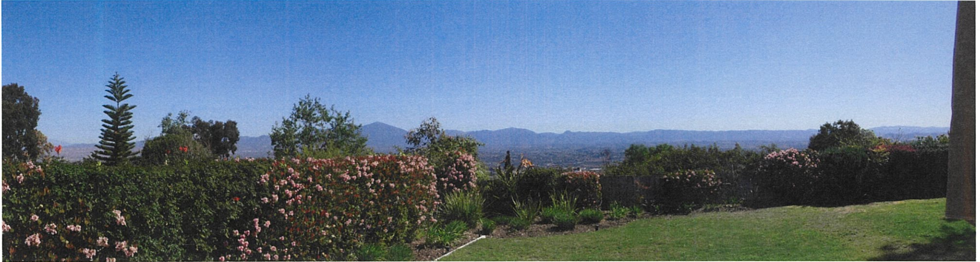
3170 Tyrol Drive

The photograph above was taken from the primary bedroom on the main level of the primary residential structure. Visual scene description: Aliso and Woods Canyon Wilderness Park, Saddleback Mountain, city lights and hillside terrain. Date of photograph: 3/23/22 Submitted to property file: 4/5/22