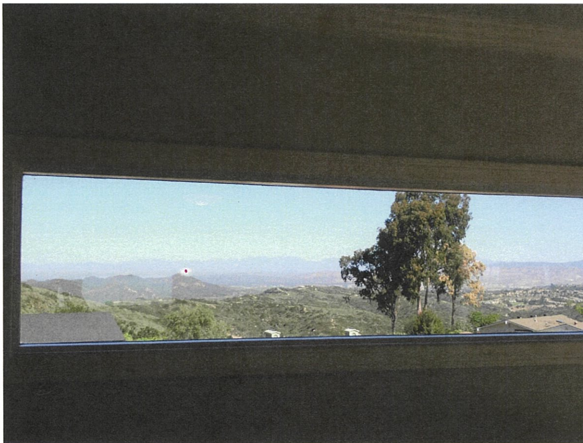
3170 Tyrol Drive

The photograph above was taken from the primary bedroom on the main level of the primary residential structure. Visual scene description: Aliso and Woods Canyon Wilderness Park, Saddleback Mountain, city lights and hillside terrain.