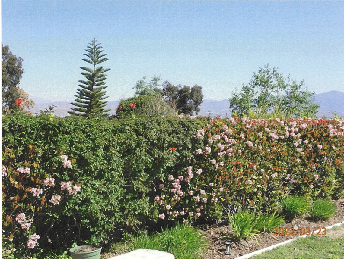
3170 Tyrol Drive

The photograph above was taken from the primary bedroom on the main level of the primary residential structure. Visual scene description: Aliso and Woods Canyon Wilderness Park, Saddleback Mountain, city lights and hillside terrain.