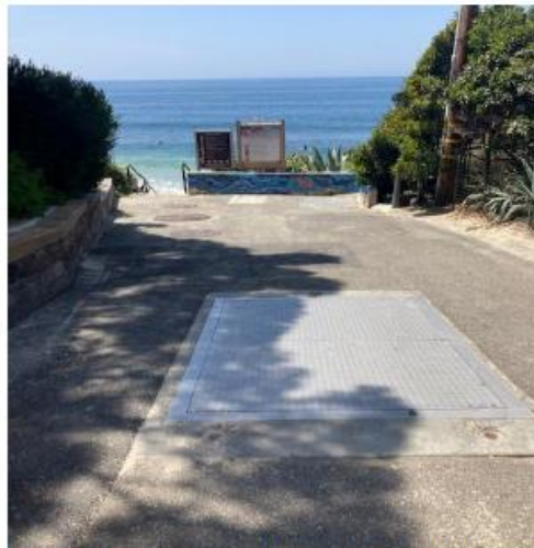
Present Siting of Mural, Anita Street Beach Entrance