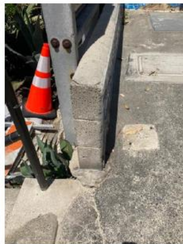
Cast concrete block and grout substrate