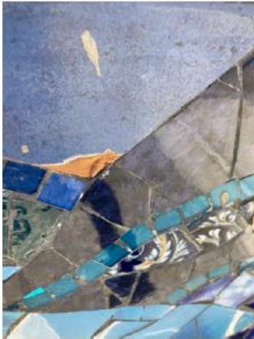
Broken glazed ceramic tesserae