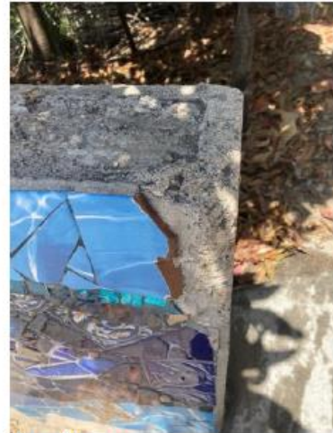
Loss of tesserae