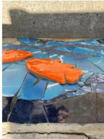
Cracked and chipped raised tile