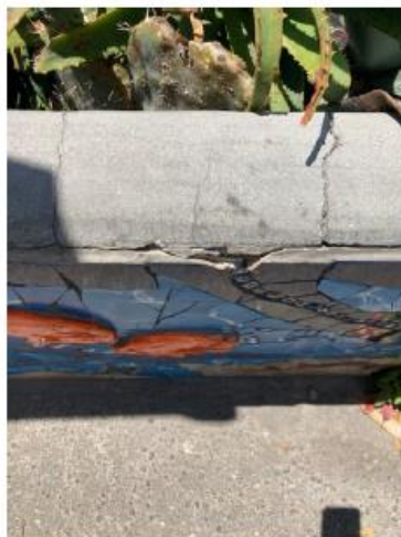
Cracking and loss of cement cap and grout