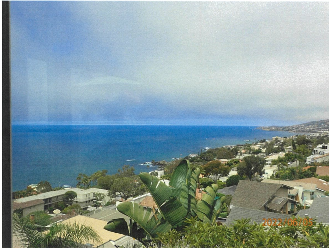
2665 Pala Way

The photograph above was taken from sitting in the living room on the main level of the primary residential structure.