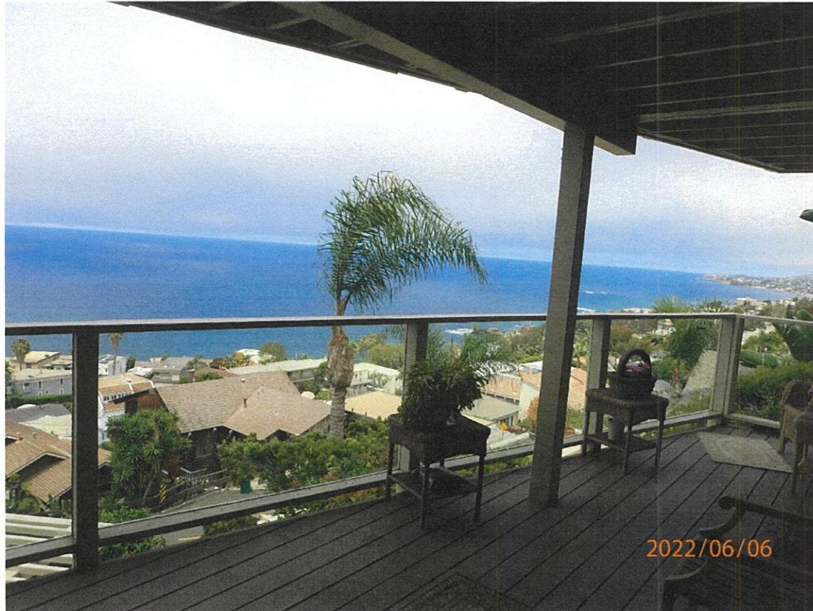
2665 Pala Way

The photograph above was taken from the primary bedroom on the lower level of the primary residential structure.