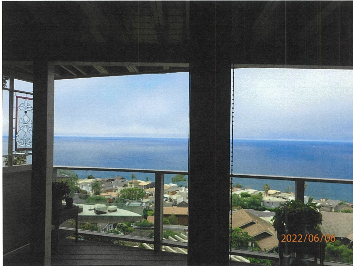
2665 Pala Way

The photograph above was taken from the primary bedroom on the lower level of the primary residential structure.