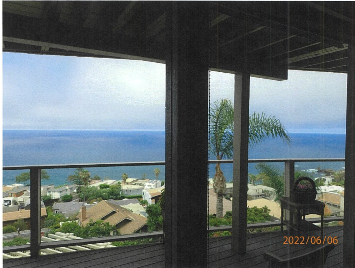
2665 Pala Way

The photograph above was taken from the primary bedroom on the lower level of the primary residential structure.