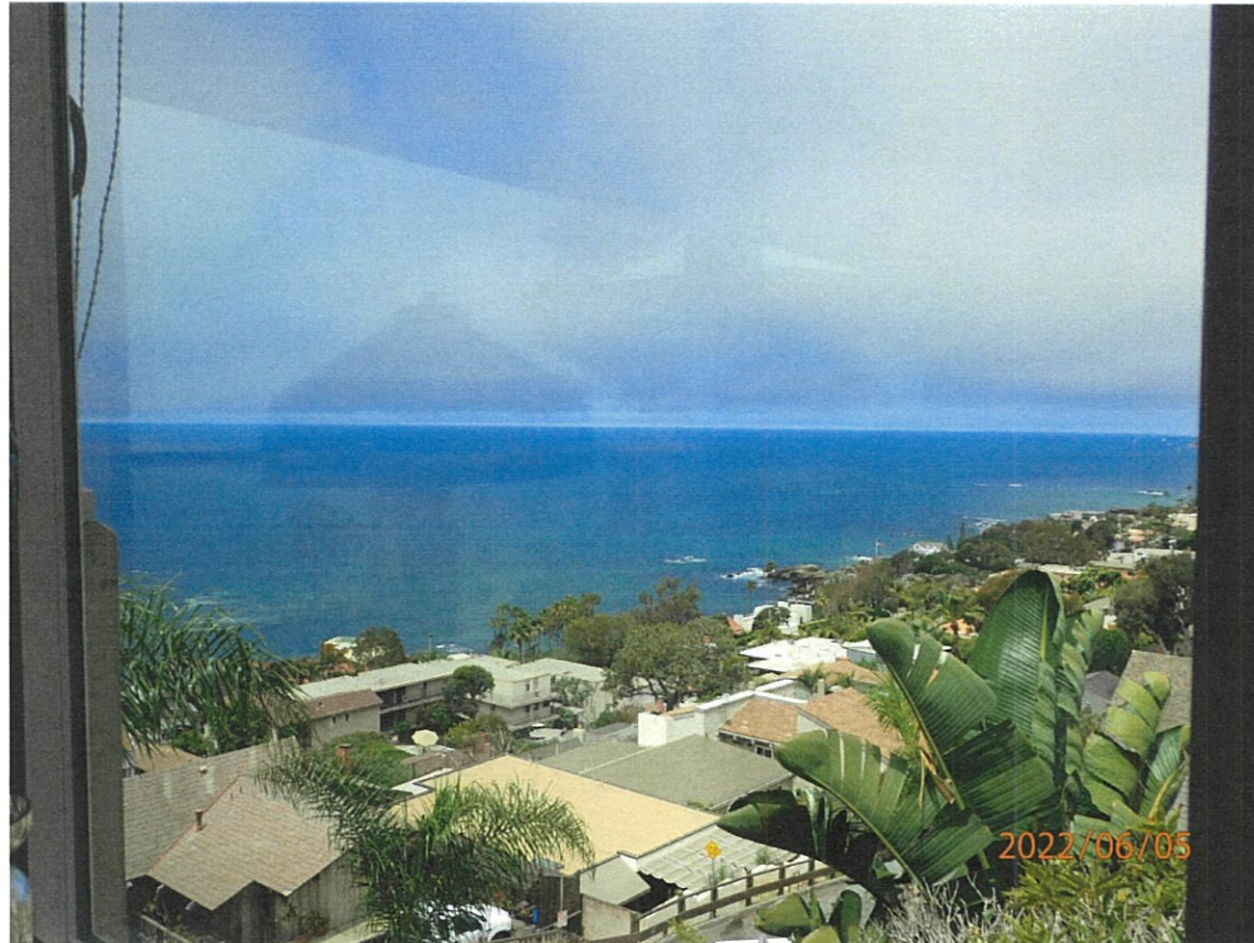
2665 Pala Way

The photograph above was taken from sitting in the living room on the main level of the primary residential structure.