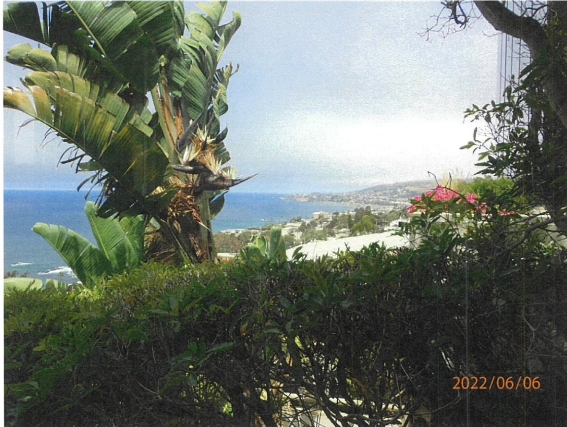
2665 Pala Way

The photograph above was taken from sitting in the studio on the lower level of the primary residential structure.