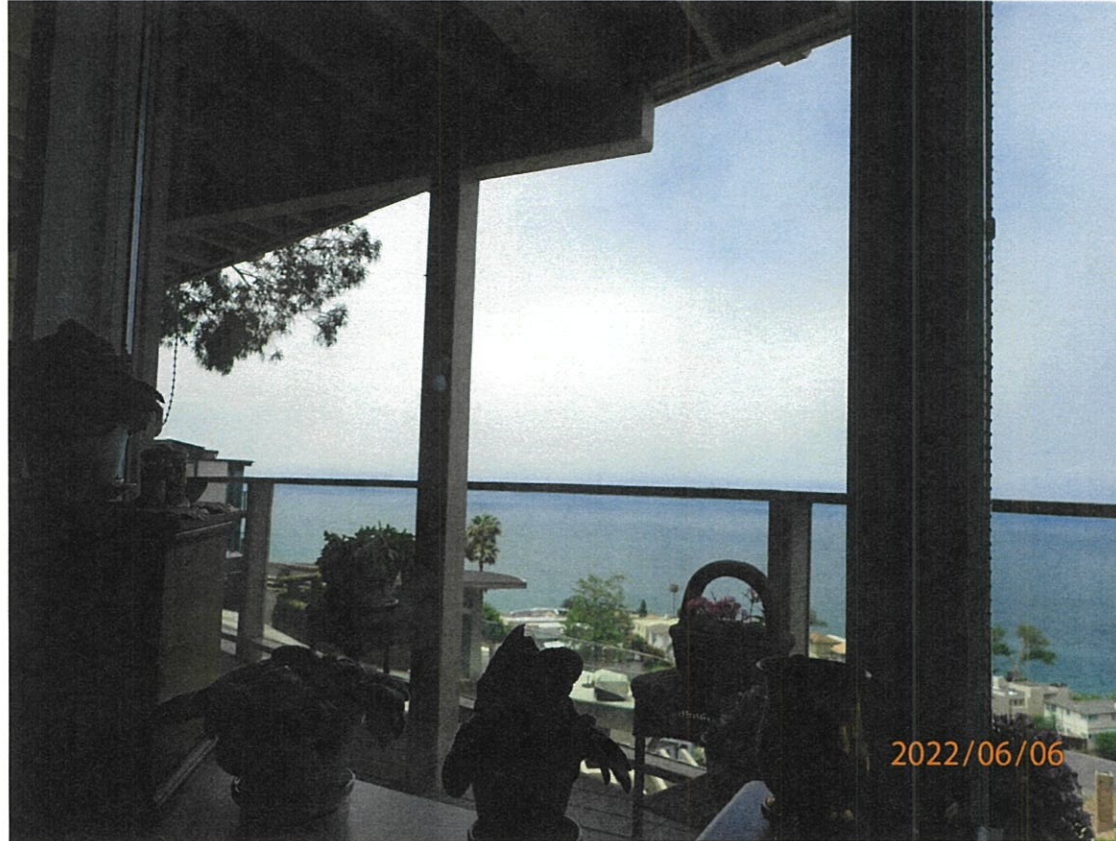
2665 Pala Way

The photograph above was taken from sitting in the studio on the lower level of the primary residential structure.