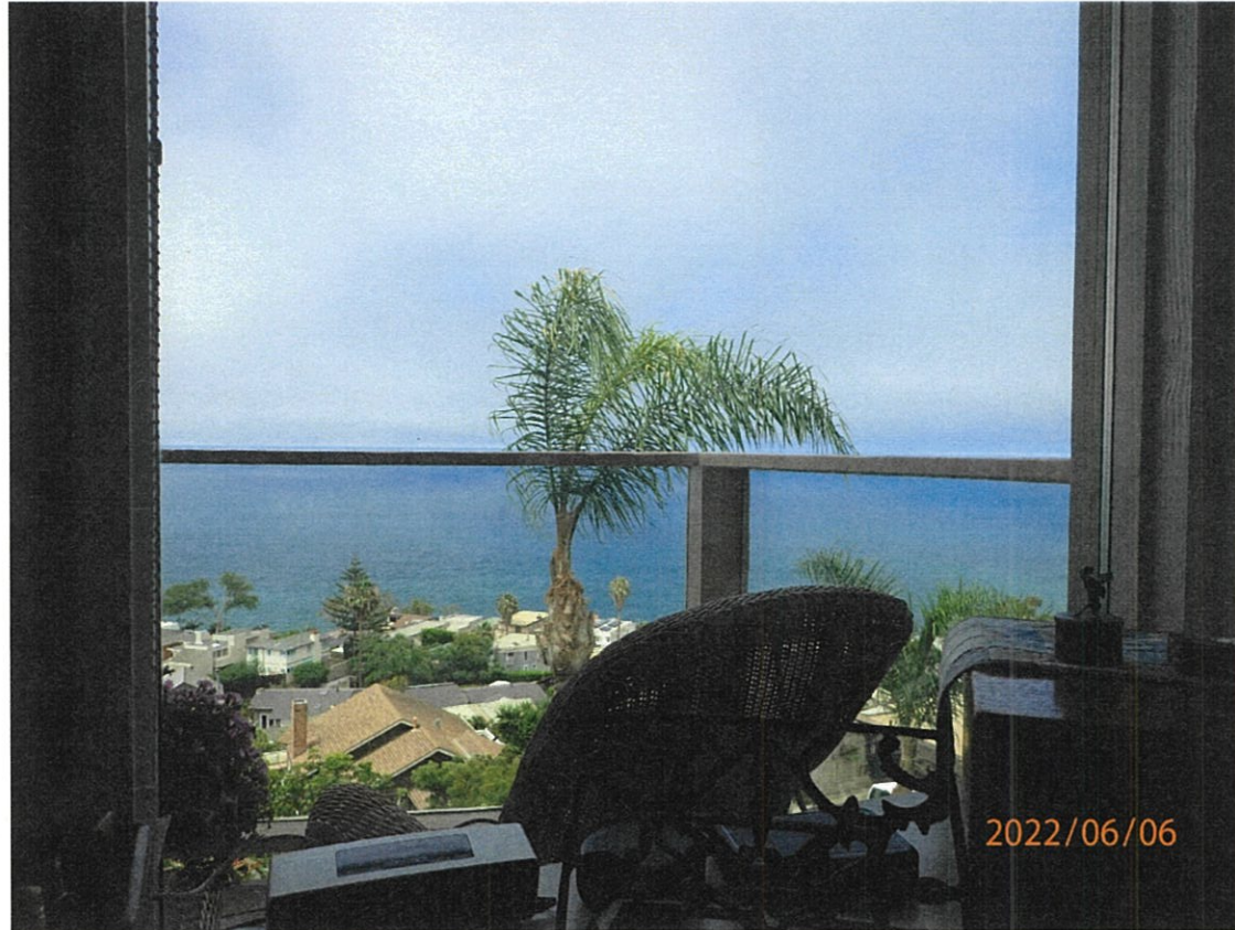
2665 Pala Way

The photograph above was taken from sitting in the studio on the lower level of the primary residential structure.