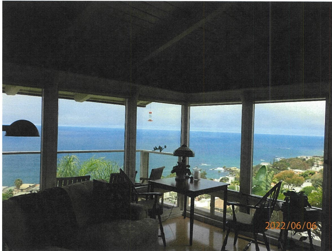
2665 Pala Way

The photograph above was taken from the living room on the main level of the primary residential structure.