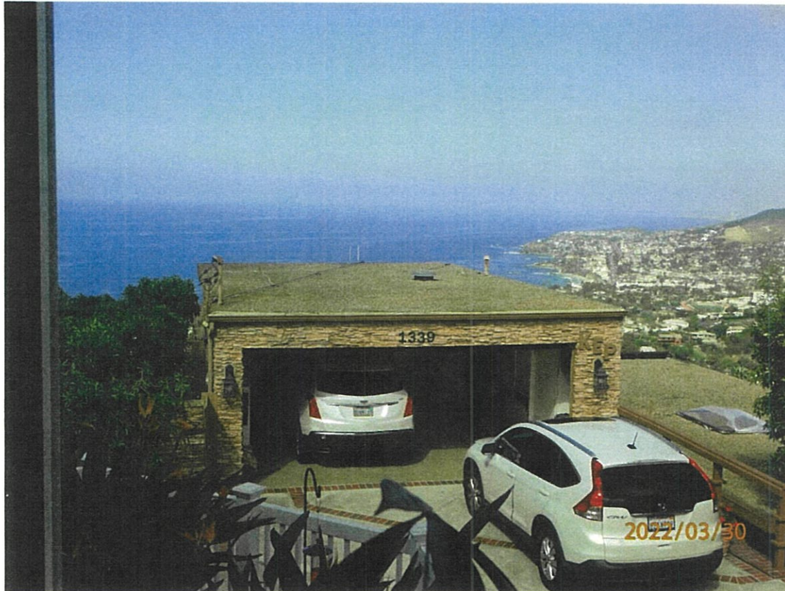
1331 La Mirada St.

The photograph above was taken from the primary bedroom on the lower level of the primary residential structure.