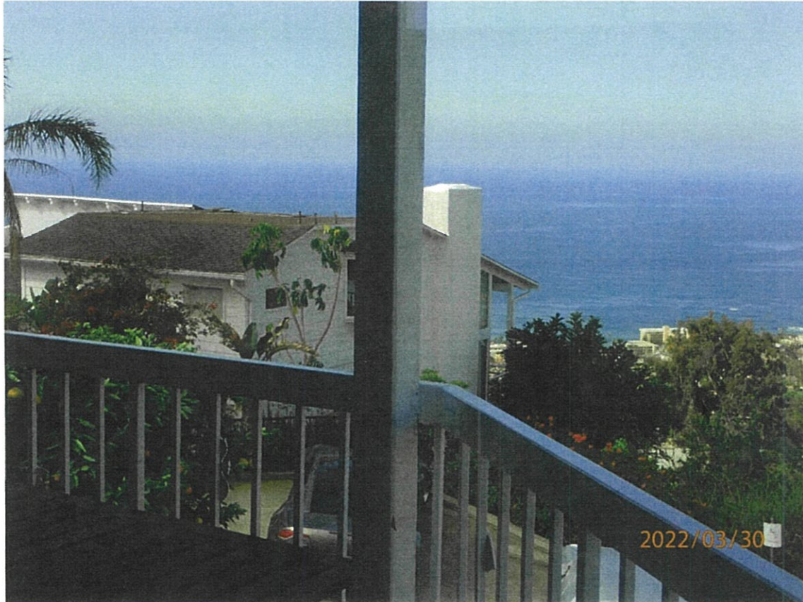
1331 La Mirada St.

The photograph above was taken from the living room on the upper level of the primary residential structure.