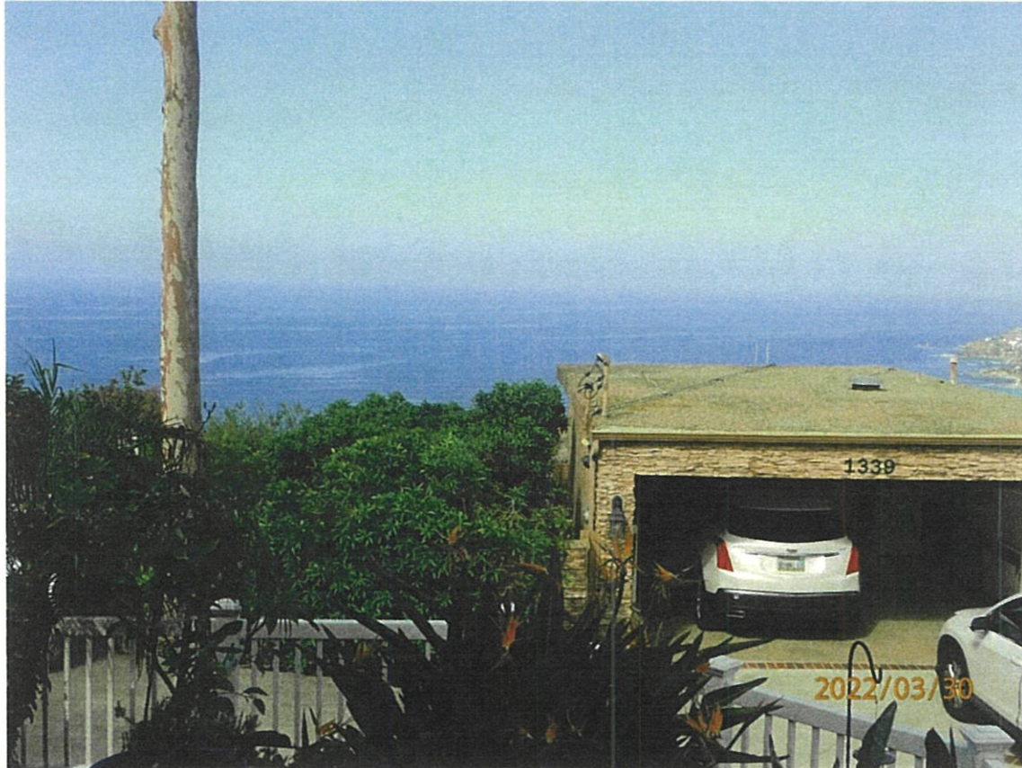
1331 La Mirada St.

The photograph above was taken from the primary bedroom on the lower level of the primary residential structure.