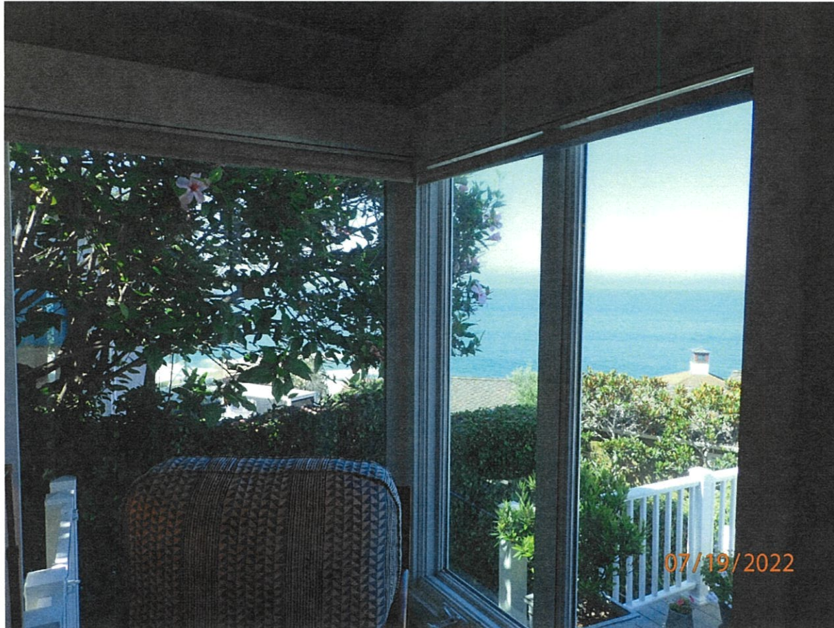
151 Rockledge Terrace

The photograph above was taken from the living room on the main level of the primary residential structure.