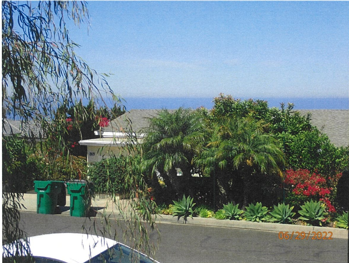
2828 Chillon Way

The photograph above was taken from the living room on the main level of the primary residential structure.