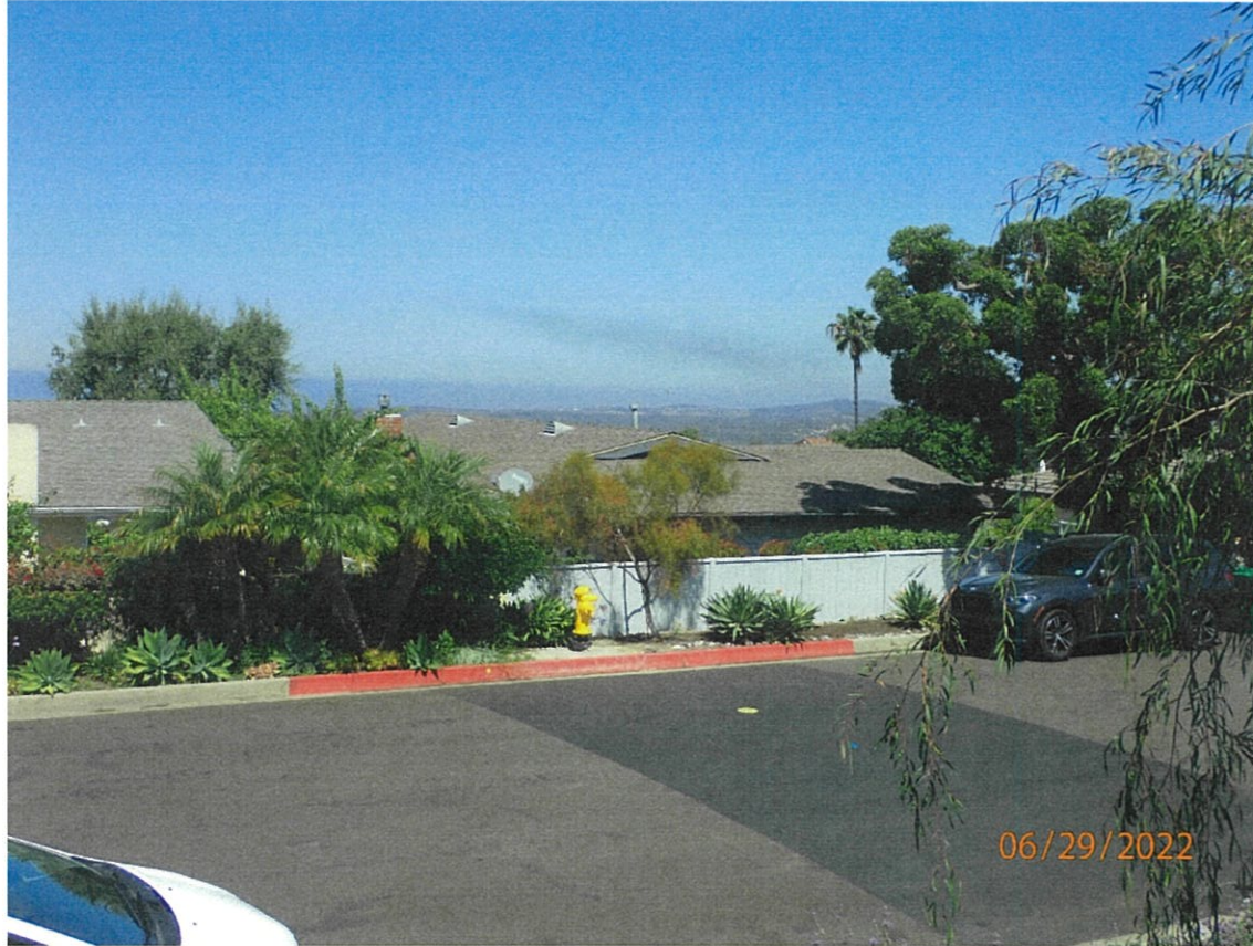
2828 Chillon Way

The photograph above was taken from the dining room on the main level of the primary residential structure.