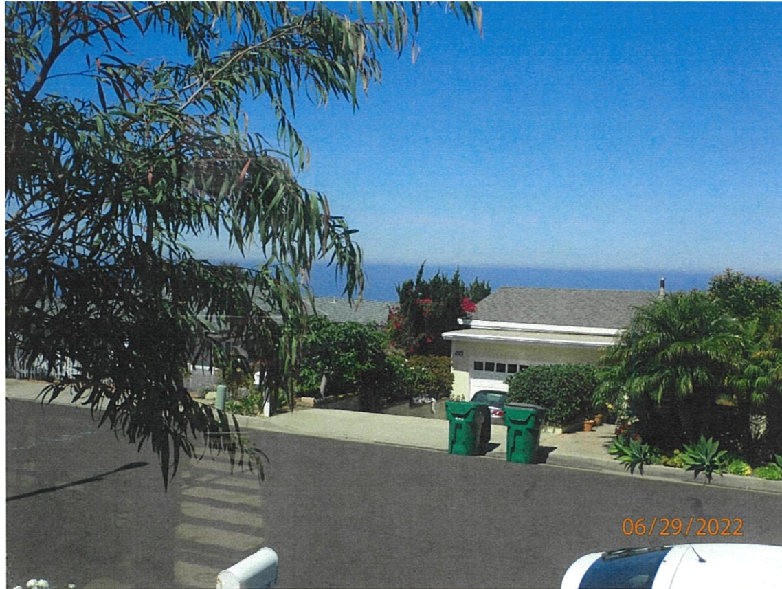
2828 Chillon Way

The photograph above was taken from the dining room on the main level of the primary residential structure.