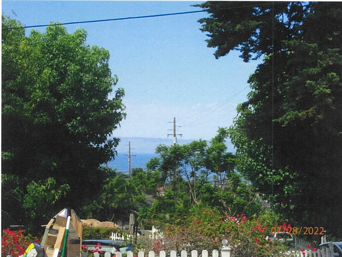
687 Thalia St.

The photograph above was taken from the dining room on the main level of the primary residential structure.