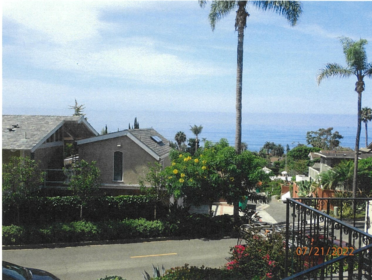
520 High Dr.

The photograph above was taken from the dining room on the main level of the primary residential structure.