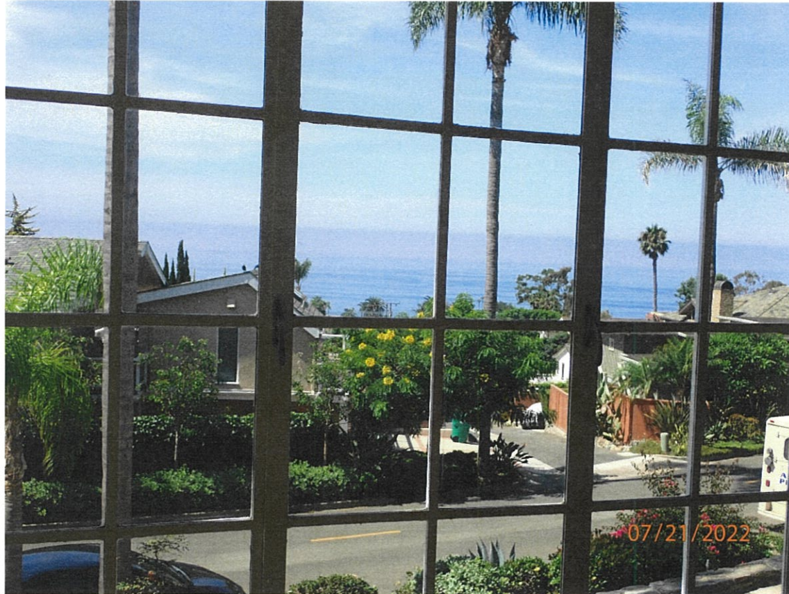
520 High Dr.

The photograph above was taken from the breakfast nook on the main level of the primary residential structure.