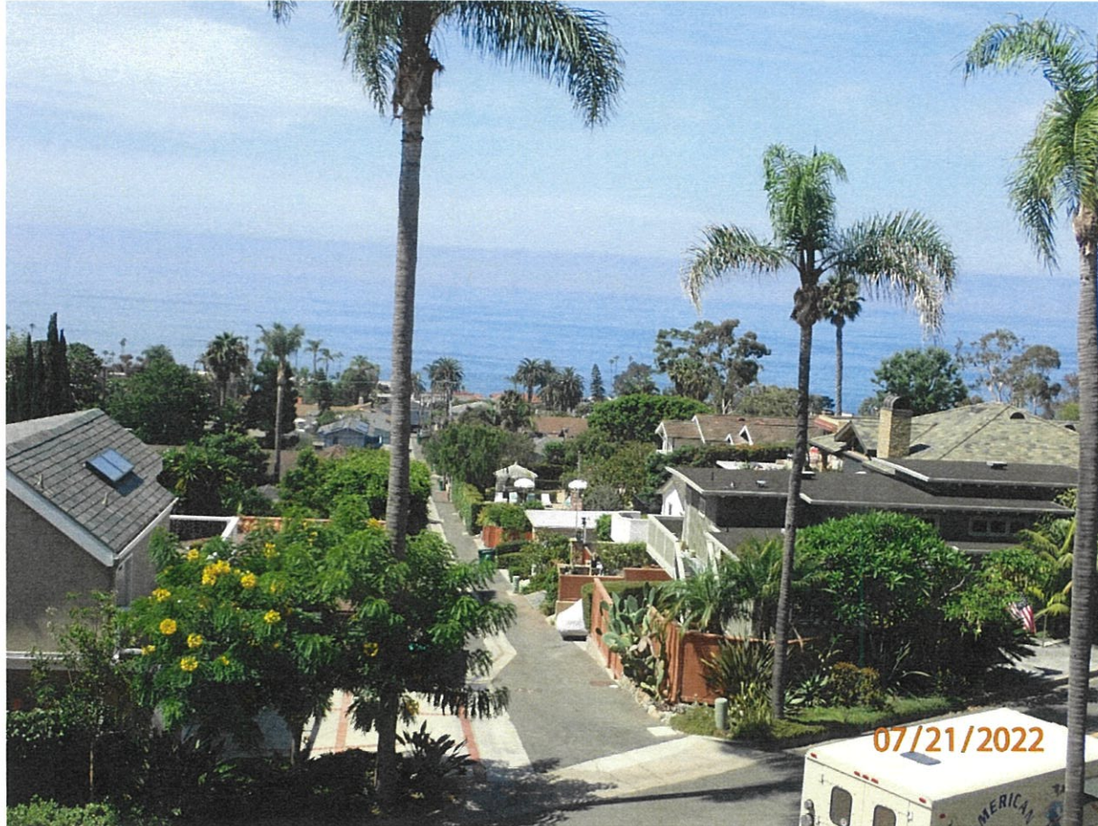
520 High Dr.

The photograph above was taken from the guest bedroom on the upper level of the primary residential structure.