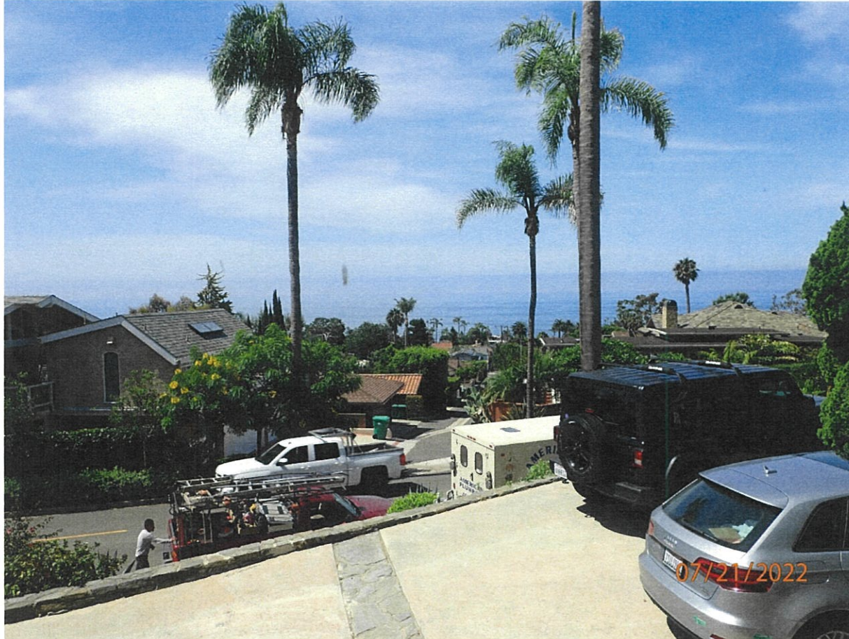
520 High Dr.

The photograph above was taken from the living room on the main level of the primary residential structure.