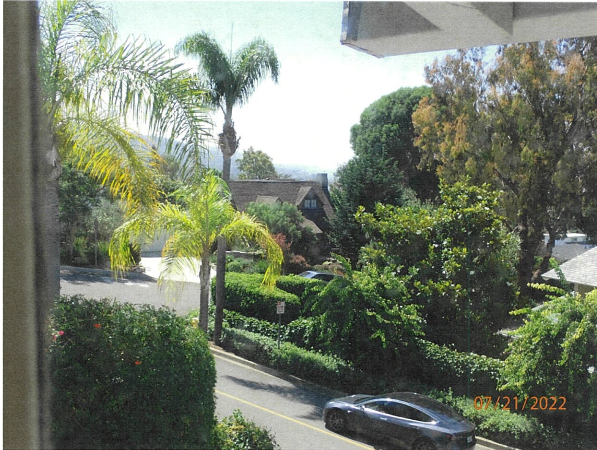
520 High Dr.

The photograph above was taken from the primary bedroom on the upper level of the primary residential structure.