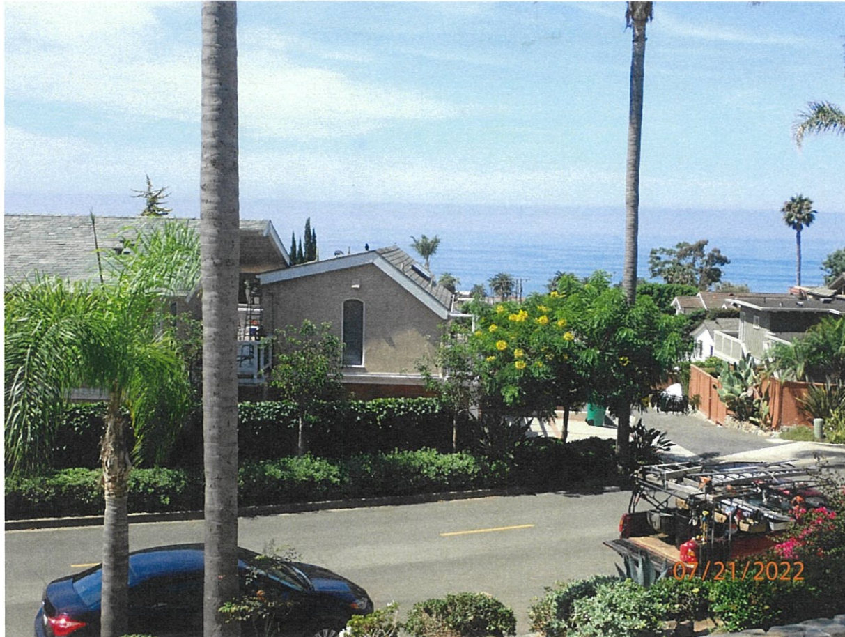
520 High Dr.

The photograph above was taken from the breakfast nook on the main level of the primary residential structure.