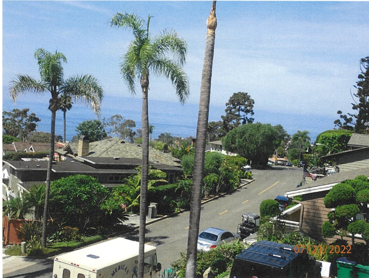
520 High Dr.

The photograph above was taken from the guest bedroom on the upper level of the primary residential structure.