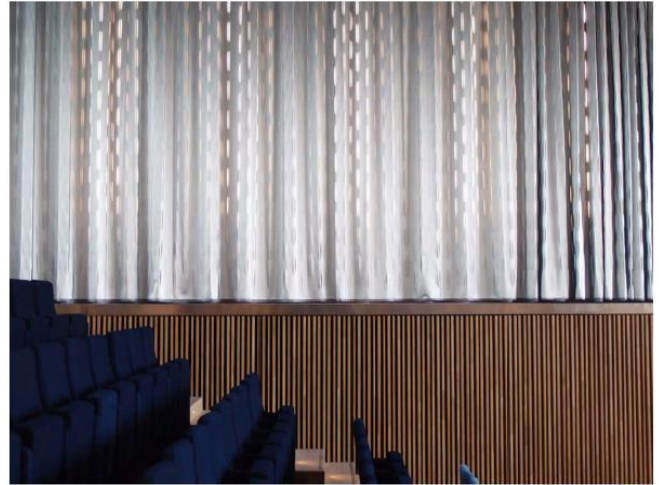
Place: Caen, France Client: Bibliothèque Multimédia à Vocation Régionale (BMVR) Architect: OMA Rotterdam Scope of work: Auditorium curtain and advisory on interior design