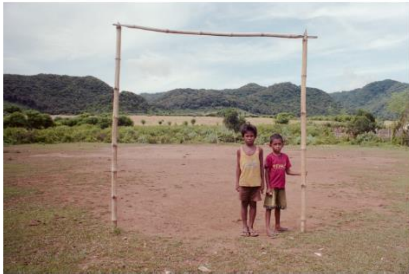
A PERFECTLY FRAMED PICTURE OF INDONESIAN YOUTH.