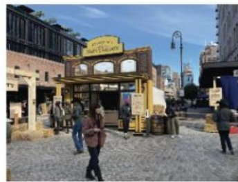
Netflix- Harder they fall popup NYC