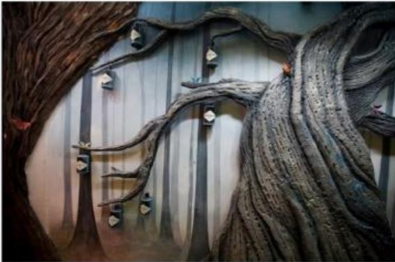
Hendrick's Gin Tree Detail