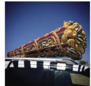
popcornopolis: promo vehicle