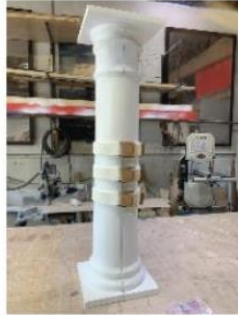
Adidas/ Ivy park