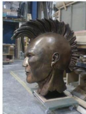
Diesel Jean Flagship NYC