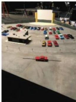
Once upon a time in hollywood drive in