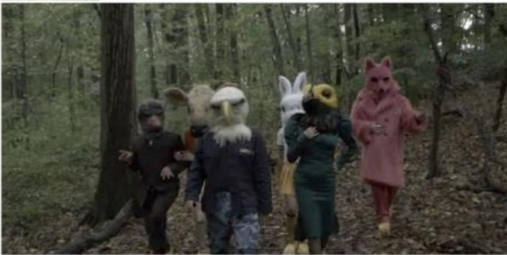
Odd Bunch Masks - These six masks were made for the film Asylum Seekers. They are made by hand from foam with real feathers and fur.