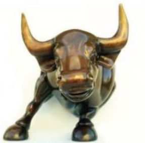
Charging bull replica Sorceres apprentice