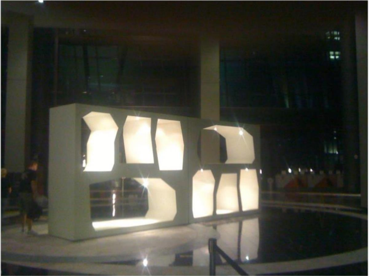
Display case for a furniture trade show

Event Work by Christopher Hawthorne at Coroflot.com