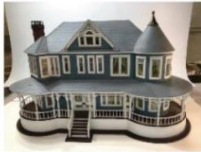
Sharp Objects HBO