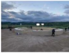
Kanye west, Sunday service Lasky mesa