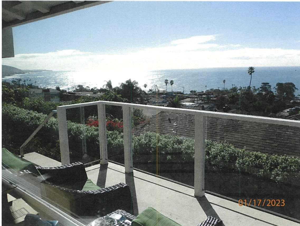
311 Viejo St.

The photograph above was taken from the office on the main level of the primary residential structure.