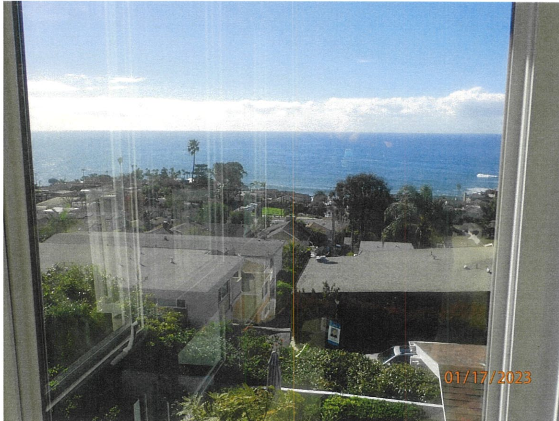
311 Viejo St.

The photograph above was taken from the primary bedroom on the upper level of the primary residential structure.