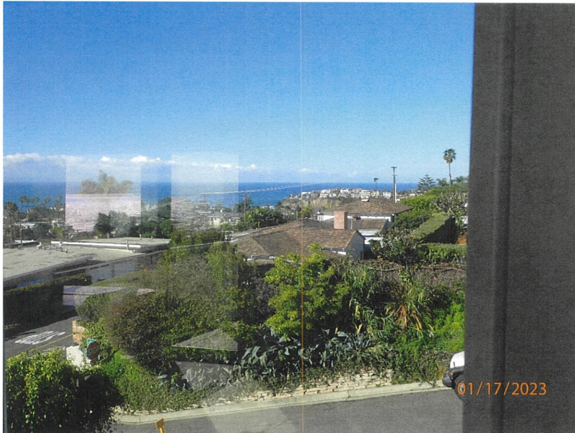
311 Viejo St.

The photograph above was taken from the dining room on the main level of the primary residential structure.