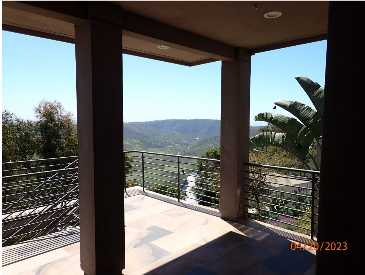
28792 Top Of The World Dr

The photograph above was taken from the lower level of the primary residential structure.