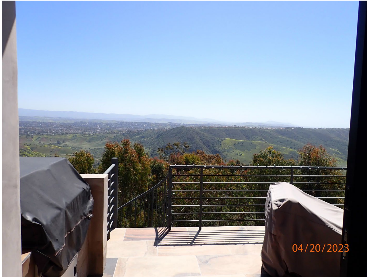
28792 Top Of The World Dr

The photograph above was taken from the main level of the primary residential structure.