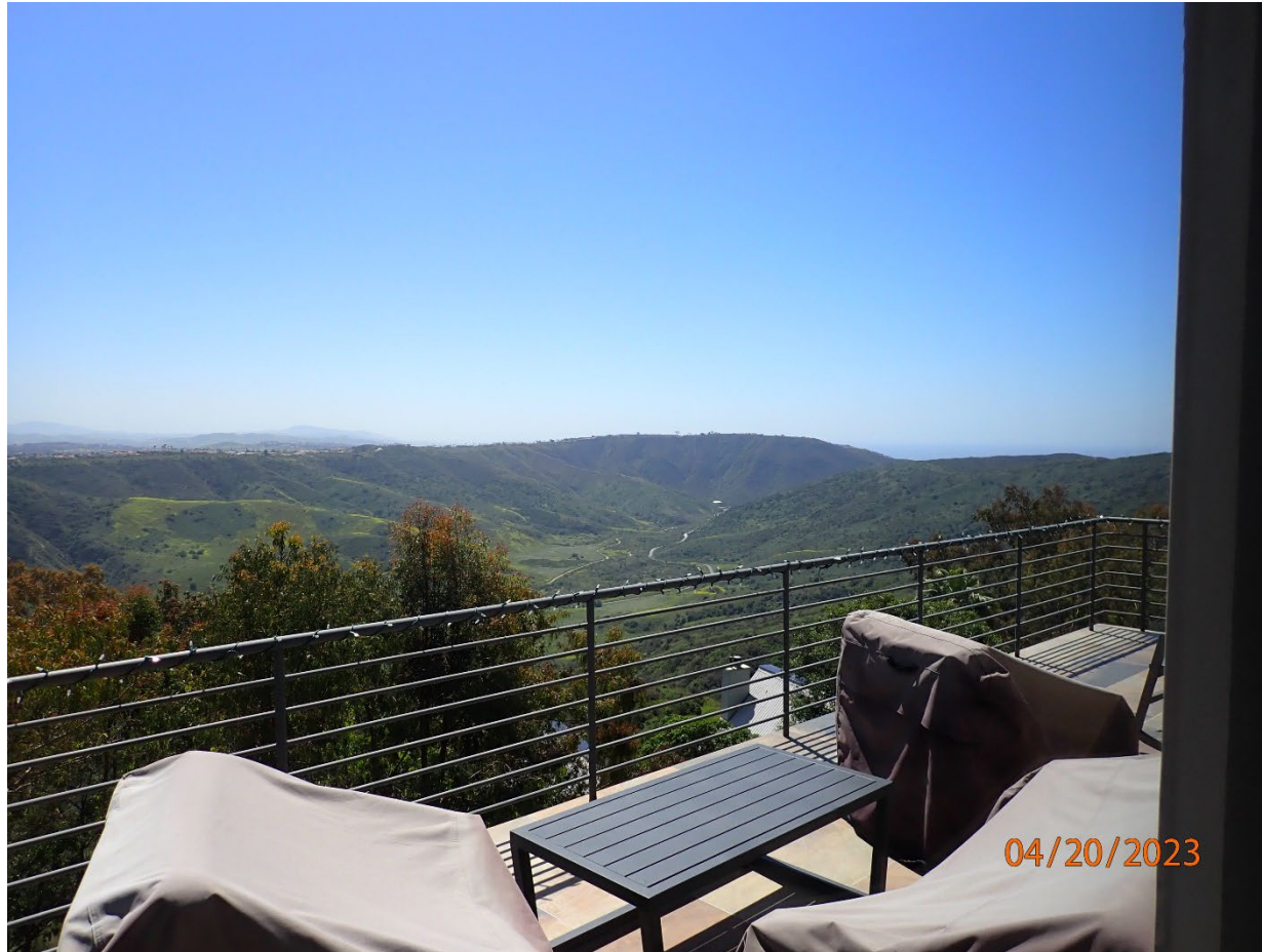
28792 Top Of The World Dr

The photograph above was taken from the main level of the primary residential structure.