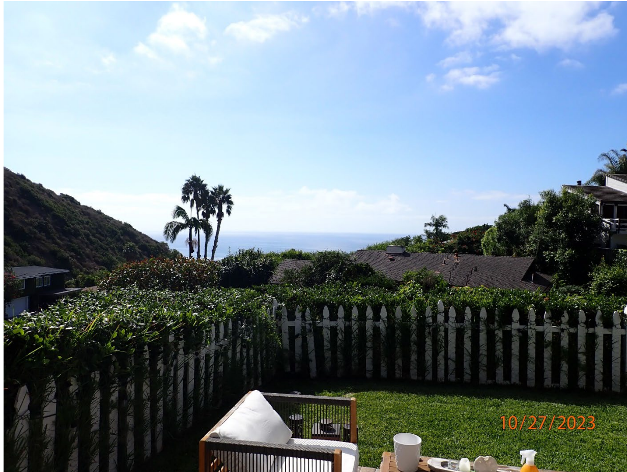
1184 Skyline Dr

The photograph above was taken from the living room on the main level of the primary residential structure.