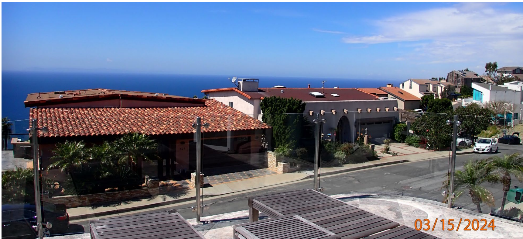
624 Loretta Drive

The photograph above was taken from the living room on the upper level of primary residential structure.