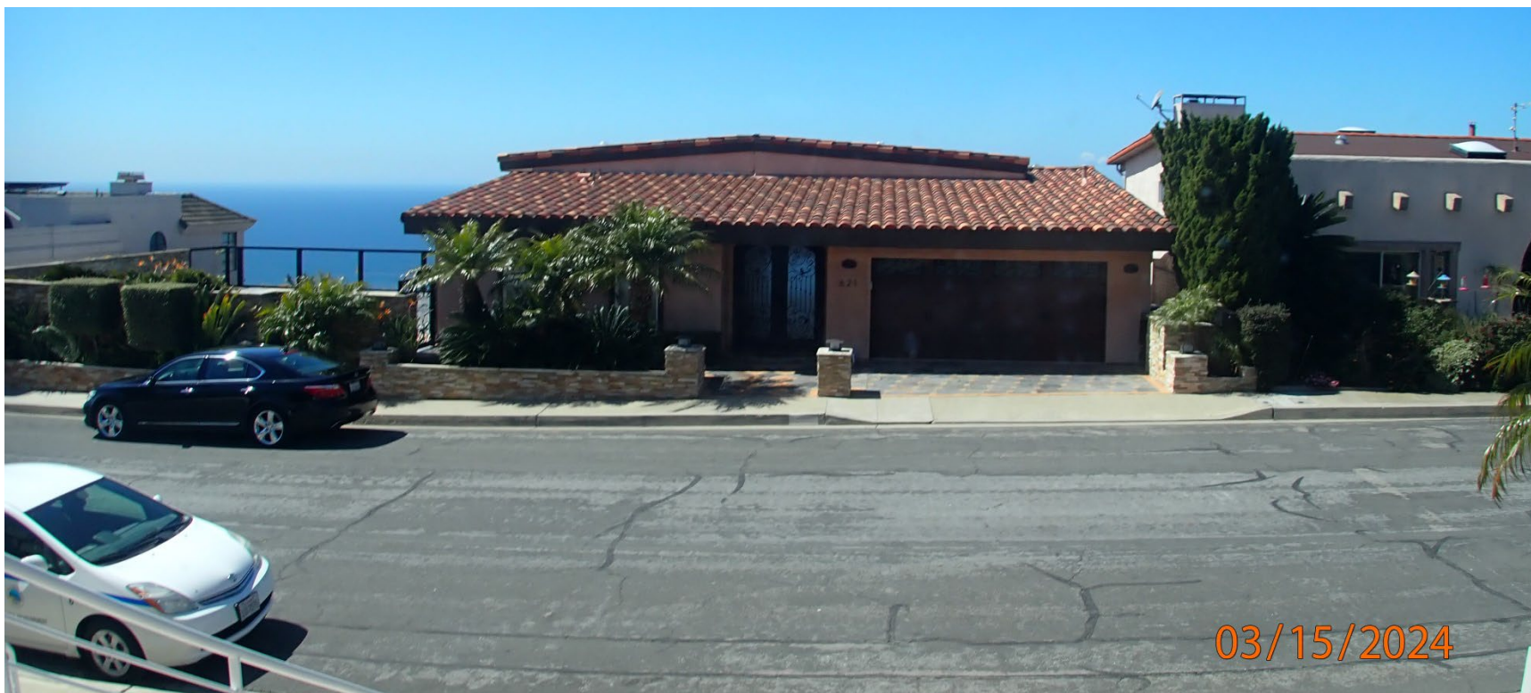
624 Loretta Drive

The photograph above was taken from the guest bedroom on the main level of primary residential structure.