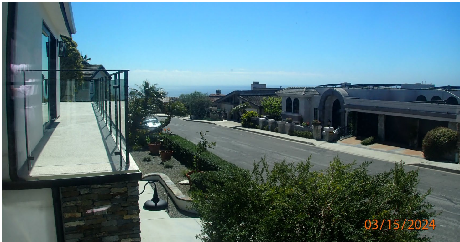
624 Loretta Drive

The photograph above was taken from the master bedroom on the main level of primary residential structure. Visual scene description: Ocean horizon.