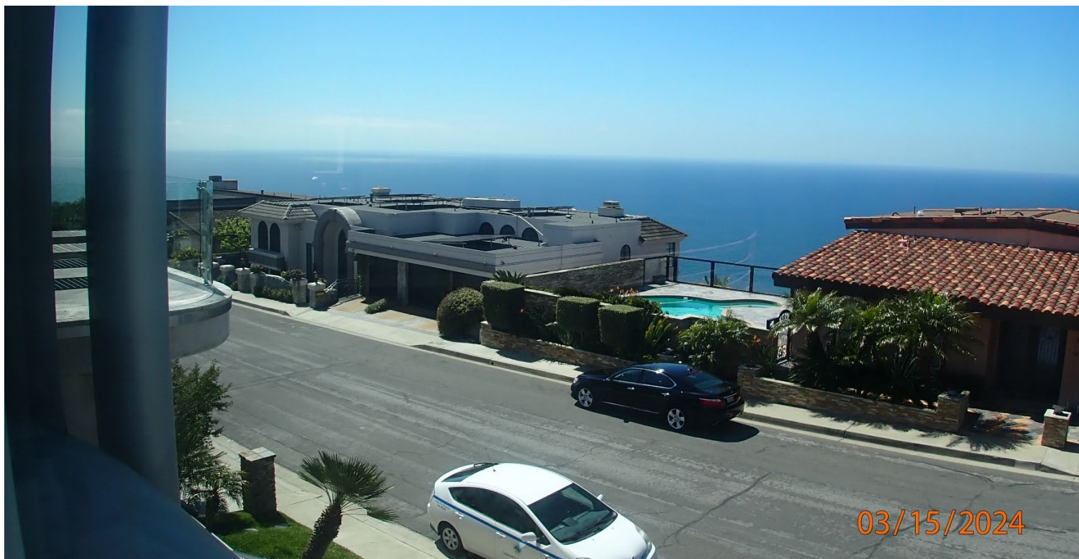
624 Loretta Drive

The photograph above was taken from the office on the upper level of primary residential structure.