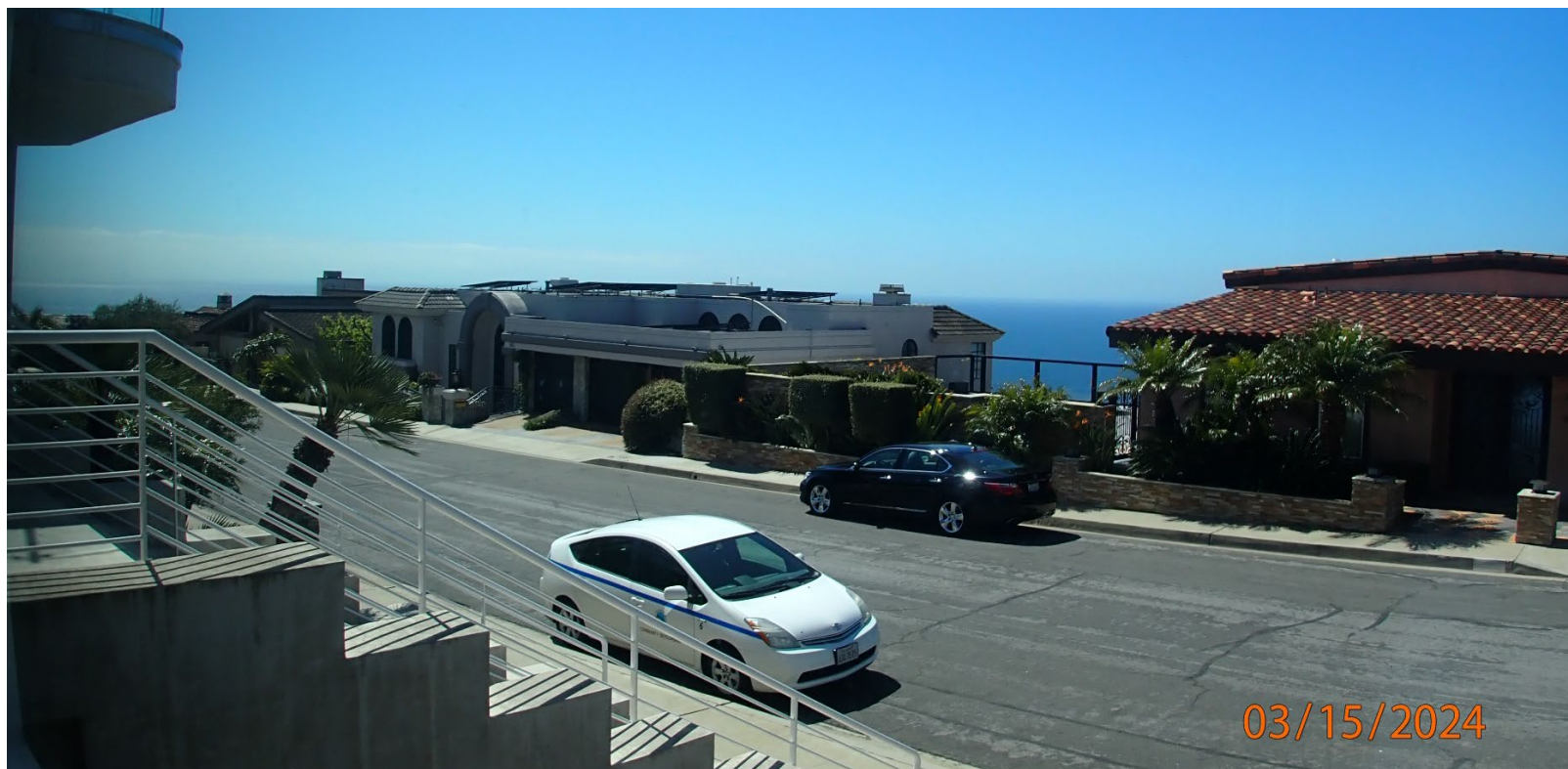
624 Loretta Drive

The photograph above was taken from the guest bedroom on the main level of primary residential structure.