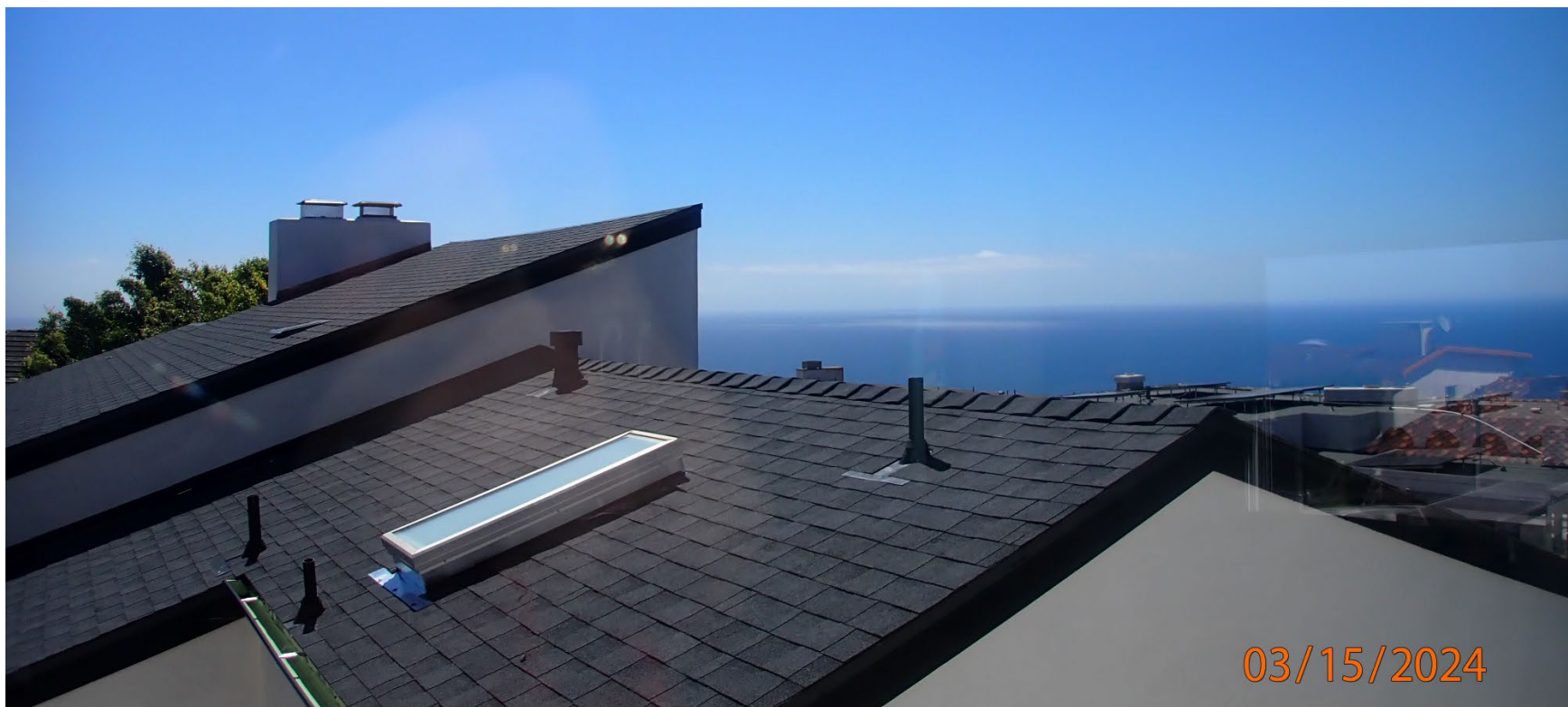
624 Loretta Drive

The photograph above was taken from the kitchen on the upper level of primary residential structure.