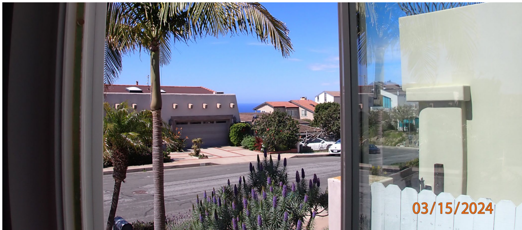
624 Loretta Drive

The photograph above was taken from the guest bedroom on the main level of primary residential structure.