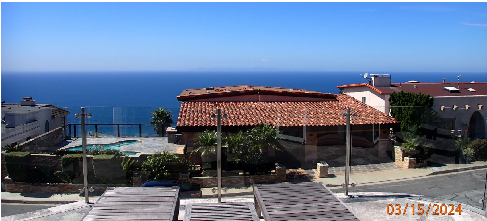
624 Loretta Drive

The photograph above was taken from the living room on the upper level of primary residential structure.