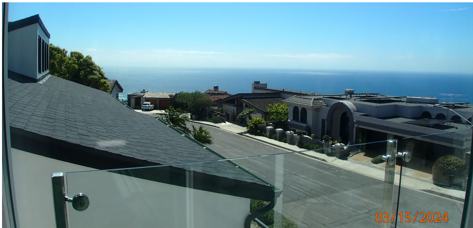
624 Loretta Drive

The photograph above was taken from the living room on the upper level of primary residential structure.