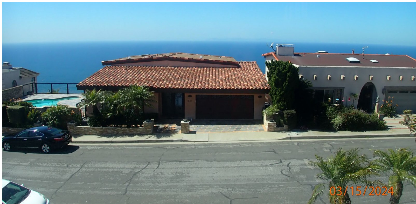
624 Loretta Drive

The photograph above was taken from the office on the upper level of primary residential structure.