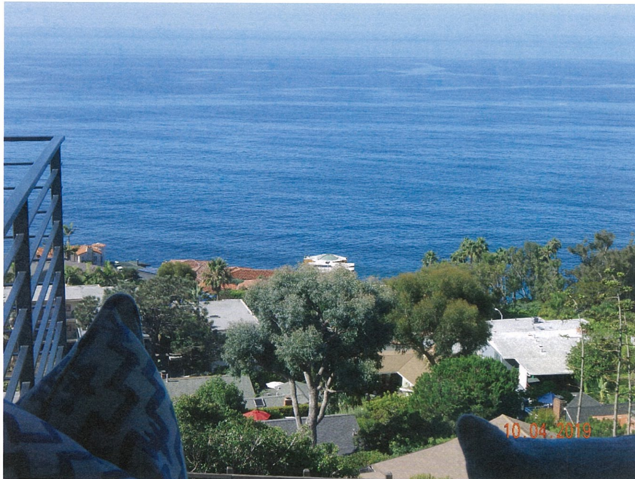
376 Alta Vista Way

The photograph above was taken from the dining room/living room on the main floor of the primary residential structure.