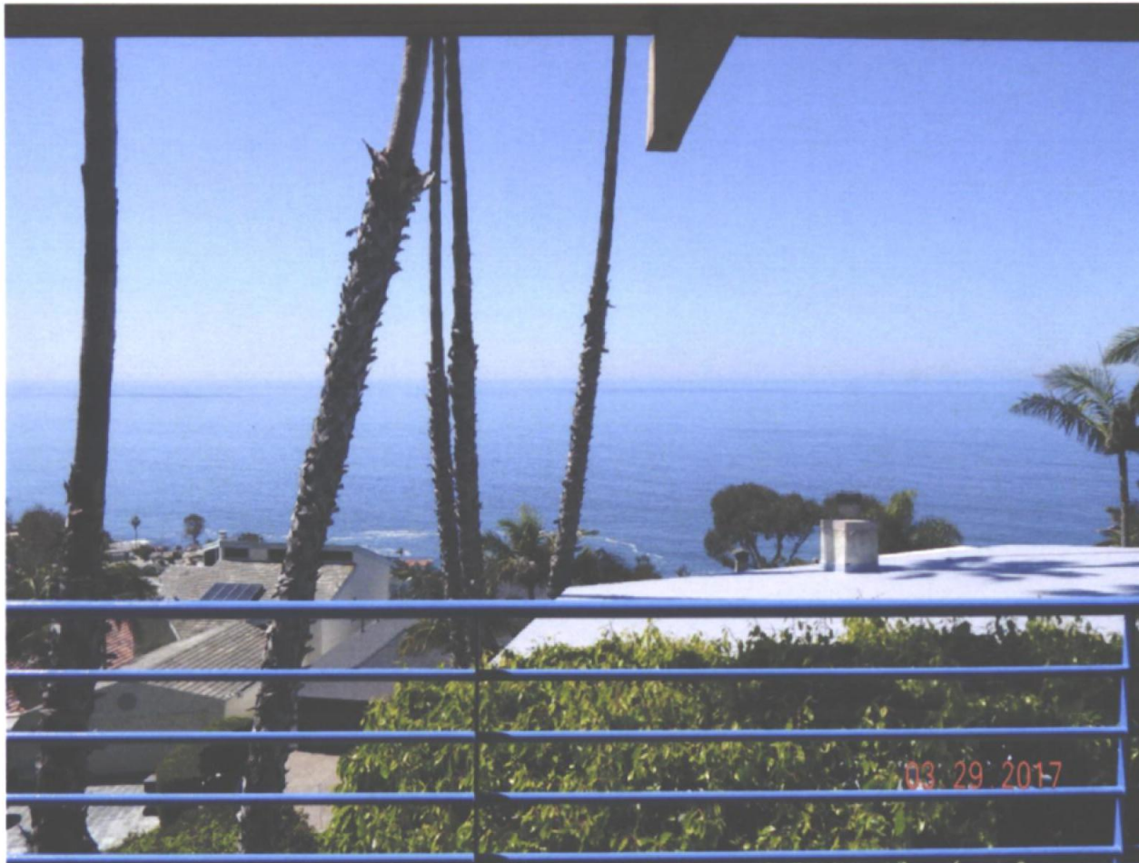
465 Alta Vista Way

The photograph above was taken from the master bedroom on the main level of the primary residential structure.