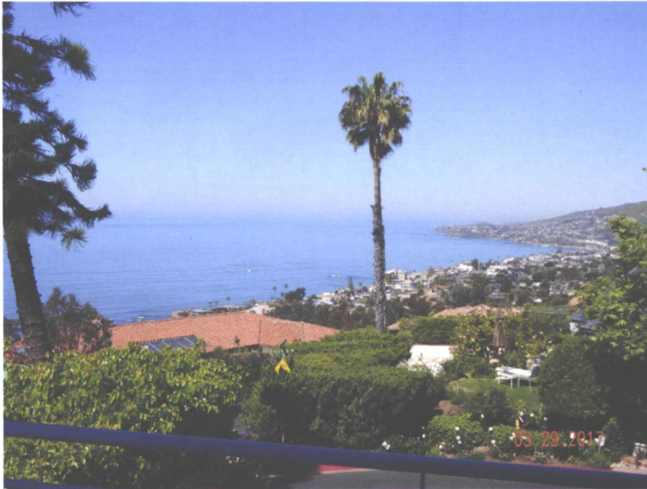
465 Alta Vista Way

The photograph above was taken from the living room/dining room/kitchen on the main level of the primary residential structure.