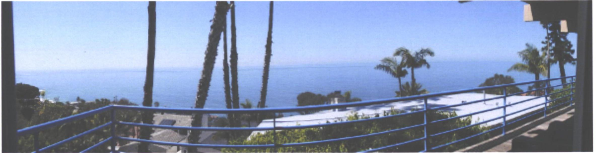
465 Alta Vista Way

The photograph above was taken from the master bedroom on the main level of the primary residential structure.