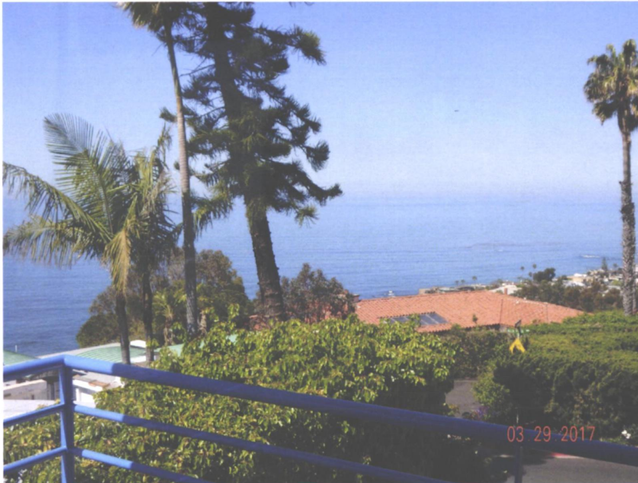
465 Alta Vista Way

The photograph above was taken from the living room/dining room/kitchen on the main level of the primary residential structure.