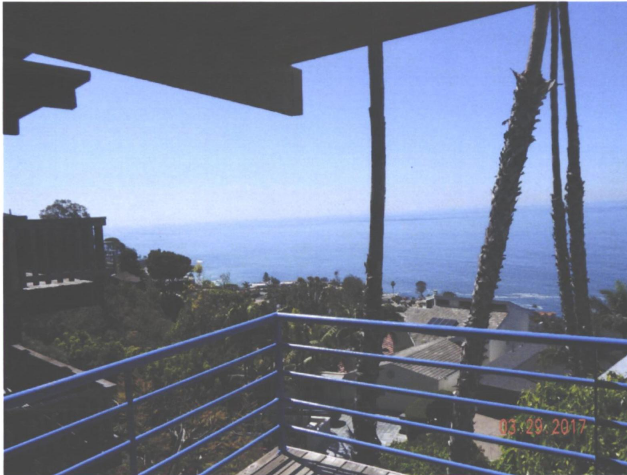
465 Alta Vista Way

The photograph above was taken from the master bedroom on the main level of the primary residential structure.