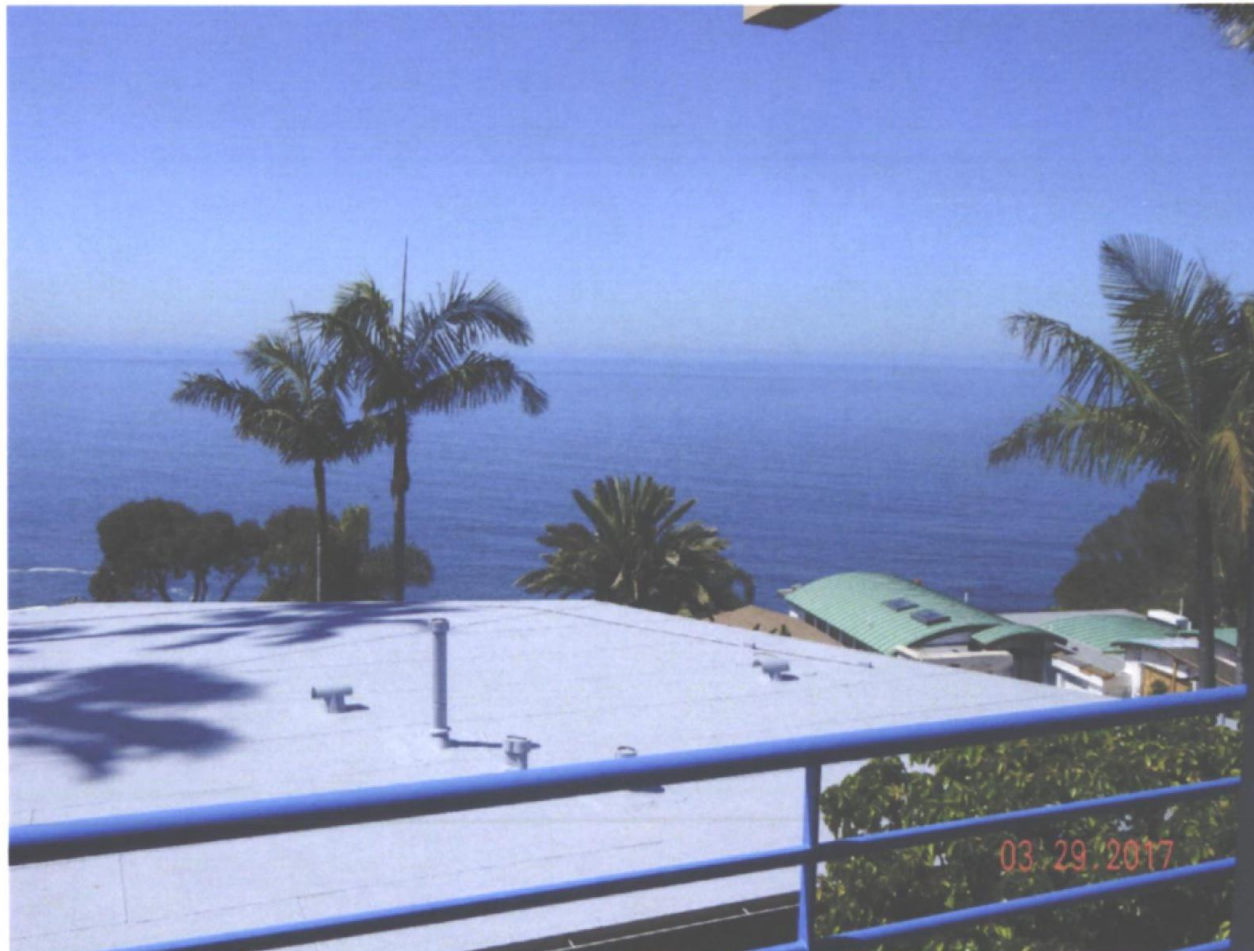
465 Alta Vista Way

The photograph above was taken from the living room/dining room/kitchen on the main level of the primary residential structure.