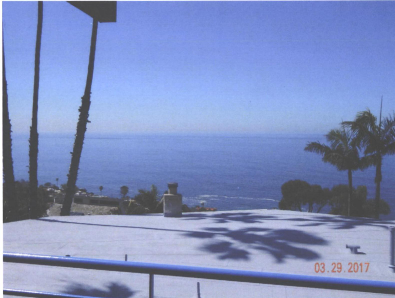
465 Alta Vista Way

The photograph above was taken from the living room/dining room/kitchen on the main level of the primary residential structure.