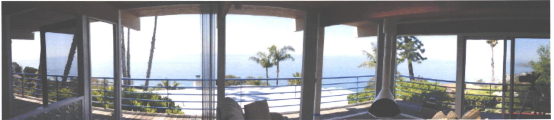
465 Alta Vista Way

The photograph above was taken from the living room/kitchen on the main level of the primary residential structure.