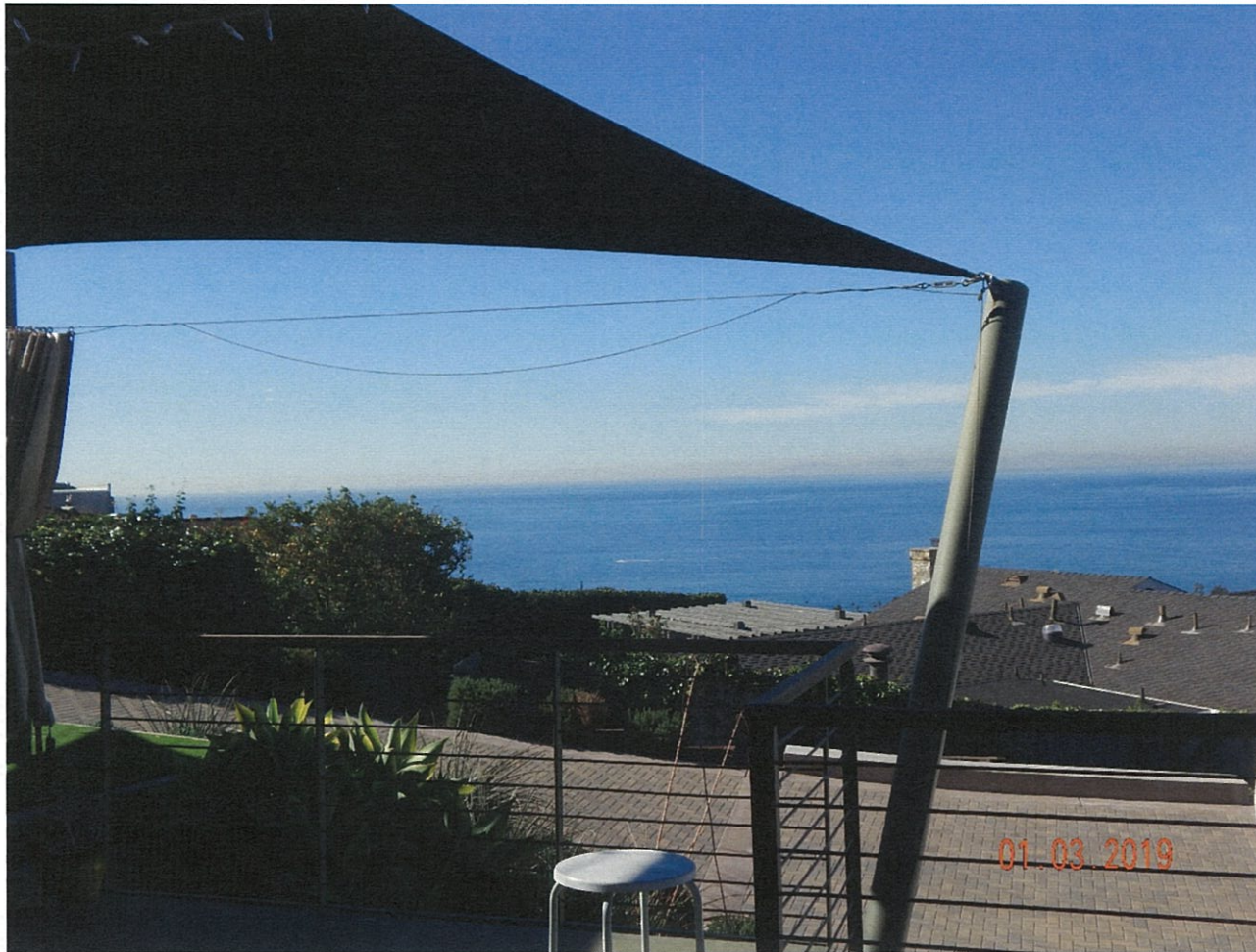
681 Bayview Pl.

The photograph above was taken from the kitchen/dining room on the main level of the primary residential structure.