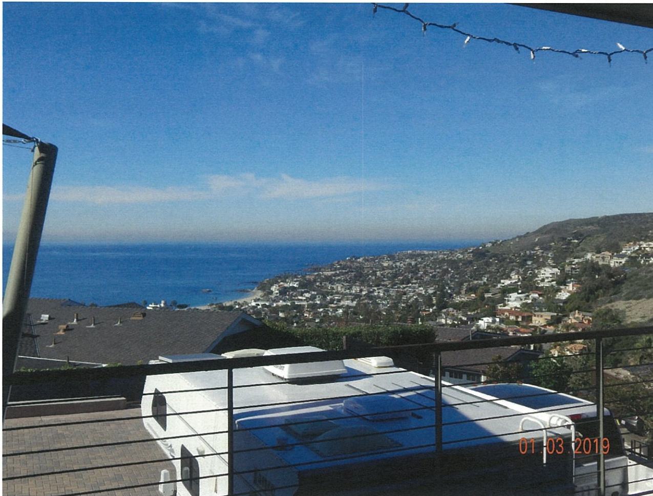
681 Bayview Pl.

The photograph above was taken from the kitchen/dining room on the main level of the primary residential structure.