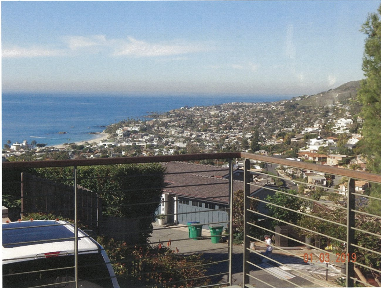
681 Bayview Pl.

The photograph above was taken from the living room on the main level of the primary residential structure.