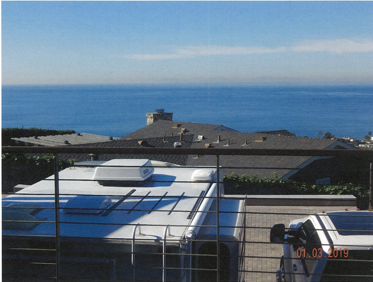
681 Bayview Pl.

The photograph above was taken from the living room on the main level of the primary residential structure.