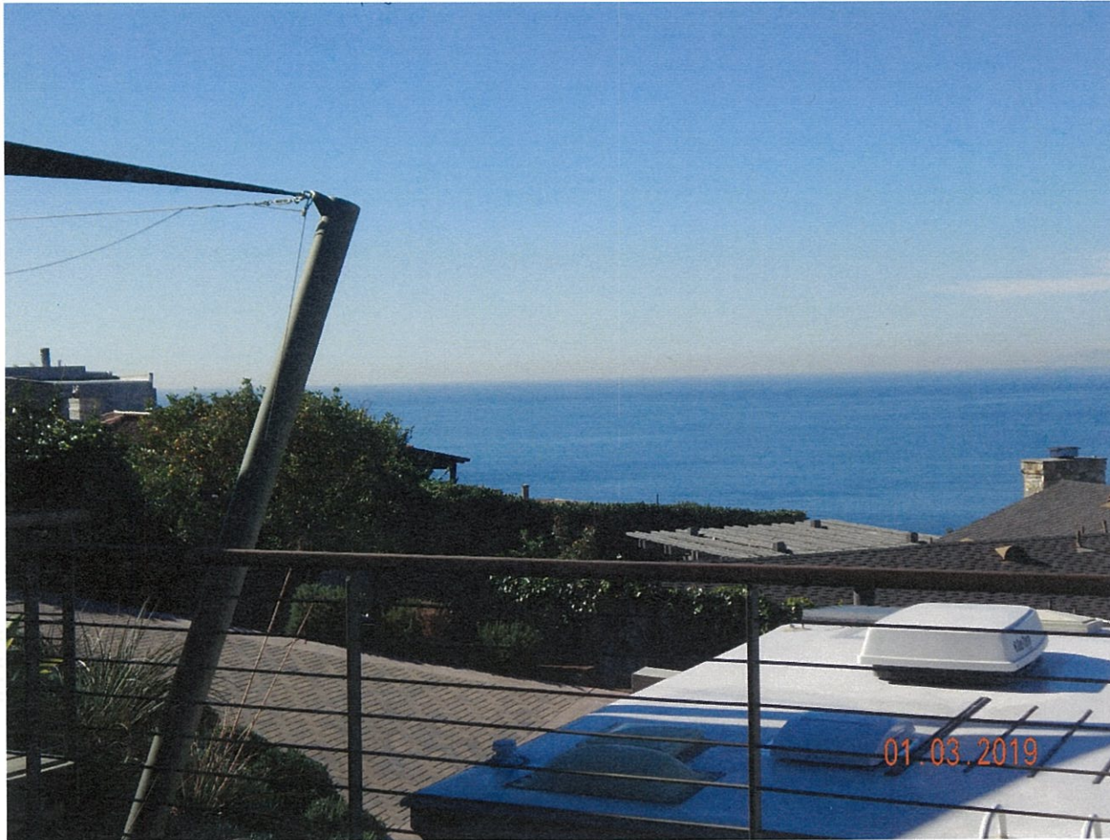
681 Bayview Pl.

The photograph above was taken from the living room on the main level of the primary residential structure.