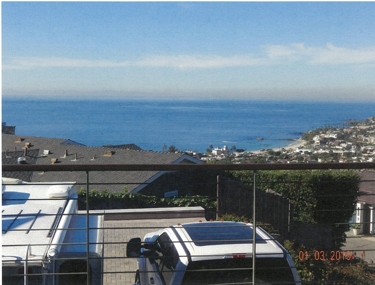
681 Bayview Pl.

The photograph above was taken from the living room on the main level of the primary residential structure.