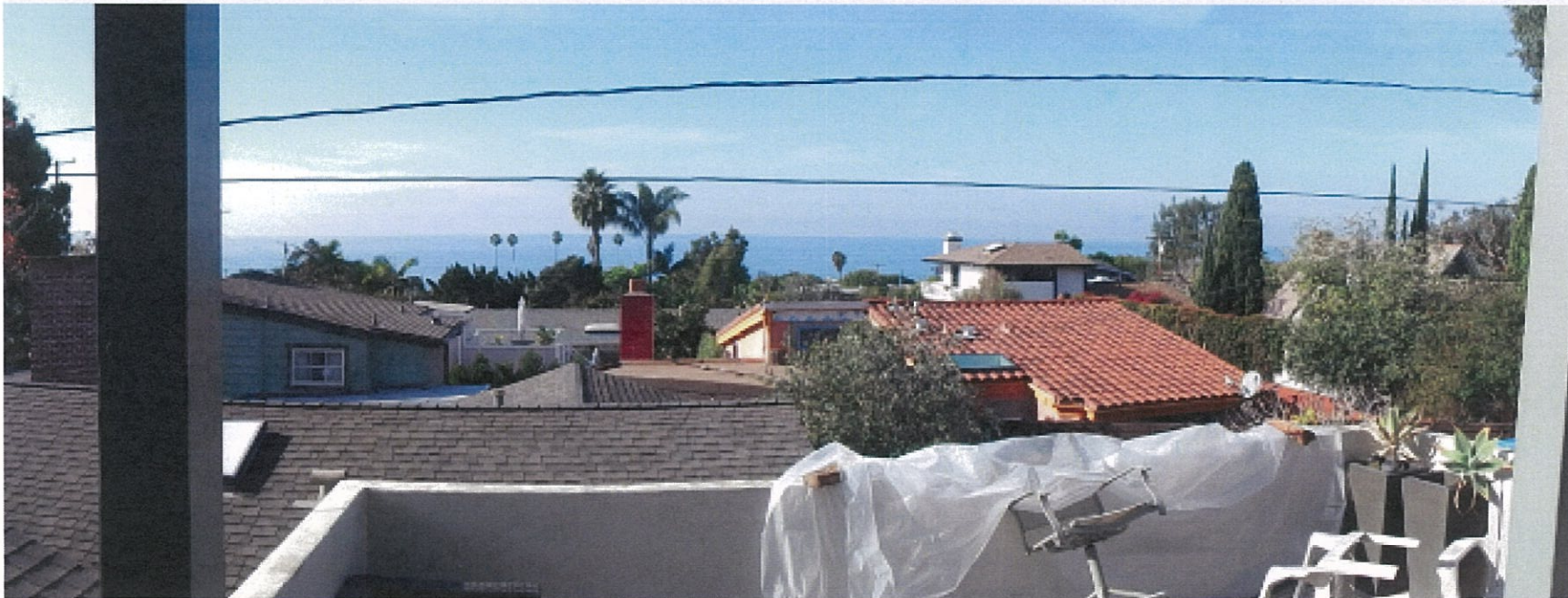
610 Brooks Street

The photograph above was taken from the master bedroom on the upper floor of the primary residential structure.