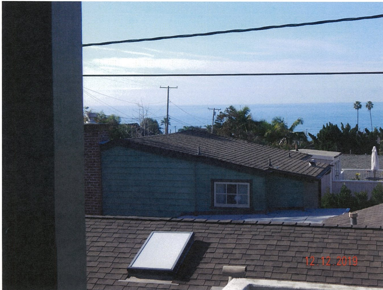
610 Brooks Street

The photograph above was taken from the master bedroom on the upper floor of the primary residential structure.