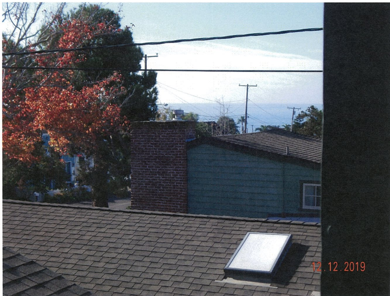
610 Brooks Street

The photograph above was taken from the master bedroom on the upper floor of the primary residential structure.