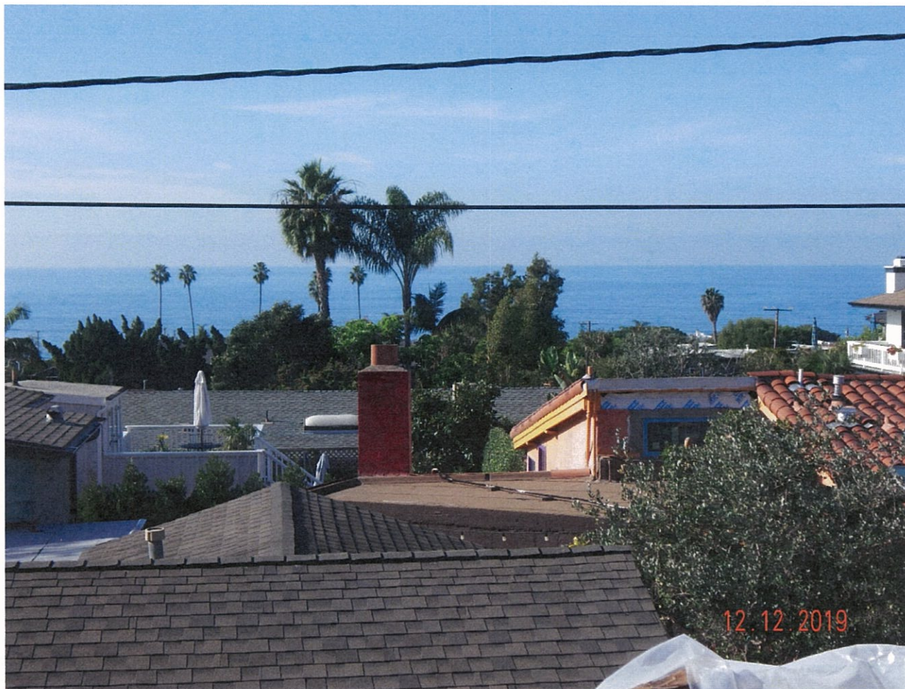
610 Brooks Street

The photograph above was taken from the master bedroom on the upper floor of the primary residential structure.