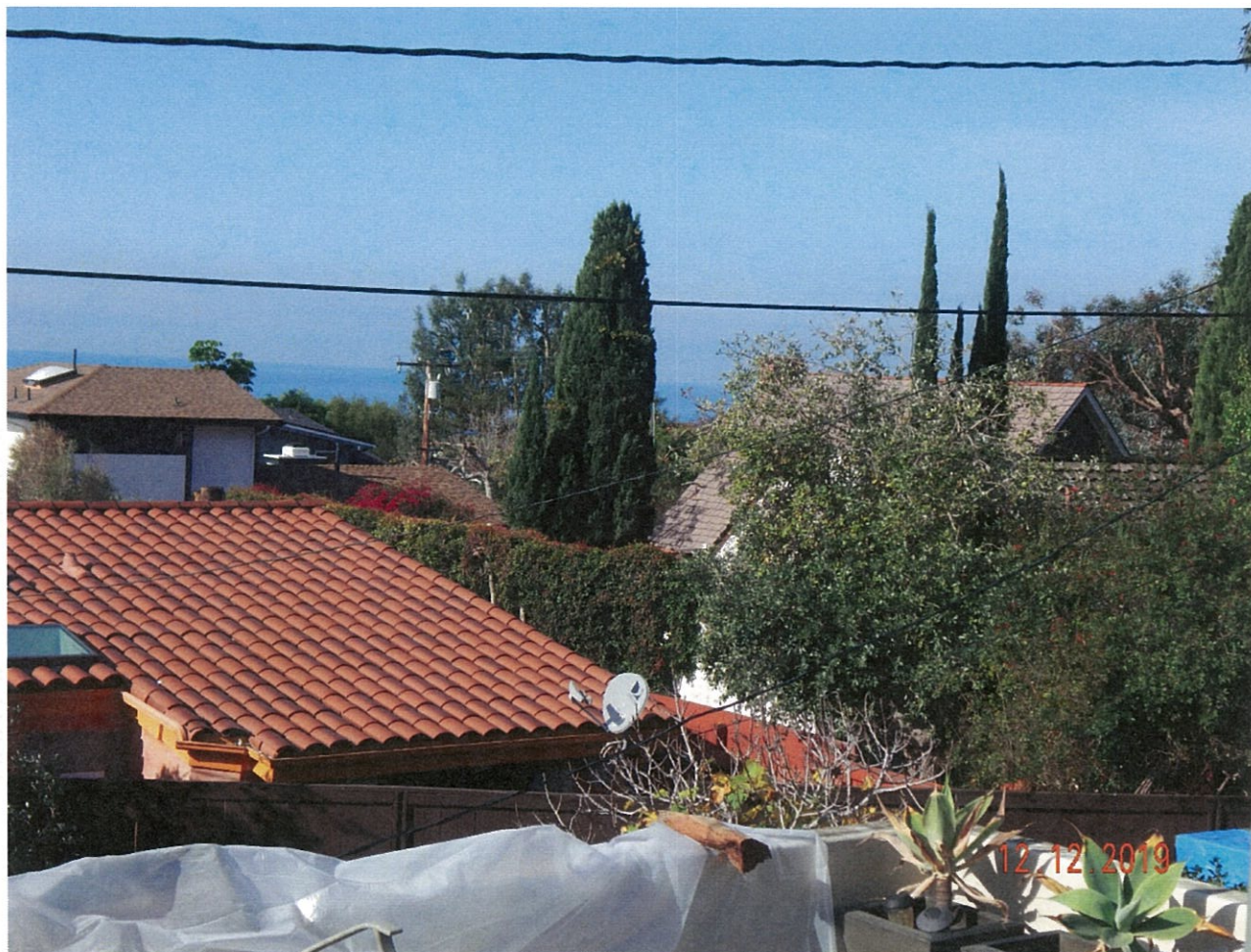
610 Brooks Street

The photograph above was taken from the master bedroom on the upper floor of the primary residential structure.