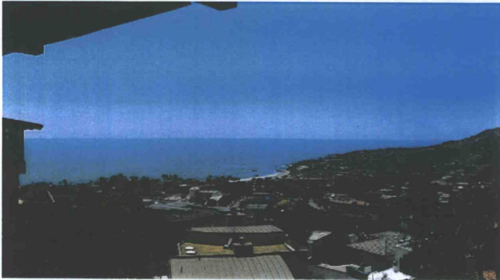
669 Canyon View Drive

The photograph above was taken from the Living room/Dining room on the main level of the primary residential structure. Visual scene description: Catalina Island, Hotel Laguna, Main Beach, Bird Rock, Heisler Park, beaches, whitewater, ocean horizon, city lights and hillside terrain.