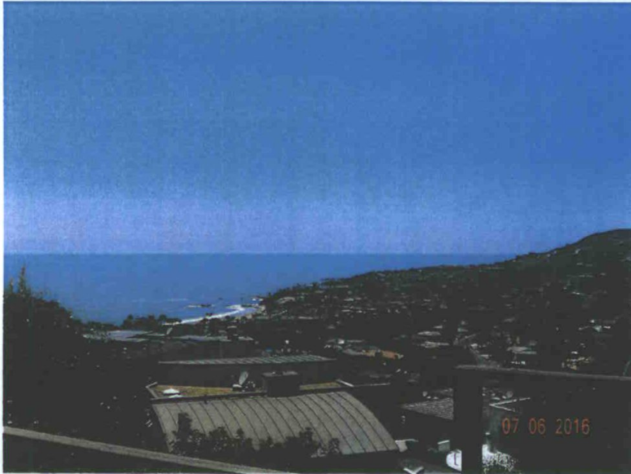
669 Canyon View Drive

The photograph above was taken from the Family room on the lower level of the primary residential structure.