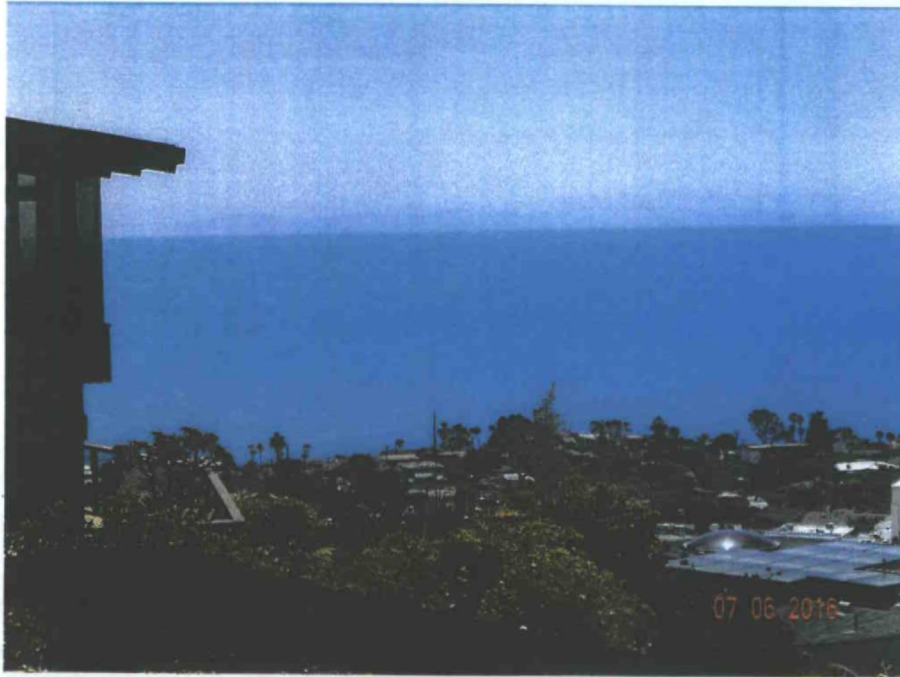
669 Canyon View Drive

The photograph above was taken from the Living room/Dining room on the main level of the primary residential structure.