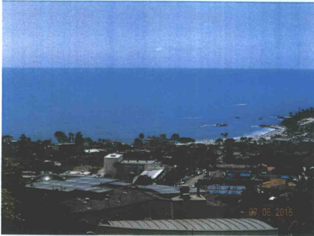
669 Canyon View Drive

The photograph above was taken from the Living room/Dining room on the main level of the primary residential structure. Visual scene description: Catalina Island, San Clemente Island, Hotel Laguna, Main Beach, Bird Rock, Heisler Park, whitewater, ocean horizon, city lights and hillside terrain.