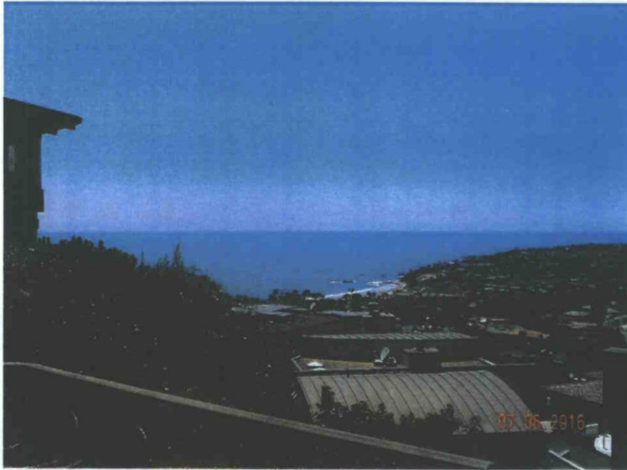
669 Canyon View Drive

The photograph above was taken from the Family room on the lower level of the primary residential structure.