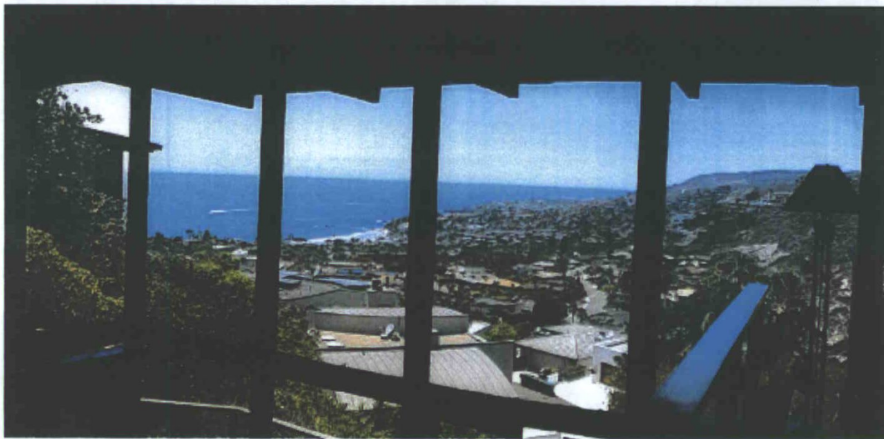
669 Canyon View Drive

The photograph above was taken from the Living room/Dining room on the main level of the primary residential structure.