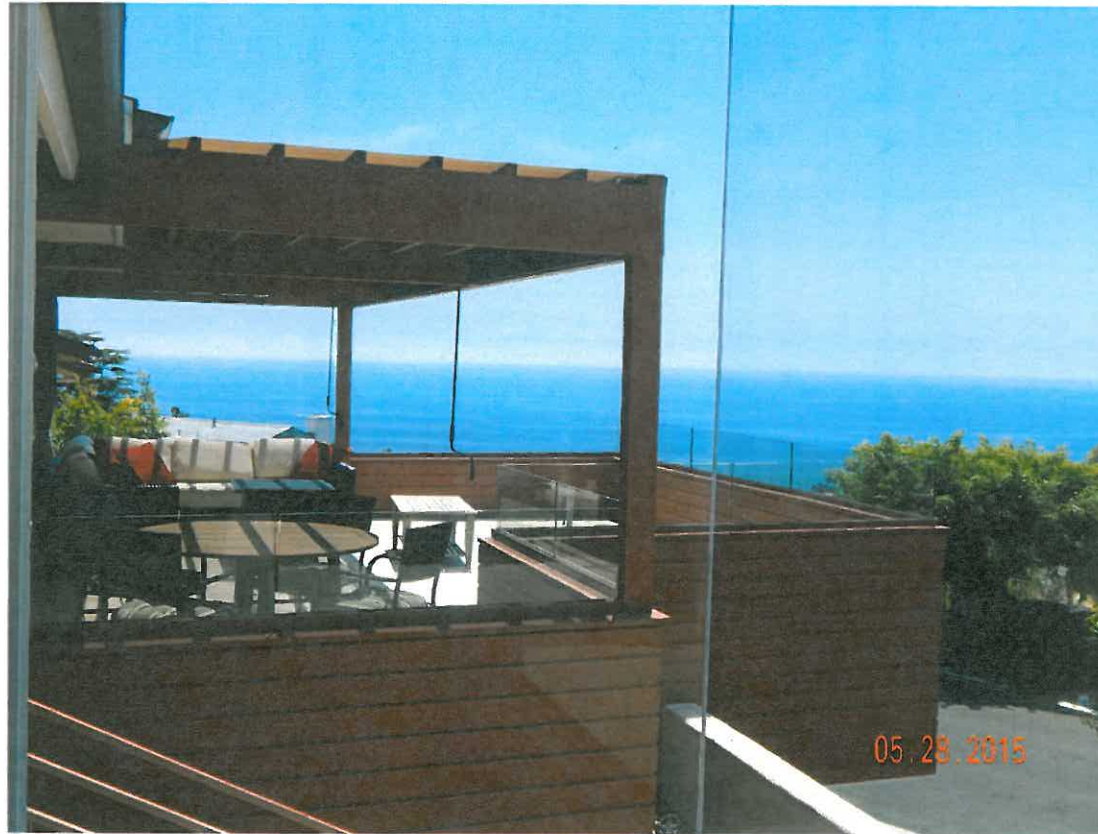
960 Canyon View Dr.

The photograph above was taken from the property owners' kitchen in the primary residential structure. Visual scene description: Ocean horizon, San Clemente Island.