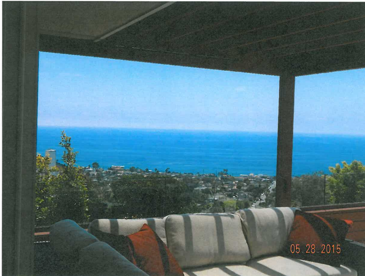
960 Canyon View Dr.

The photograph above was taken from the property owners' living room in the primary residential structure.