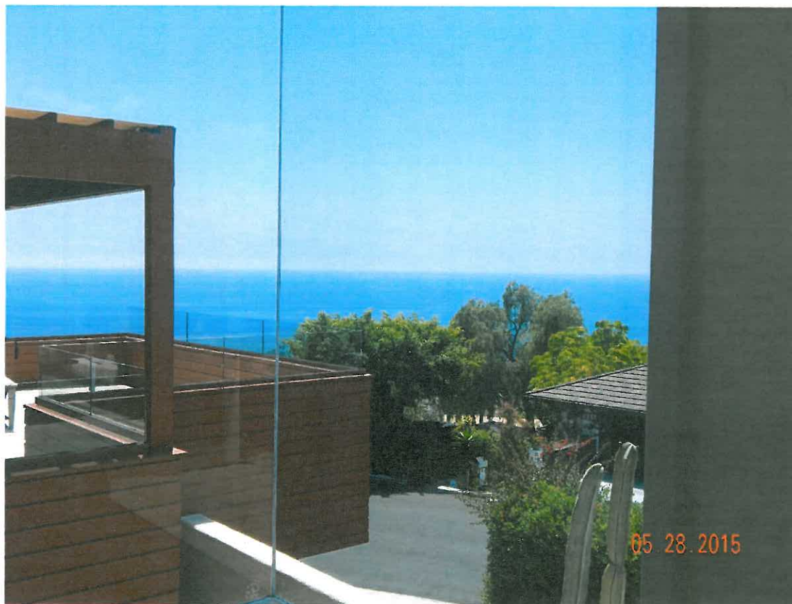
960 Canyon View Dr.

The photograph above was taken from the property owners' kitchen in the primary residential structure.