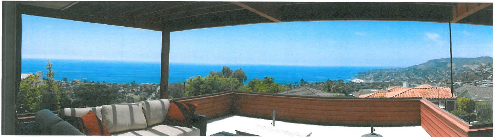
960 Canyon View Dr.

The photograph above was taken from the property owners' living room in the primary residential structure.