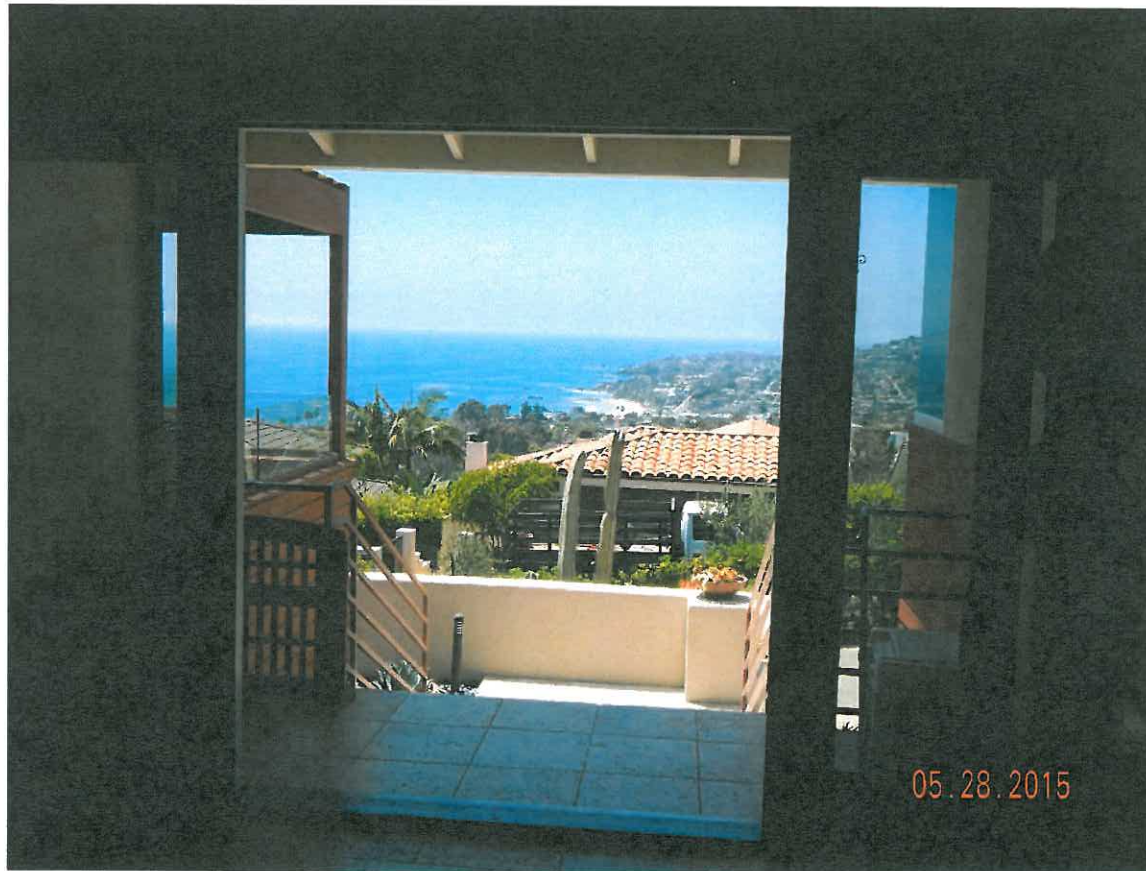
960 Canyon View Dr.

The photograph above was taken from the property owners' dining room in the primary residential structure.