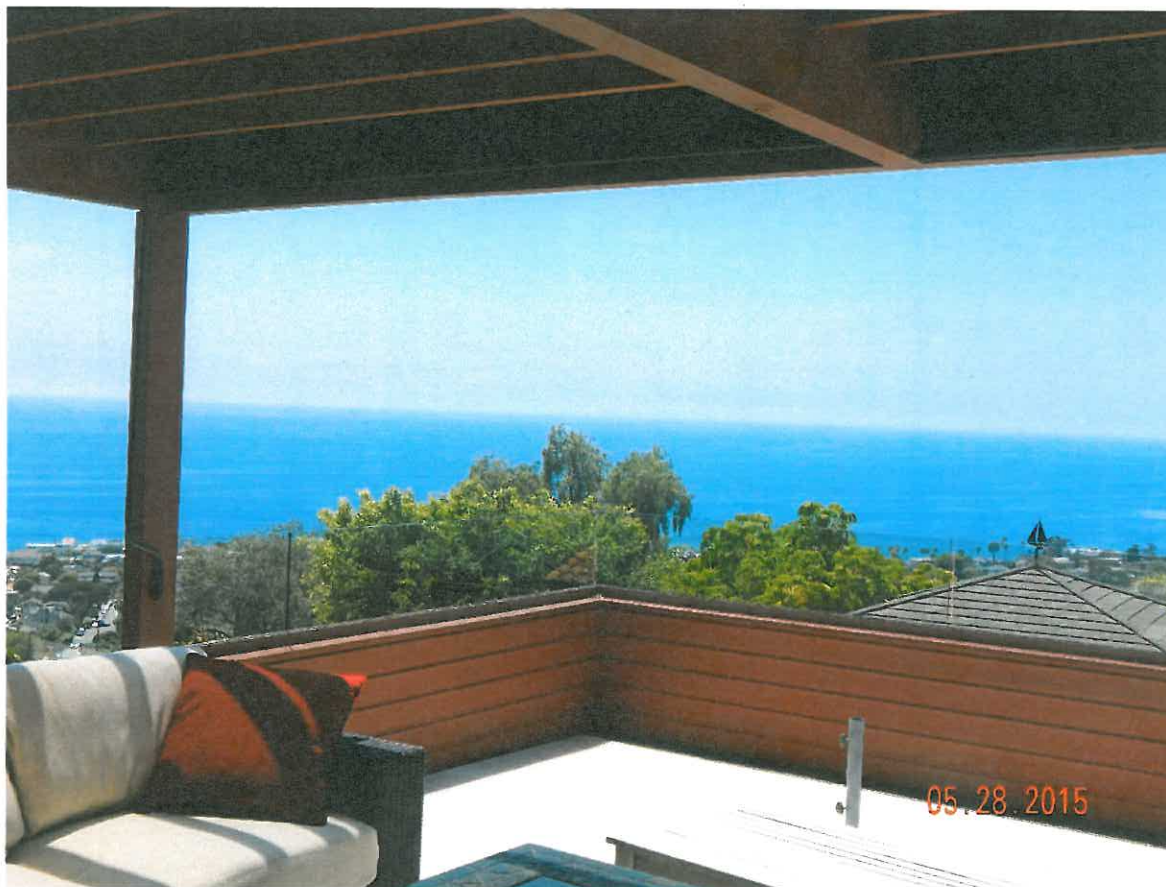
960 Canyon View Dr.

The photograph above was taken from the property owners' living room in the primary residential structure.