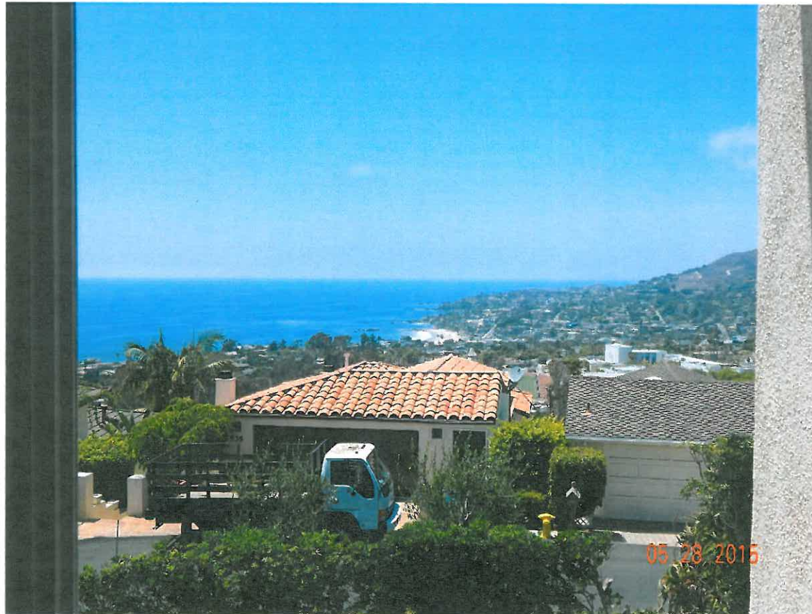
960 Canyon View Dr.

The photograph above was taken from the property owners' kitchen in the primary residential structure.