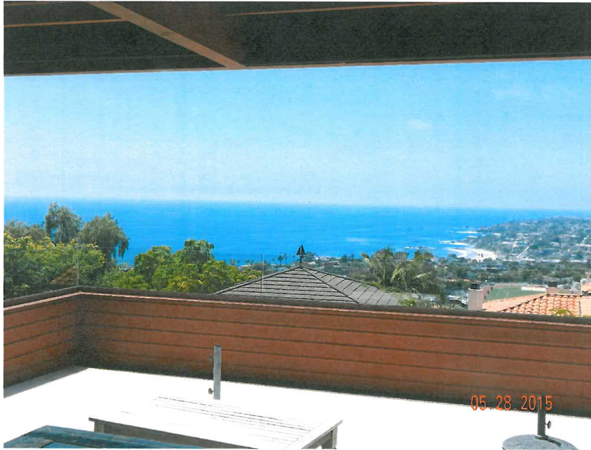
960 Canyon View Dr.

The photograph above was taken from the property owners' living room in the primary residential structure.