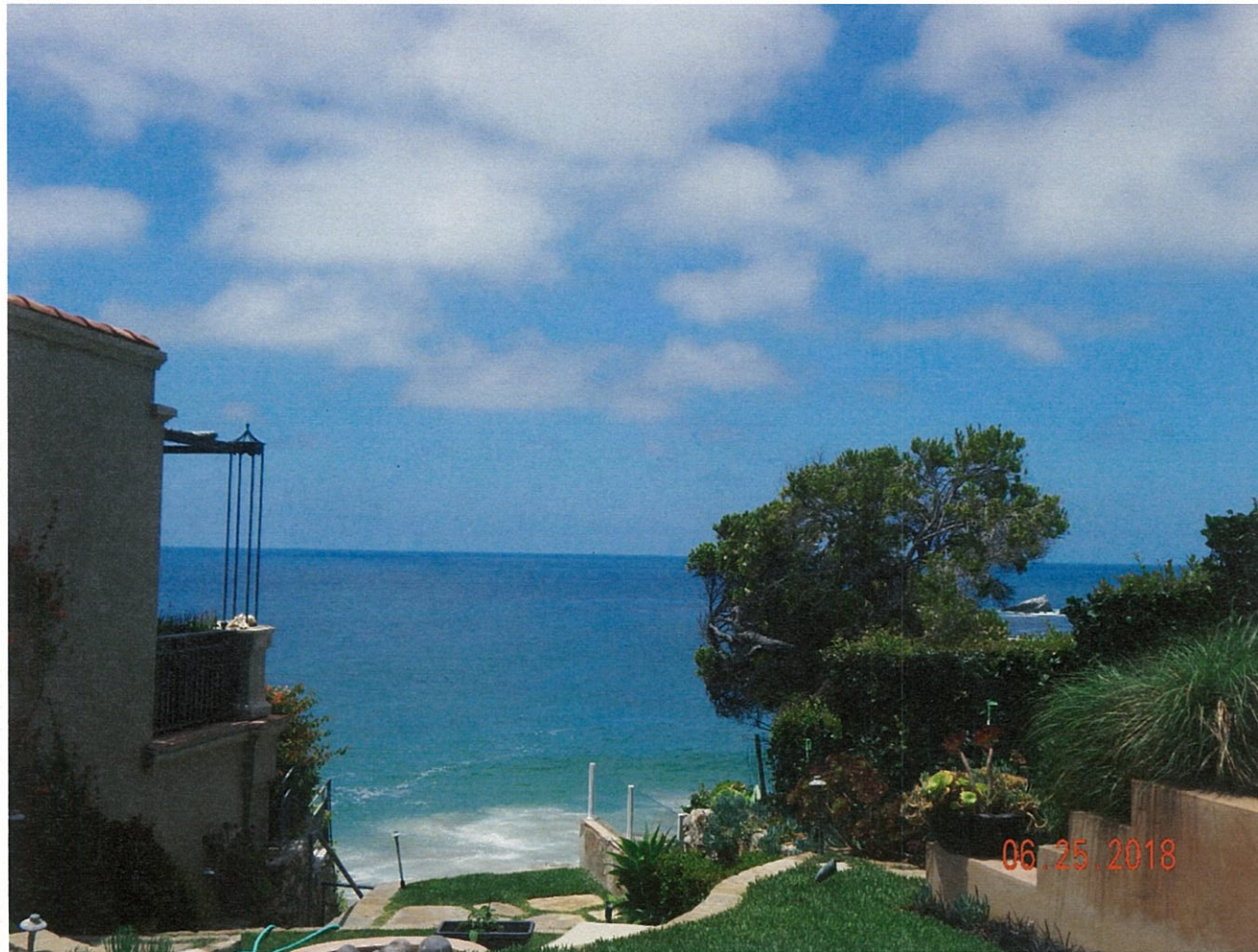
1205 Cliff Drive

The photograph above was taken from the living room/dining room on the main level of the primary residential structure. Visual scene description: Seal Rocks, Catalina Island, whitewater, sandy coastline and the ocean horizon.