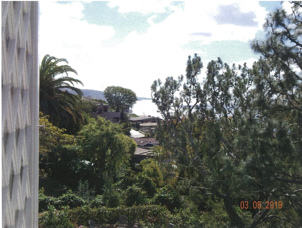
1609 Eleanor Lane

The photograph above was taken from the attic on the top level of the primary residential structure.