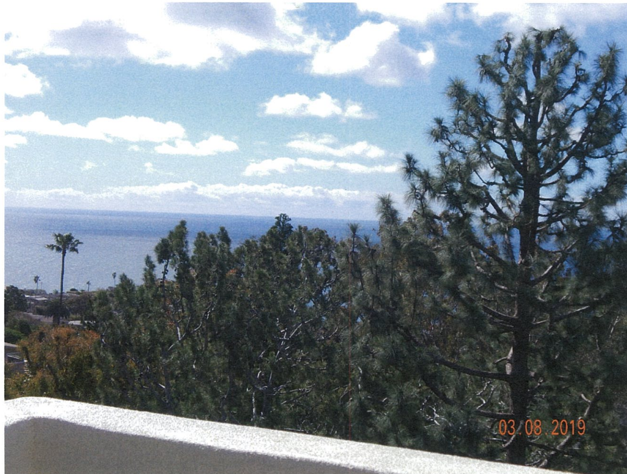
1609 Eleanor Lane

The photograph above was taken from the attic on the top level of the primary residential structure.