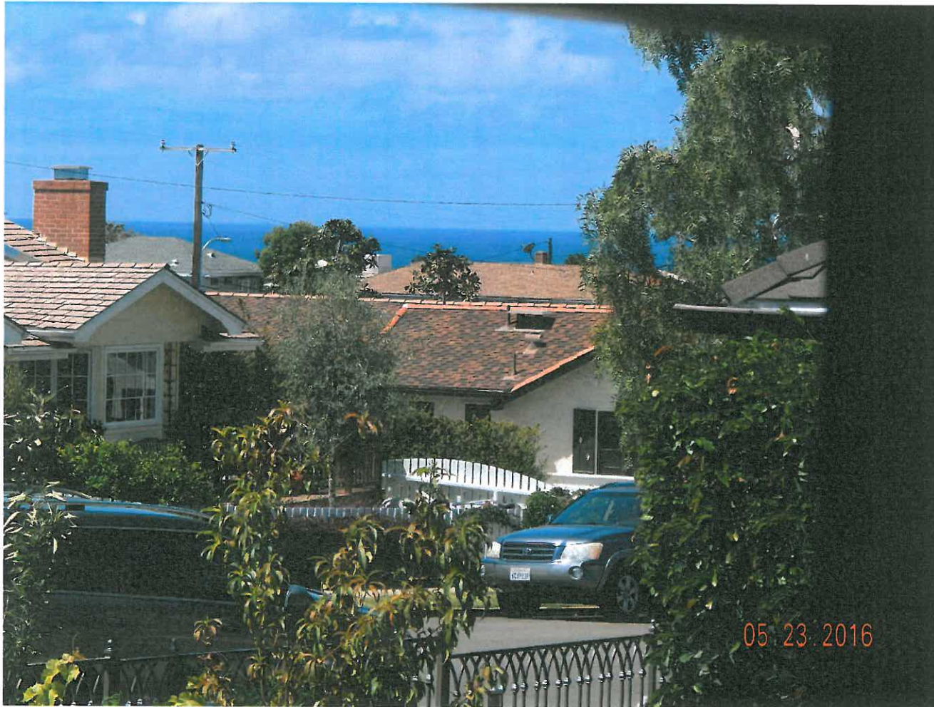
460 El Camino Del Mar

The photograph above was taken from the Living room on the main floor of the primary residential structure. Visual scene description: Ocean horizon.