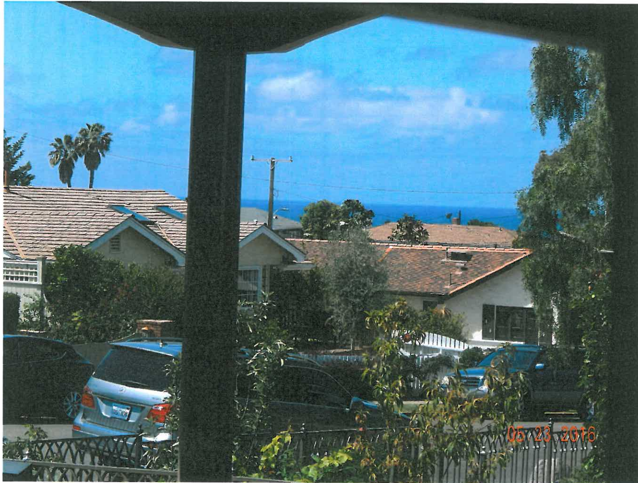
460 El Camino Del Mar

The photograph above was taken from the Living room on the main floor of the primary residential structure. Visual scene description: Ocean horizon.