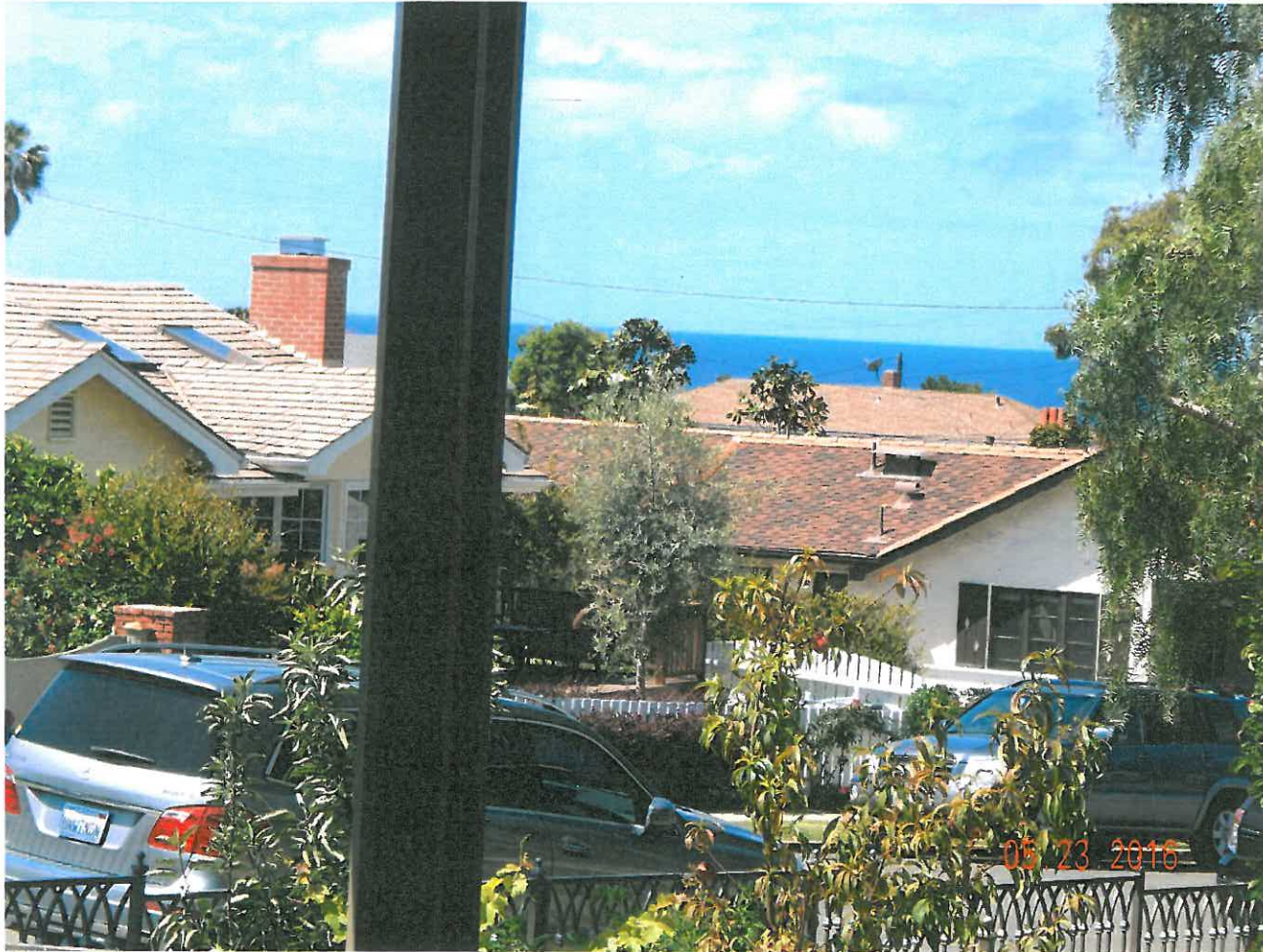
460 El Camino Del Mar

The photograph above was taken from the Family room on the main floor of the primary residential structure. Visual scene description: Ocean horizon.