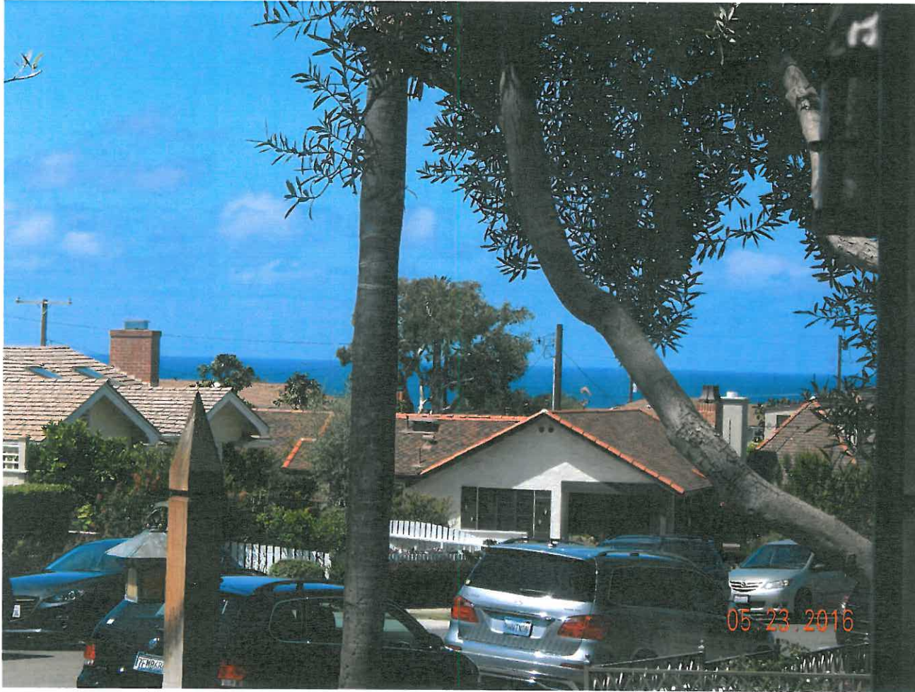
460 El Camino Del Mar

The photograph above was taken from the Family room on the main floor of the primary residential structure. Visual scene description: Ocean horizon.