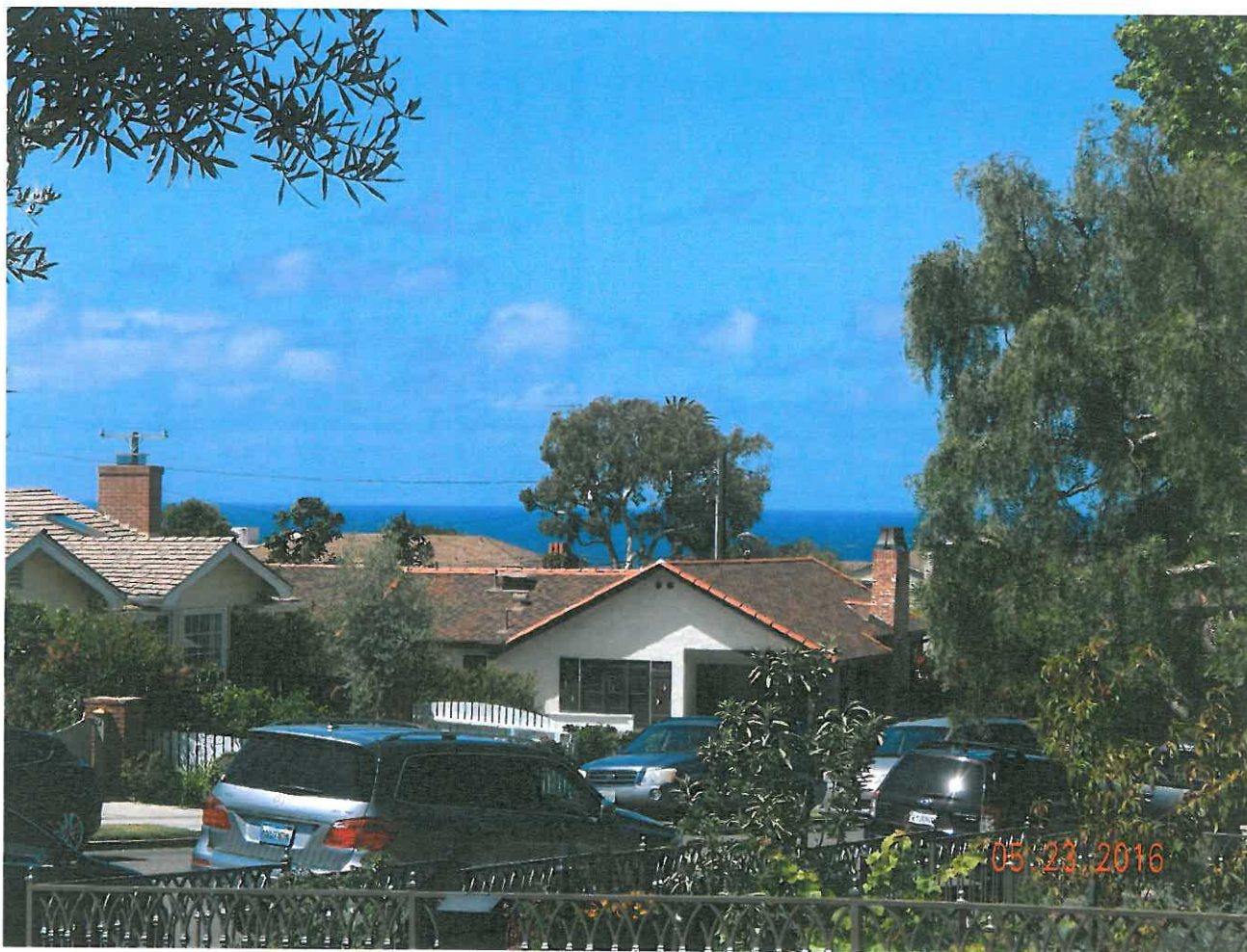
460 El Camino Del Mar

The photograph above was taken from the Living room on the main floor of the primary residential structure. Visual scene description: Ocean horizon.