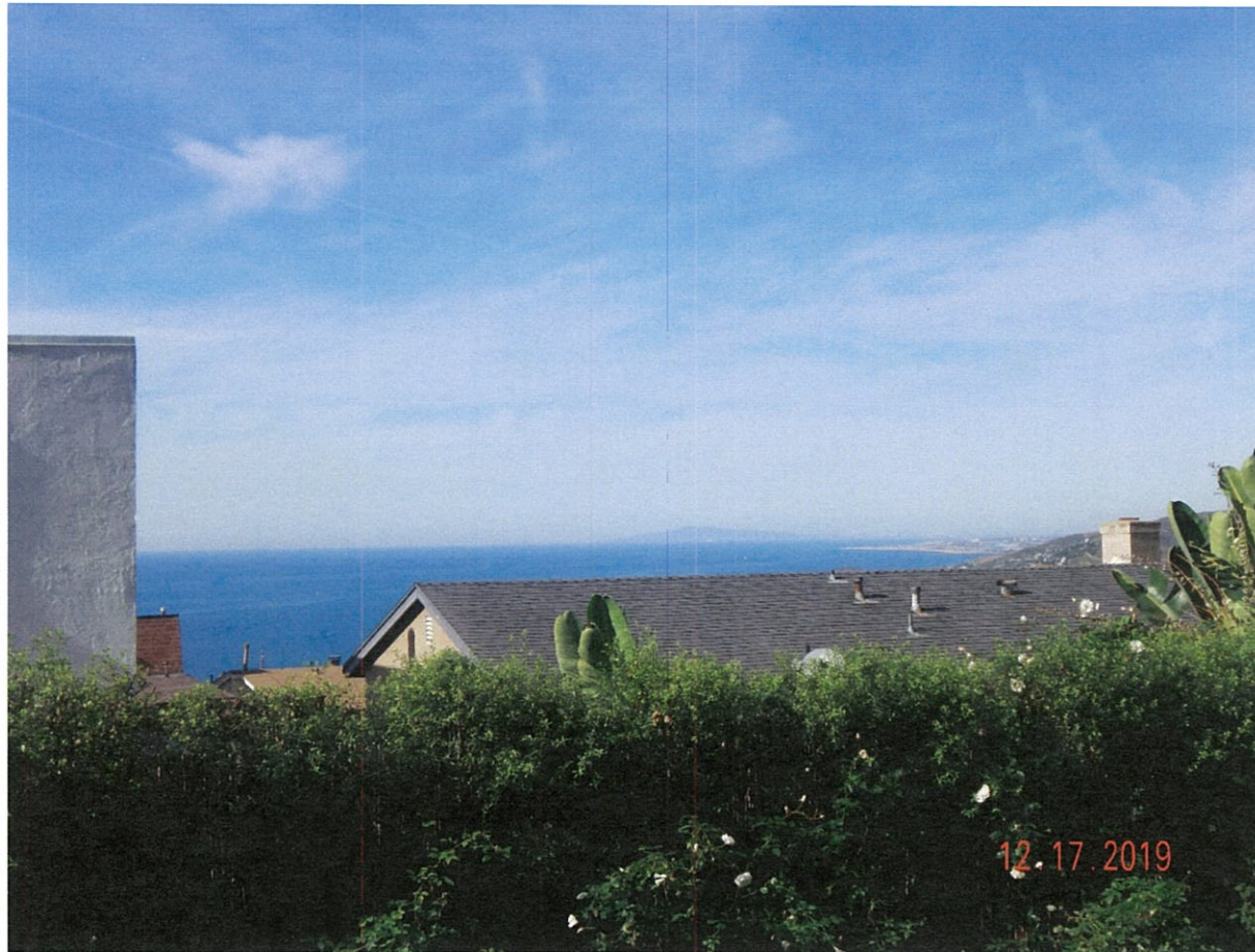
1081 Katella Street

The photograph above was taken from the family room on the lower level of the primary residential structure.