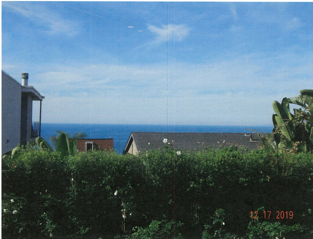
1081 Katella Street

The photograph above was taken from the family room on the lower level of the primary residential structure.