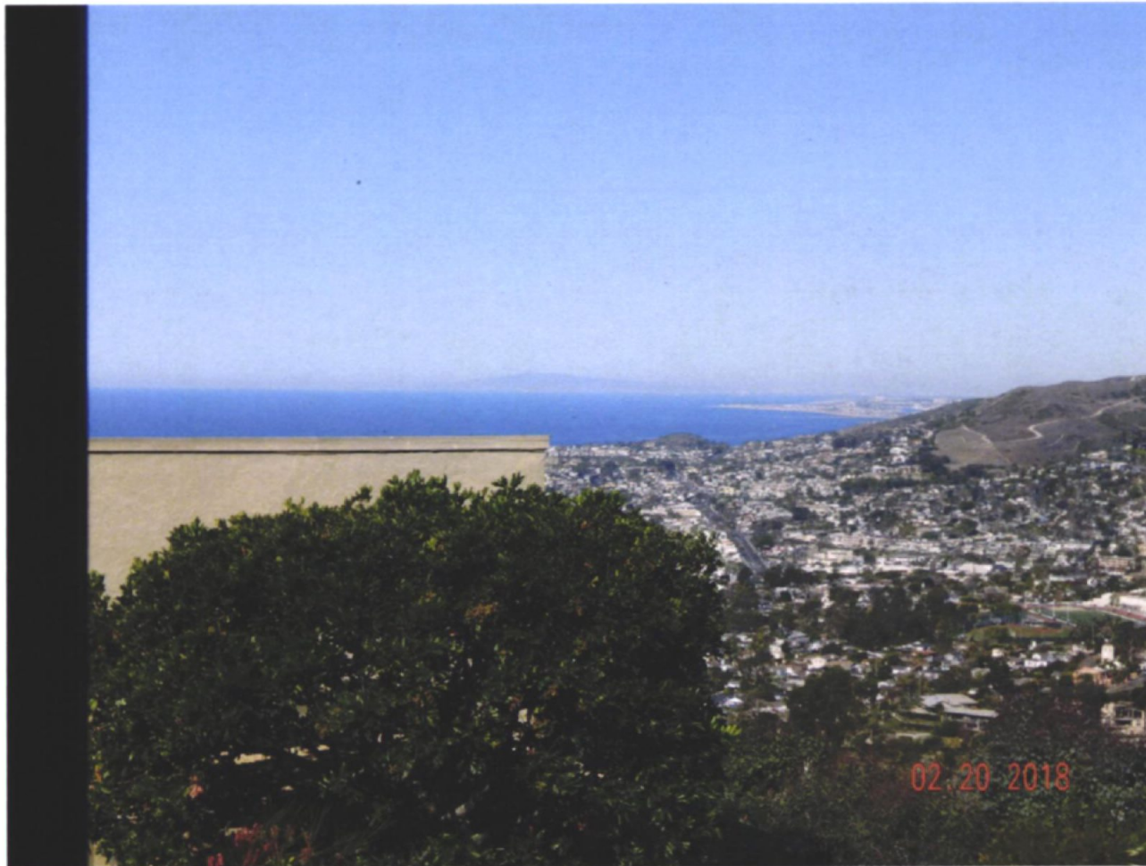
1174 Katella St.

The photograph above was taken from the main level Living room and Dining room of the primary residential structure. Visual scene description: Catalina Island, Signal Hill, Long Beach, Newport Beach, Palos Verdes peninsula, Emerald and Crescent Bays, Contino Point, Heisler Park, Main Beach, Hotel Laguna, hillside terrain and ocean horizon.