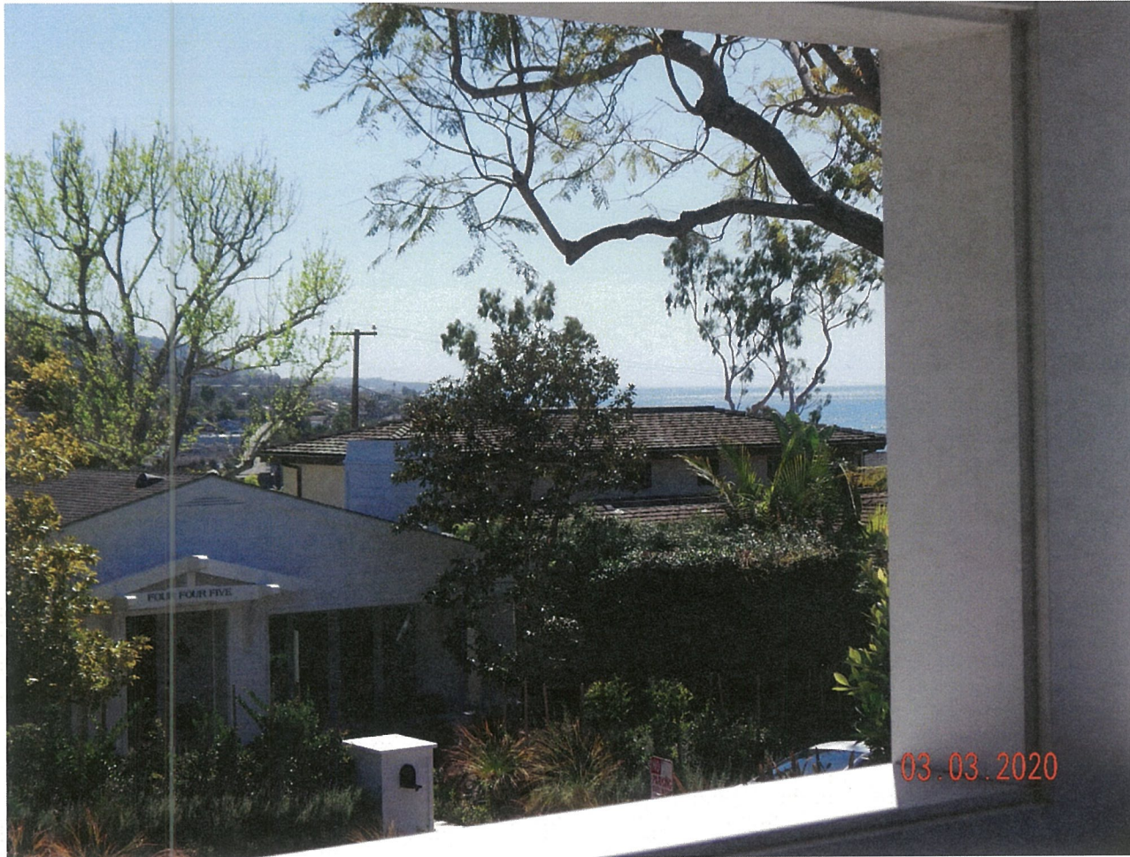
452 Holly Street

The photograph above was taken from the front bedroom on the upper floor of the primary residential structure.