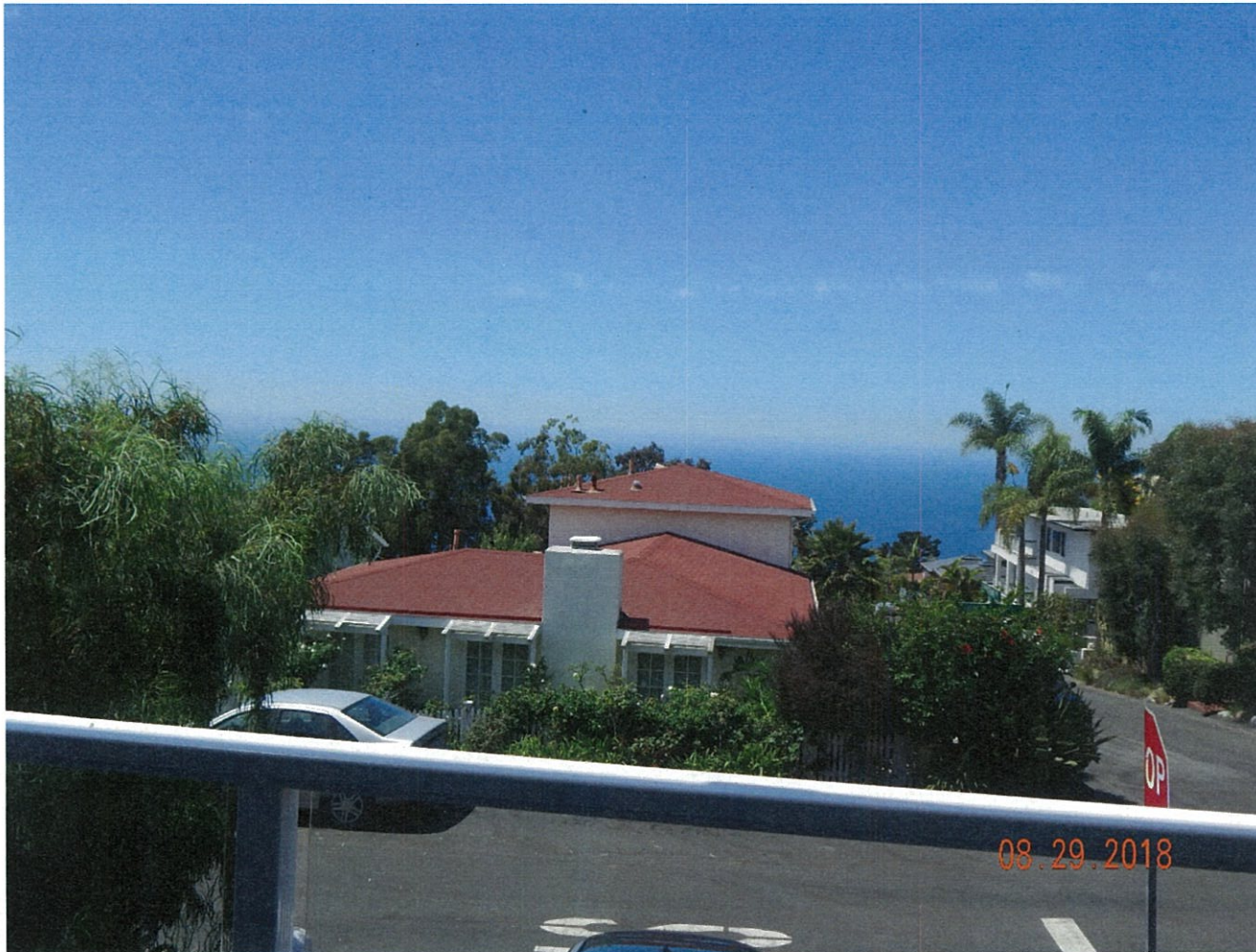
992 Katella Street

The photograph above was taken from the master bedroom on the lower level of the primary residential structure.