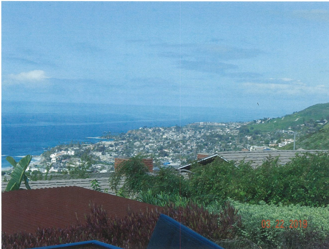
1770 Palm Drive

The photograph above was taken from the living room/dining room on the first floor of the primary residential structure.