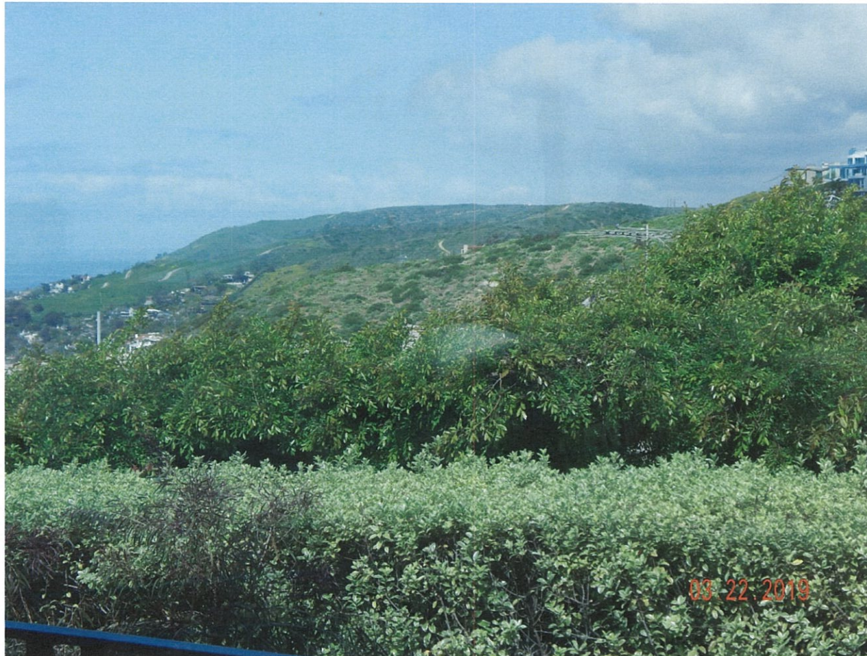
1770 Palm Drive

The photograph above was taken from the living room/dining room on the first floor of the primary residential structure.