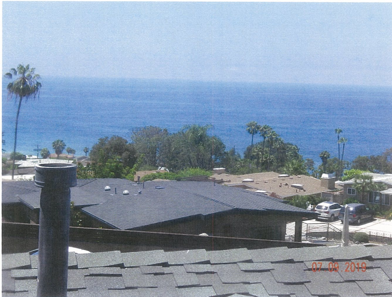
21601 Ocean Vista Dr.

The photograph above was taken from the master bedroom on the second floor of the primary residential structure.