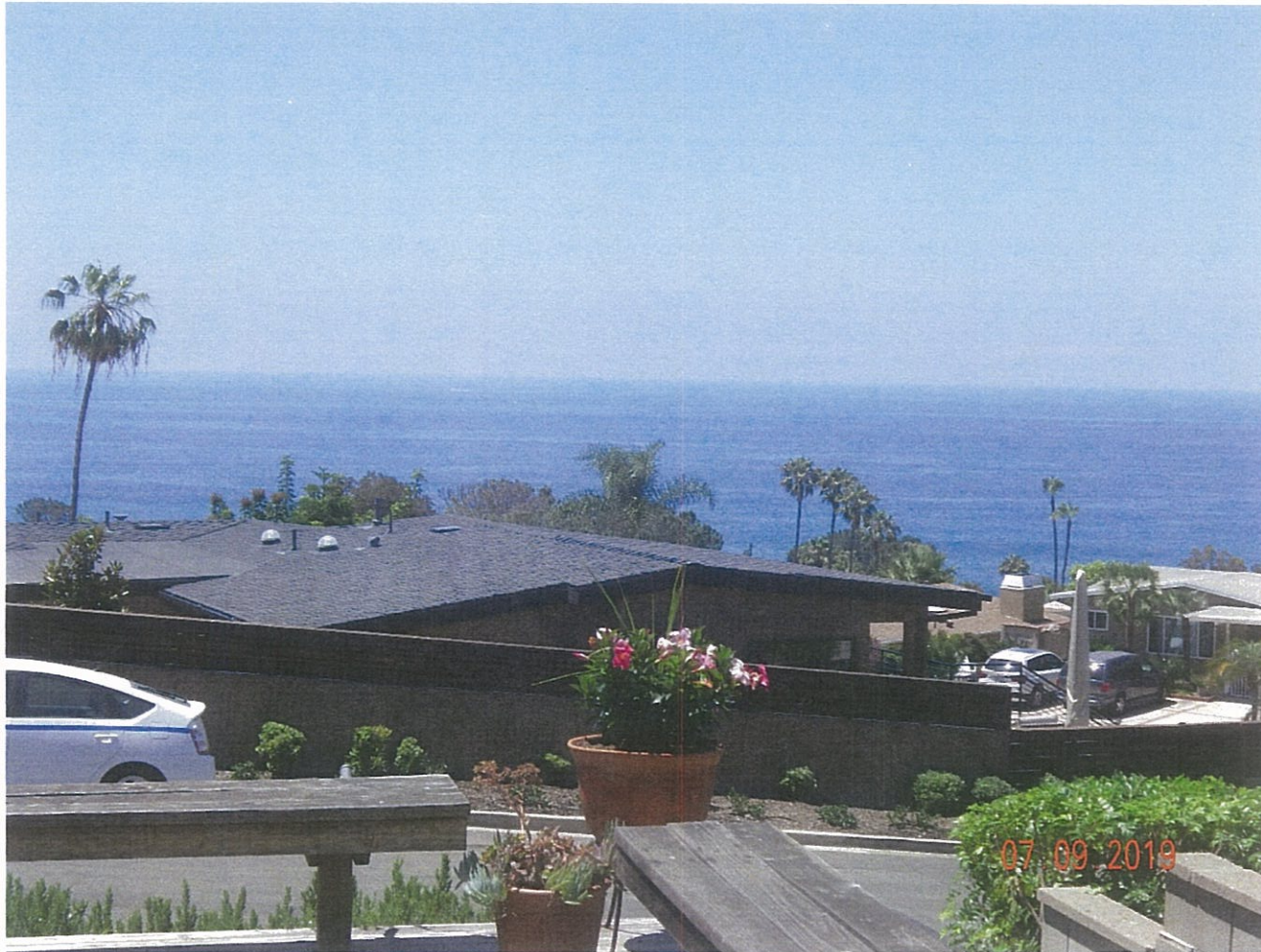
21601 Ocean Vista Dr.

The photograph above was taken from the living room/dining room on the main floor of the primary residential structure.