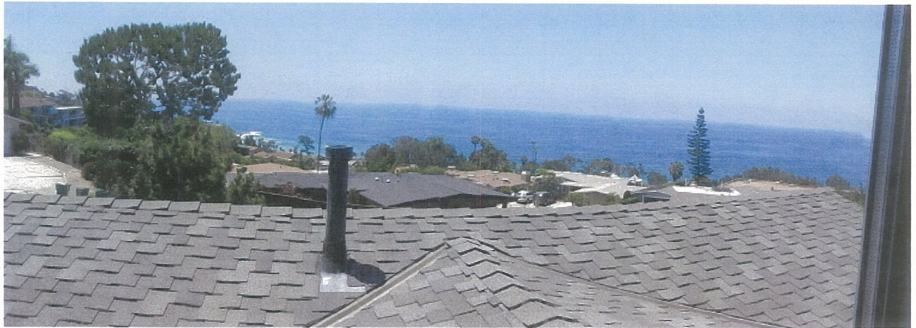
21601 Ocean Vista Dr.

The photograph above was taken from the master bedroom on the second floor of the primary residential structure.