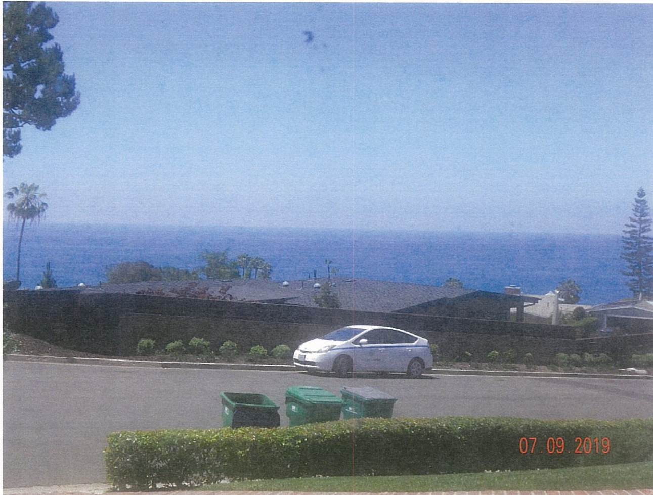
21601 Ocean Vista Dr.

The photograph above was taken from the end guest bedroom on the main floor of the primary residential structure.