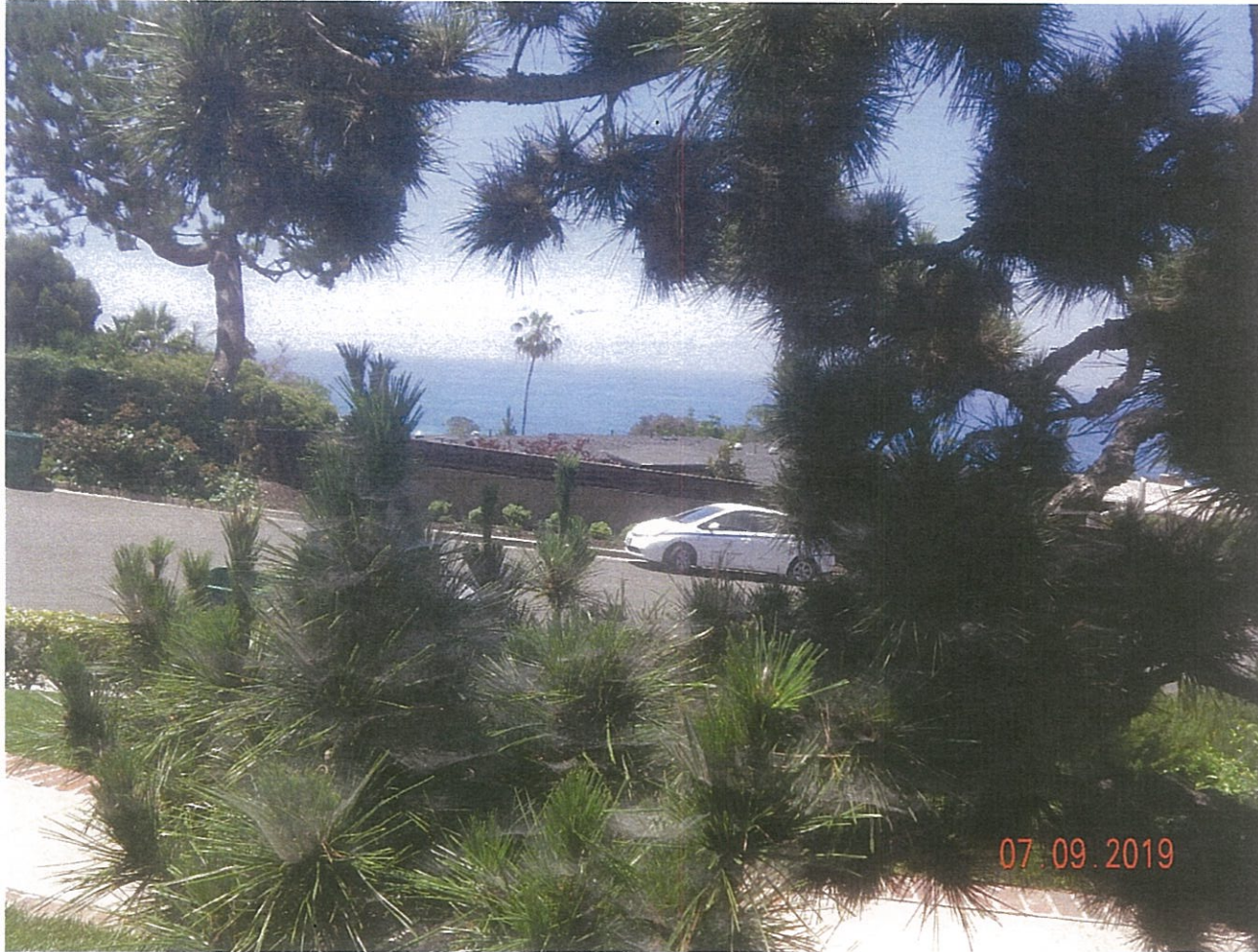
21601 Ocean Vista Dr.

The photograph above was taken from the middle guest bedroom on the main floor of the primary residential structure.