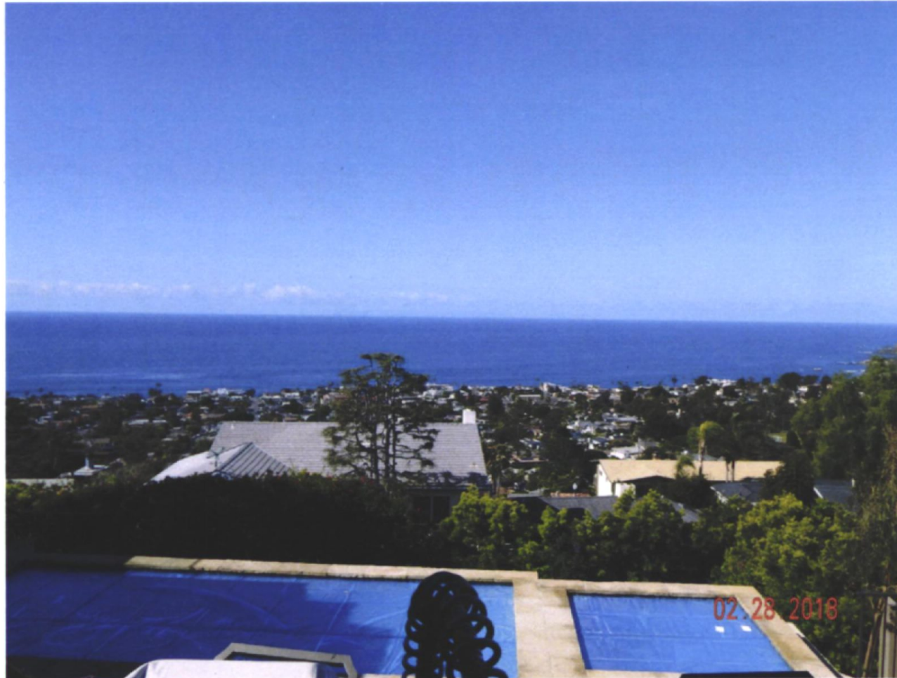
1294 Temple Hills Drive

The photograph above was taken from the kitchen of the primary residential structure. Visual scene description: San Clemente and Catalina Islands, Hotel Laguna, Main Beach, Bird Rock, Heisler Park, Contino Point, Crescent Bay, Irvine Cove, whitewater, hillside terrain and ocean horizon.