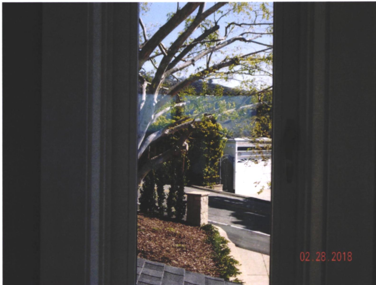
1294 Temple Hills Drive

The photograph above was taken from the 3 rd floor loft of the primary residential structure. Visual scene description: Hillside terrain. Date of photograph: 2/28/18 Submitted to property file: 03/08/2018