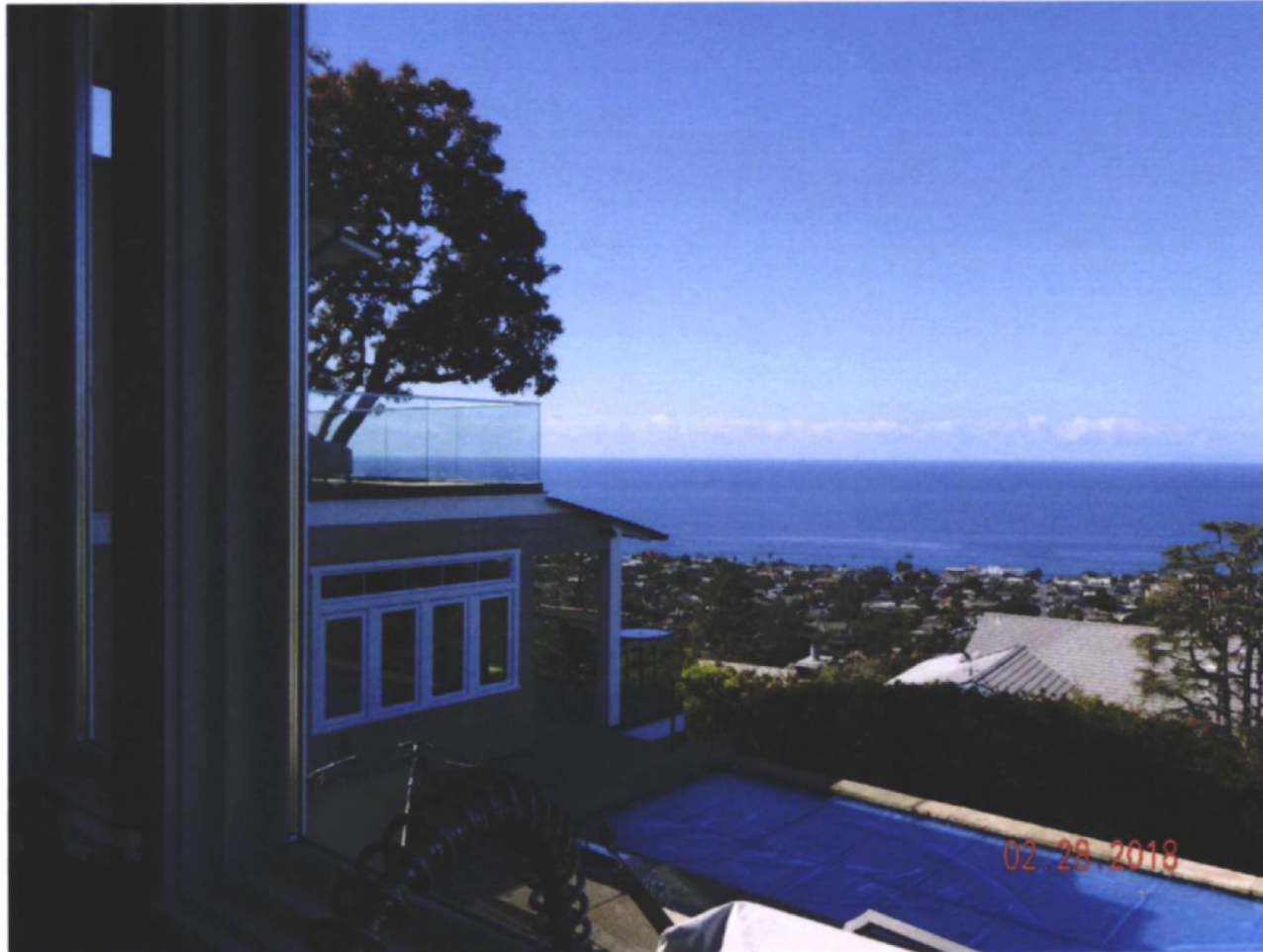
1294 Temple Hills Drive

The photograph above was taken from the kitchen of the primary residential structure. Visual scene description: San Clemente and Catalina Islands and ocean horizon.