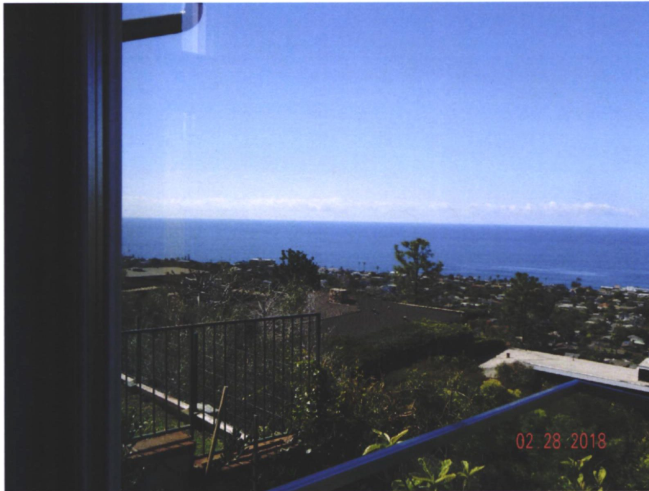
1294 Temple Hills Drive

The photograph above was taken from the guest bedroom suite of the primary residential structure. Visual scene description: San Clemente and Catalina Islands and ocean horizon.