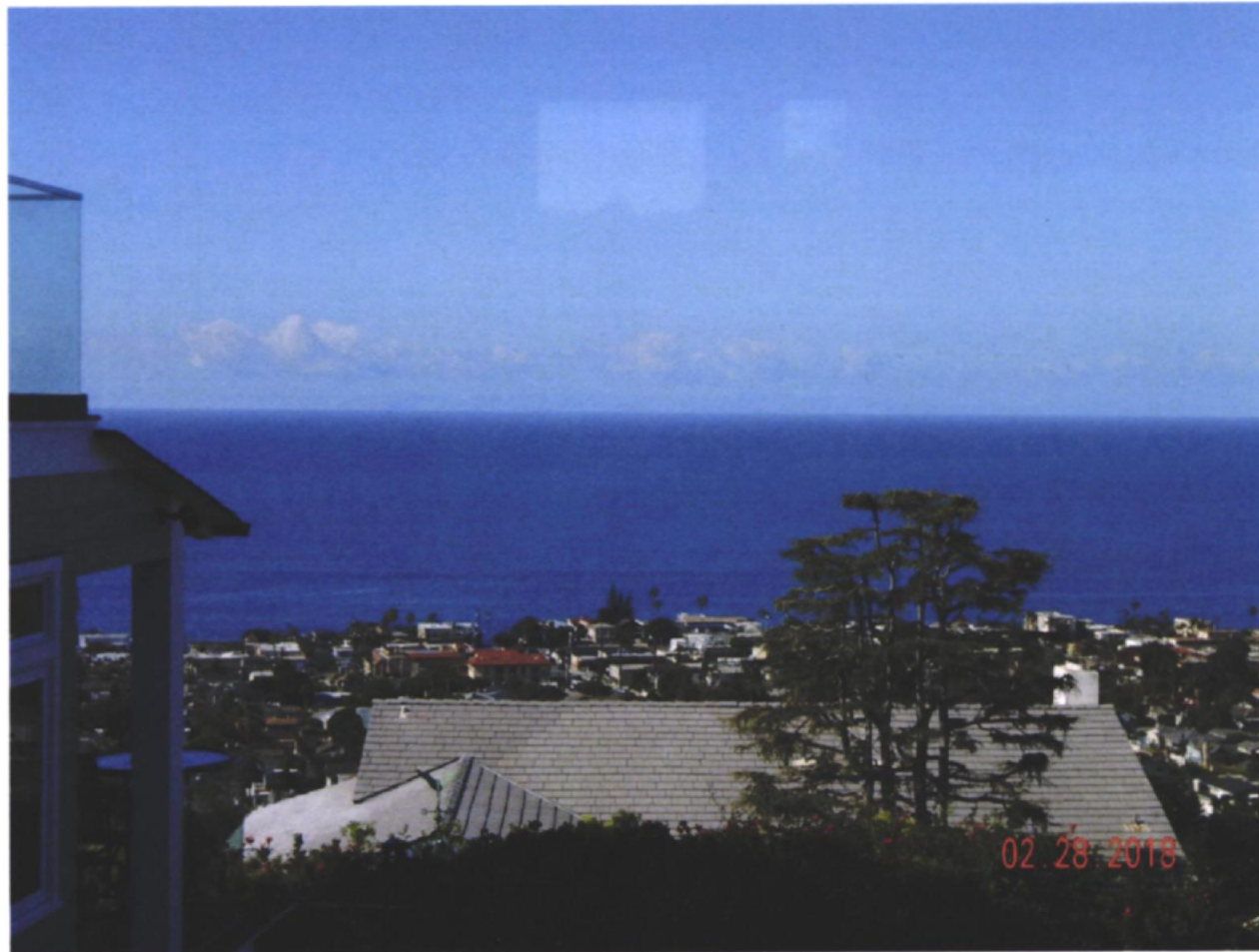
1294 Temple Hills Drive

The photograph above was taken from the living/dining room of the primary residential structure. Visual scene description: San Clemente and Catalina Islands, hillside terrain and ocean horizon.