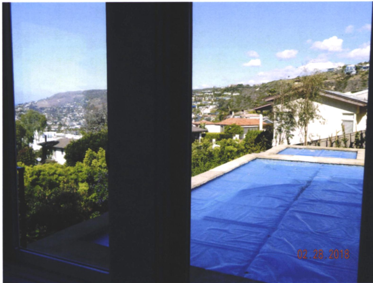
1294 Temple Hills Drive

The photograph above was taken from the guest bedroom suite of the primary residential structure. Visual scene description: Catalina Island and ocean horizon.