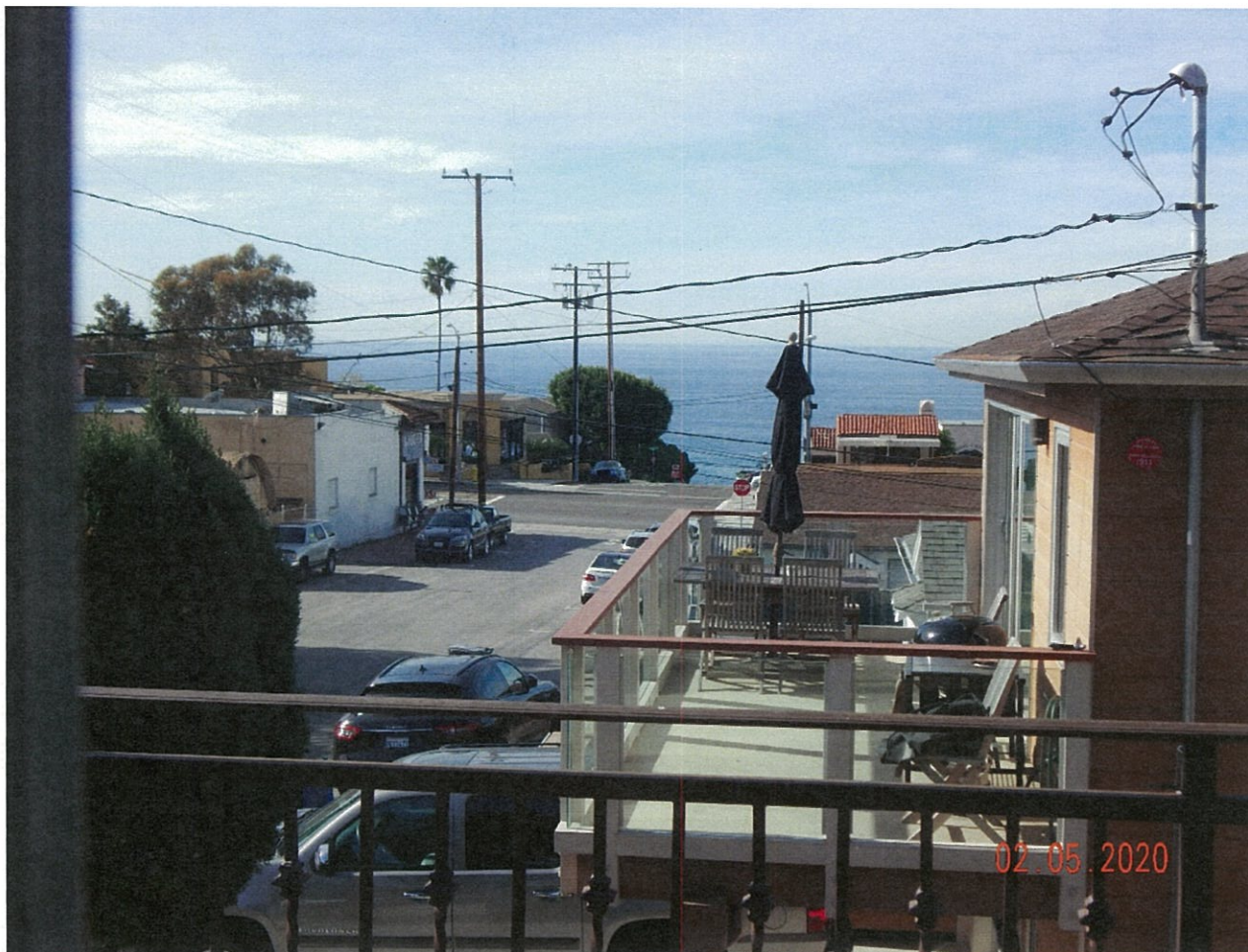
290 Pearl St.

The photograph above was taken from the dining room on the main/upper level of the primary residential structure.