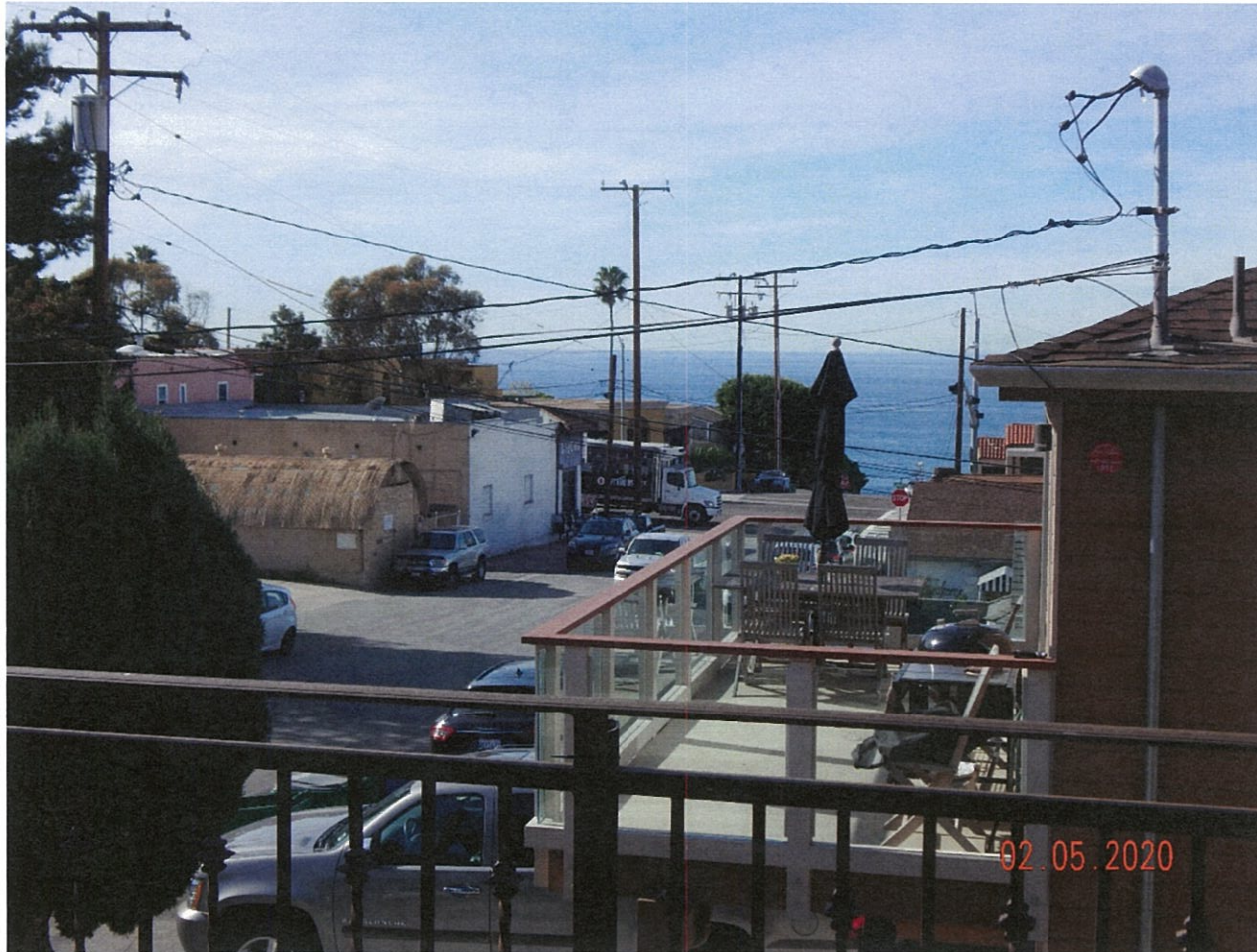
290 Pearl St.

The photograph above was taken from the dining room on the main/upper level of the primary residential structure.