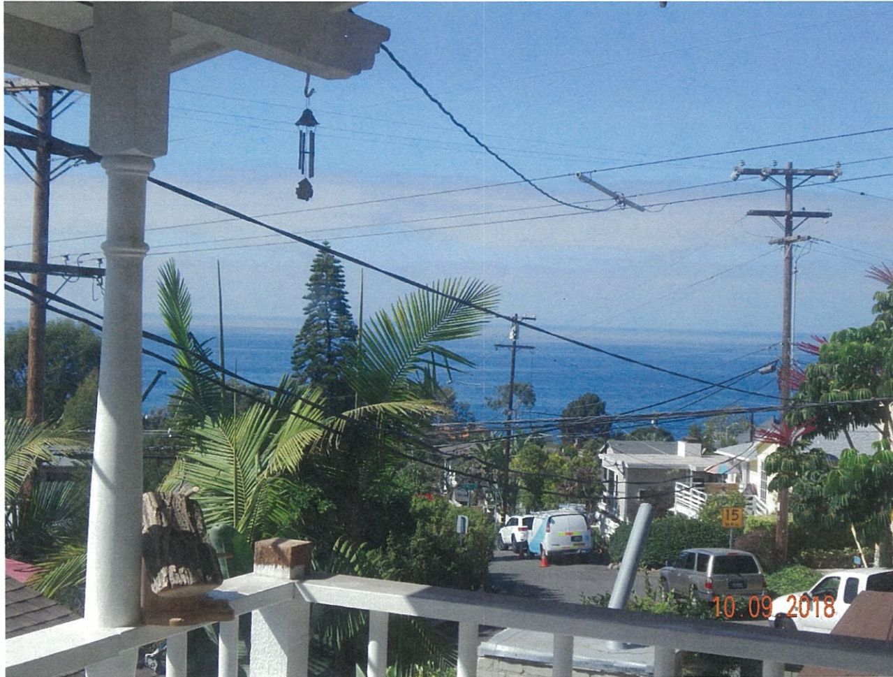
31706 Scenic Dr.

The photograph above was taken from the living room on the main level of the primary residential structure.