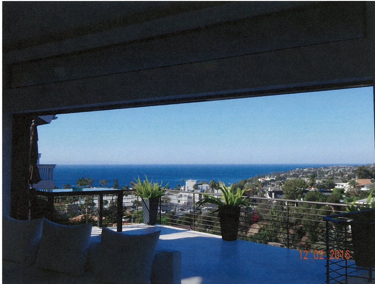
645 Temple Hills Drive

The photograph above was taken from the living room/dining room on the main level of the primary residential structure.