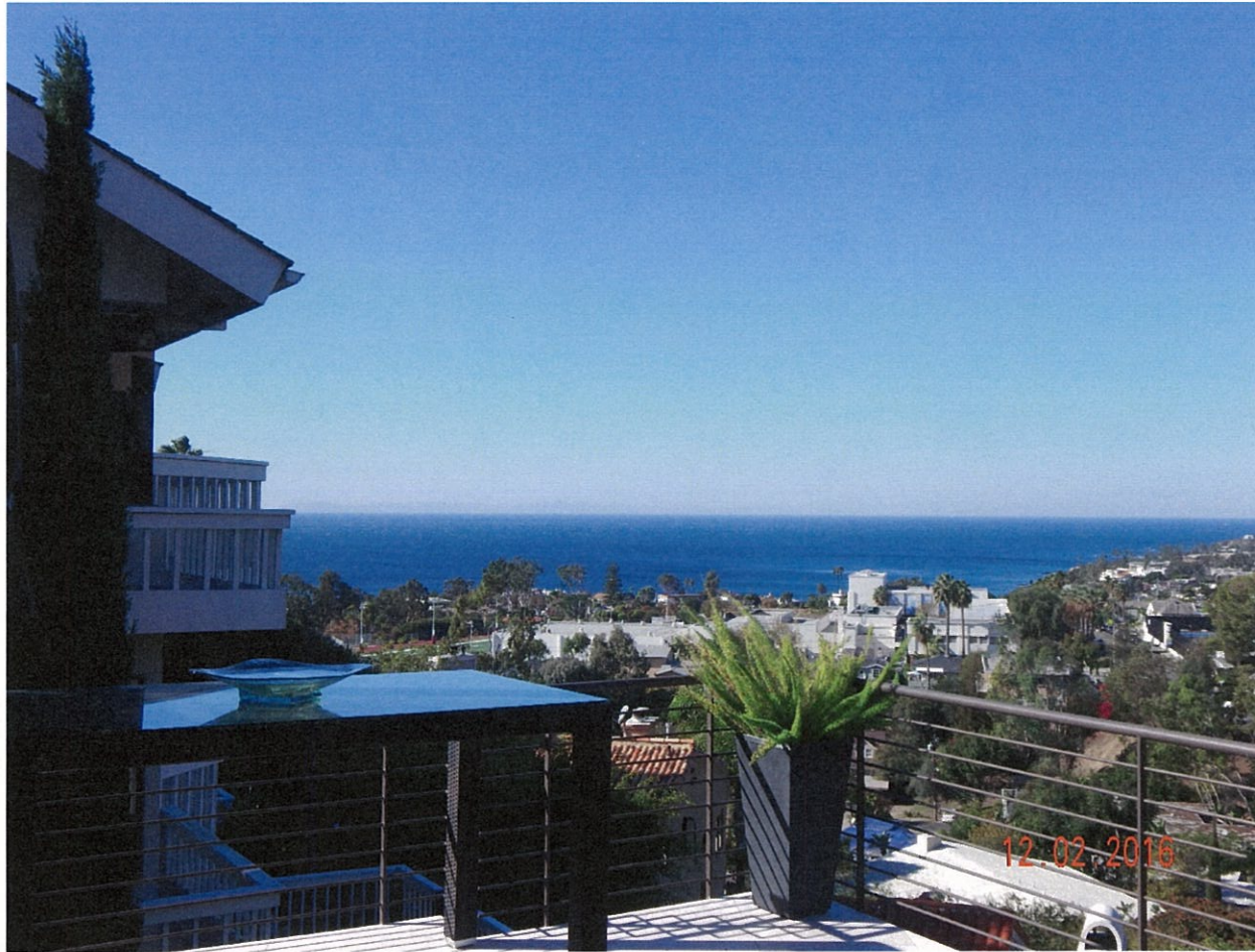
645 Temple Hills Drive

The photograph above was taken from the living room/dining room on the main level of the primary residential structure. Visual scene description: Catalina Island, Main Beach coastline, Bird Rock, whitewater, ocean horizon, city lights and hillside terrain. Date of photograph: 12/2/16 Photographed by: [Signature] Submitted to property file: 12/2/2016