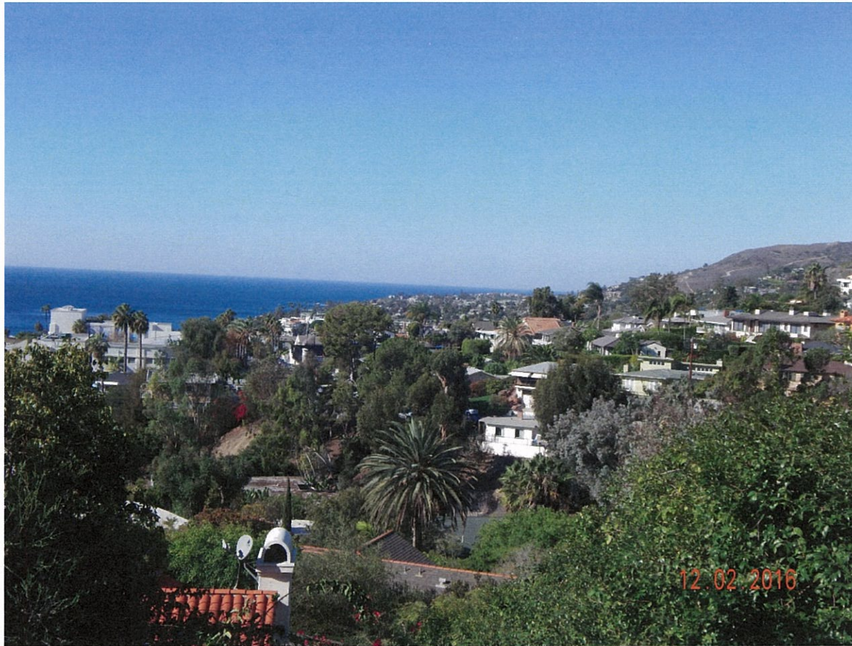
645 Temple Hills Drive

The photograph above was taken from the Office and Guest bedroom on the lower level of the primary residential structure. Visual scene description: Catalina Island, Main Beach coastline, Bird Rock, whitewater, ocean horizon, city lights and hillside terrain. Date of photograph: 12/2/16 Submitted to property file: 12/12/2016