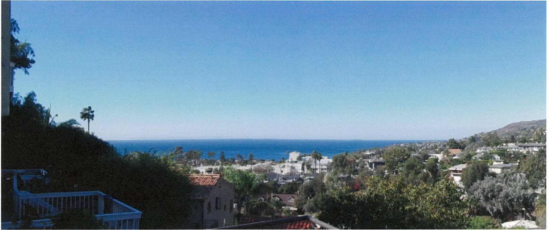
645 Temple Hills Drive

The photograph above was taken from the Master bedroom on the lower level of the primary residential structure.