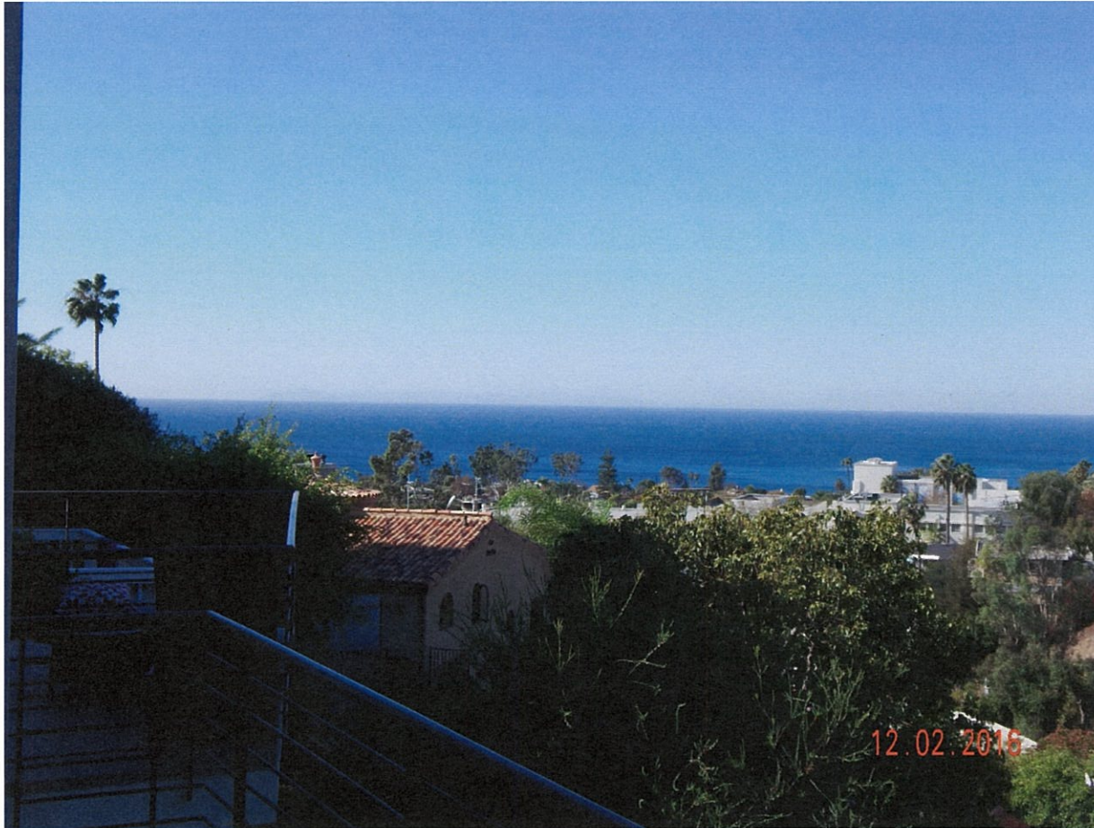
645 Temple Hills Drive

The photograph above was taken from the Office and Guest bedroom on the lower level of the primary residential structure.