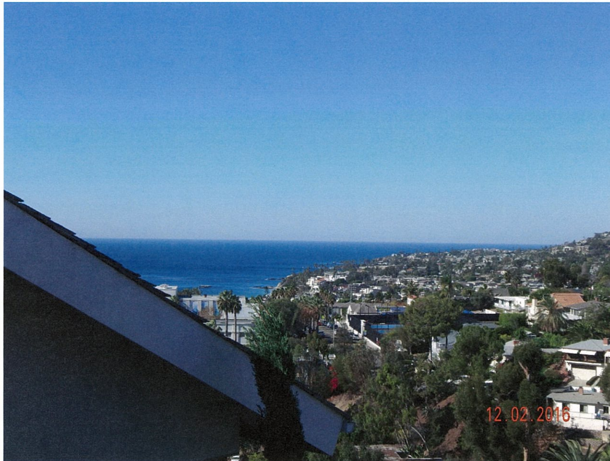
645 Temple Hills Drive

The photograph above was taken from the exercise room on the upper level of the primary residential structure.