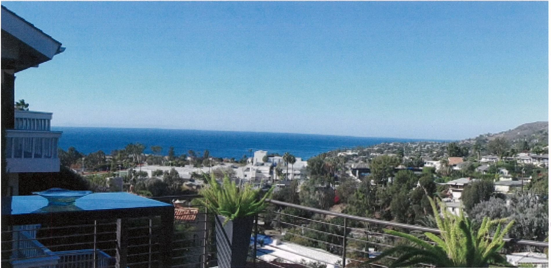
645 Temple Hills Drive

The photograph above was taken from the living room/dining room on the main level of the primary residential structure.