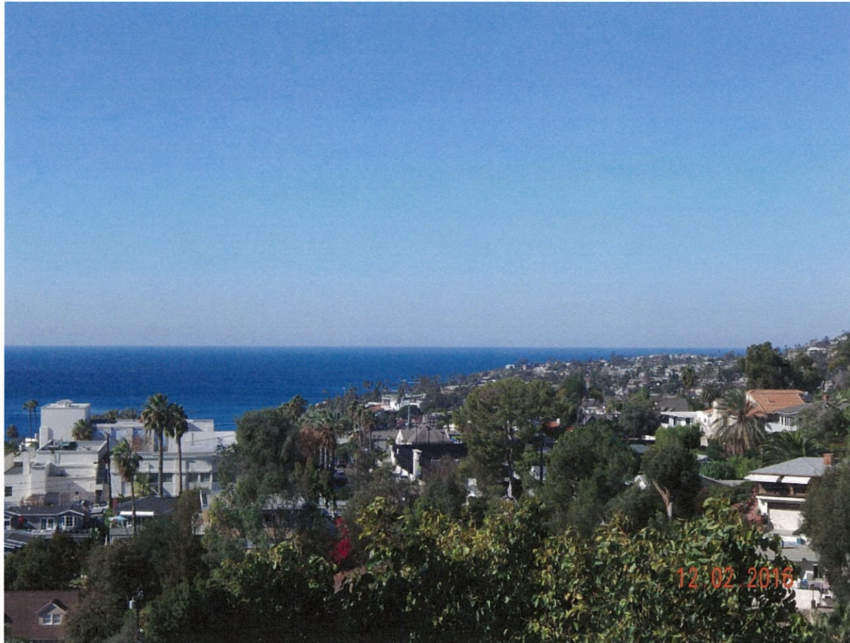
645 Temple Hills Drive

The photograph above was taken from the Master bedroom on the lower level of the primary residential structure.