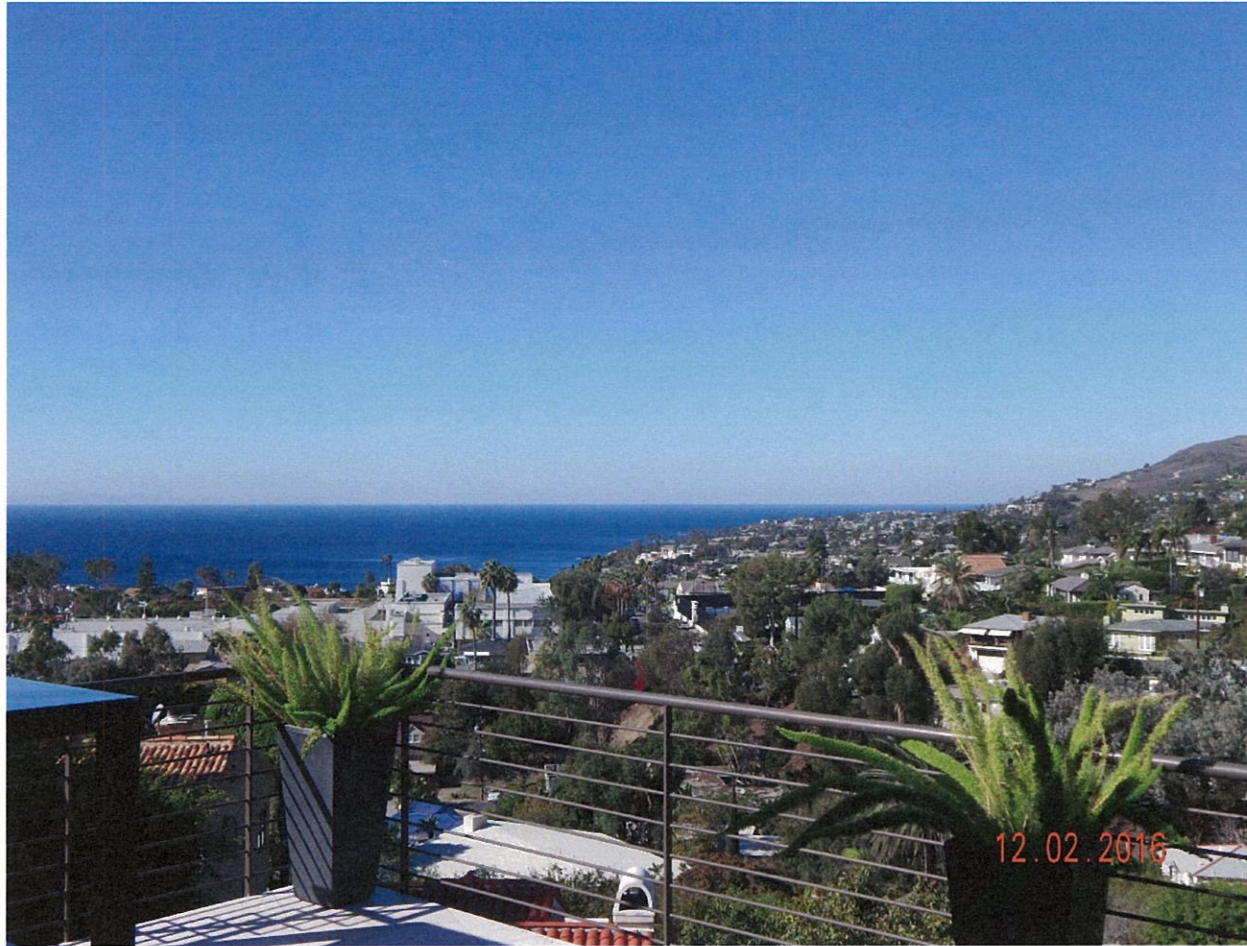
645 Temple Hills Drive

The photograph above was taken from the living room/dining room on the main level of the primary residential structure. Visual scene description: Catalina Island, Main Beach coastline, Bird Rock, whitewater, ocean horizon, city lights and hillside terrain. Date of photograph: 12/2/16 Photographed by: [signature] Submitted to property file: 12/12/2016