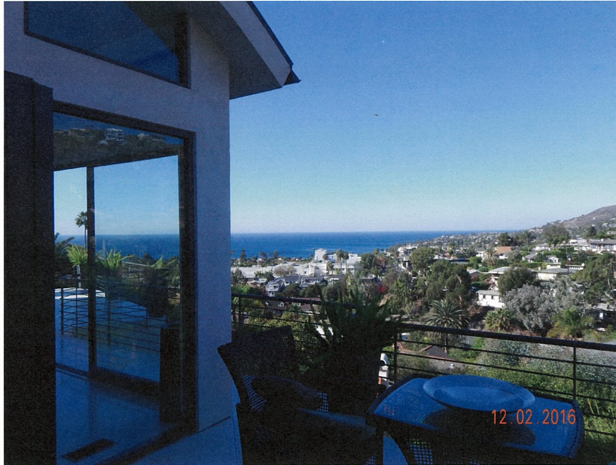
645 Temple Hills Drive

The photograph above was taken from the kitchen on the main level of the primary residential structure.