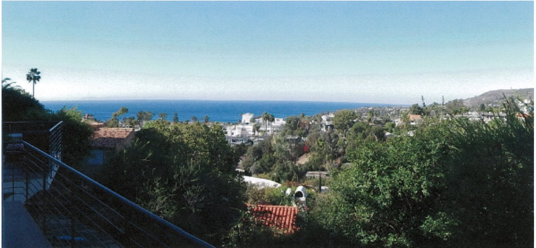
645 Temple Hills Drive

The photograph above was taken from the Office and Guest bedroom on the lower level of the primary residential structure. Visual scene description: Catalina Island, Main Beach coastline, Bird Rock, whitewater, ocean horizon, city lights and hillside terrain. Date of photograph: 12/2/16 Photographed by: [Signature] Submitted to property file: 12/10/2016