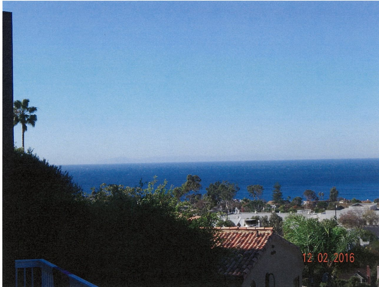
645 Temple Hills Drive

The photograph above was taken from the Master bedroom on the lower level of the primary residential structure.