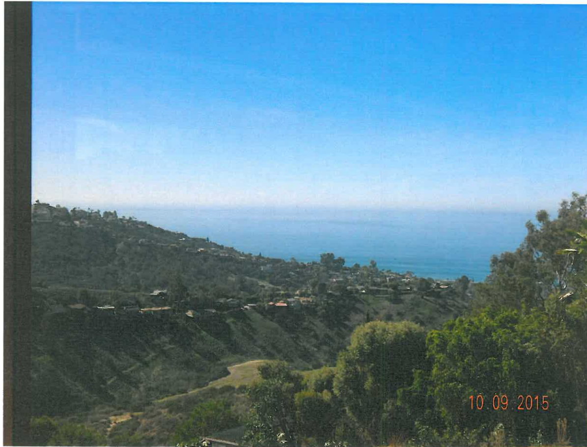
2325 Temple Hills Dr.

The photograph above was taken from the property owners' living room on the main level of the primary residential structure. Visual scene description: Ocean horizon, city lights and hillside terrain and San Clemente Island.