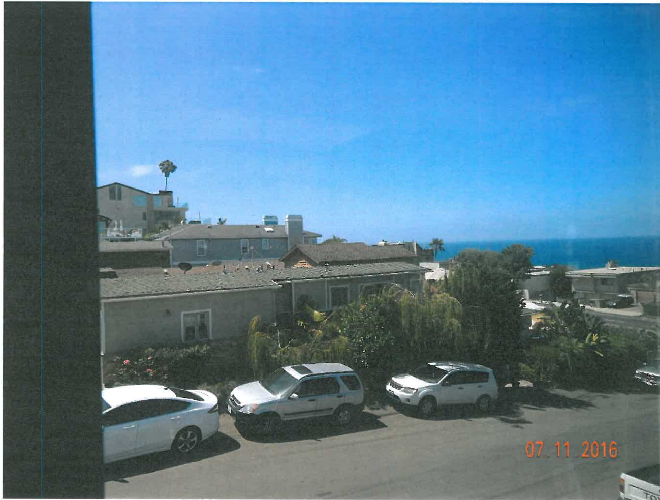
31991 Virginia Way

The photograph above was taken from the Kitchen on the upper floor/living area of the primary residential structure.