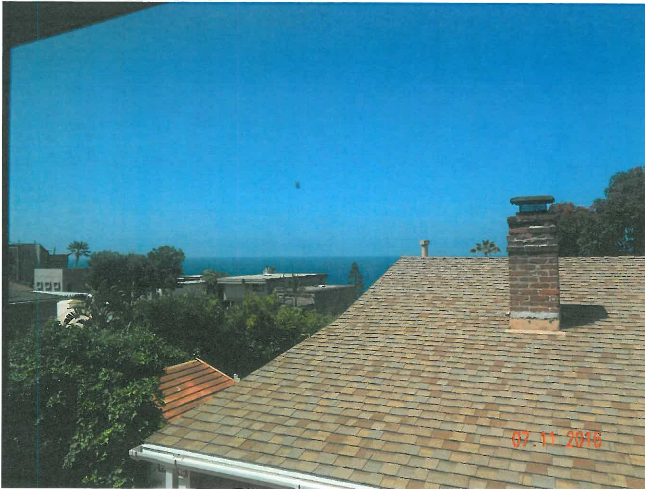
31991 Virginia Way

The photograph above was taken from the Master bedroom on the lower/ground floor of the primary residential structure.