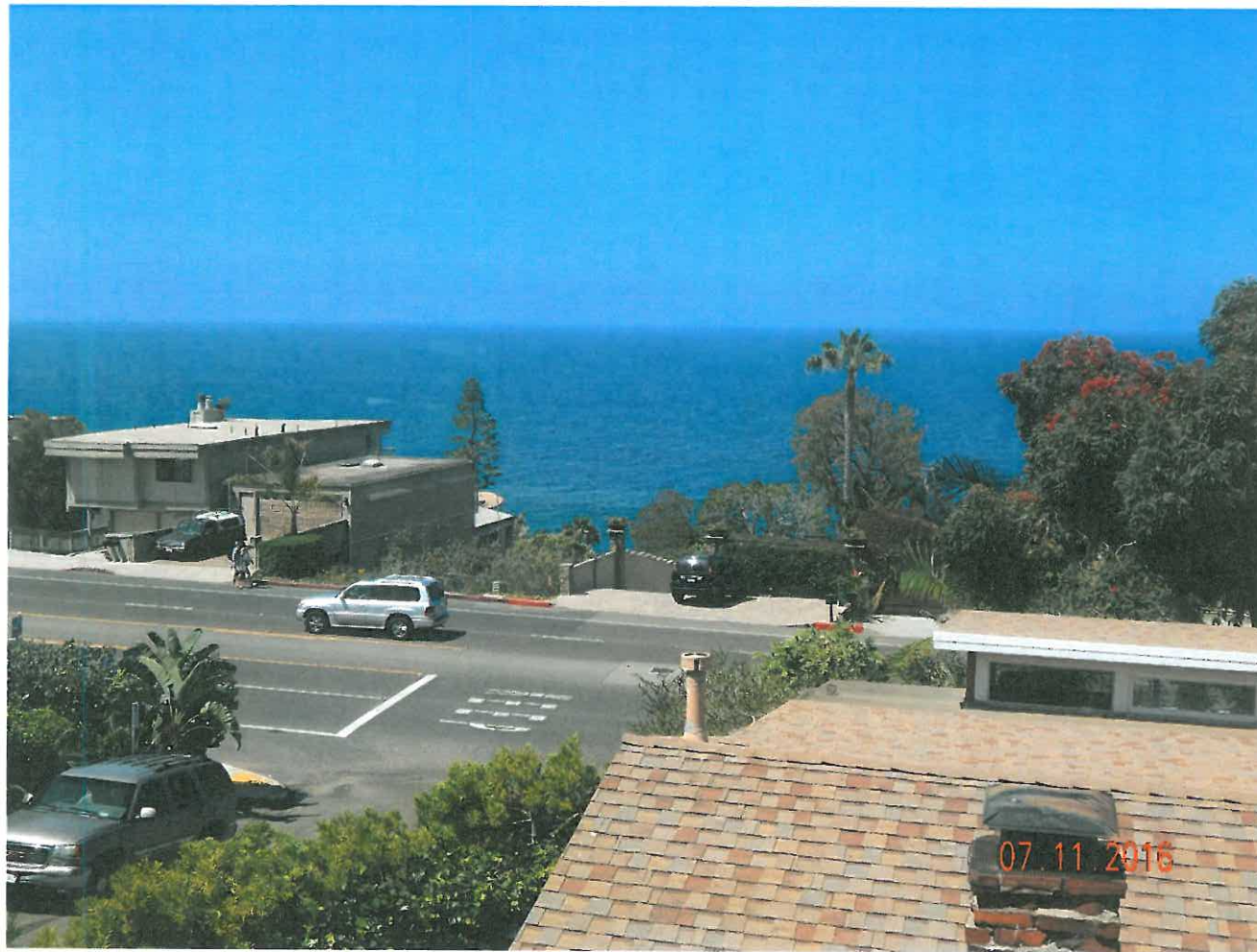
31991 Virginia Way

The photograph above was taken from the Living room on the upper floor/living room area of the primary residential structure.