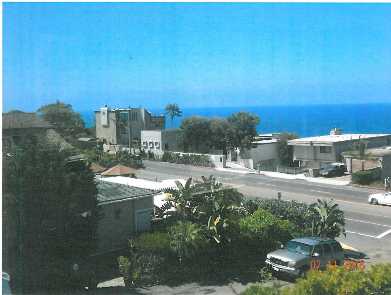
31991 Virginia Way

The photograph above was taken from the Living room on the upper floor/living room area of the primary residential structure.