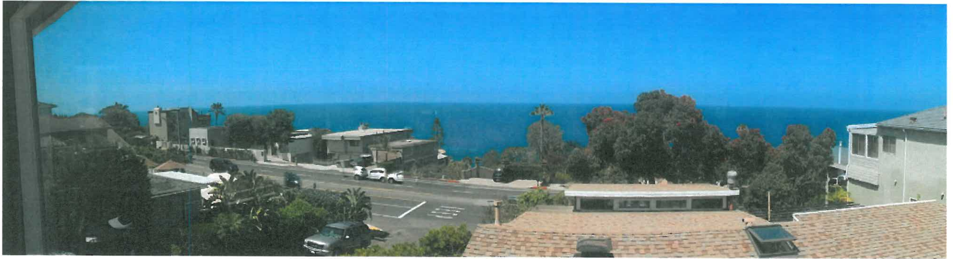
31991 Virginia Way

The photograph above was taken from the Living room on the upper floor/living room area of the primary residential structure.