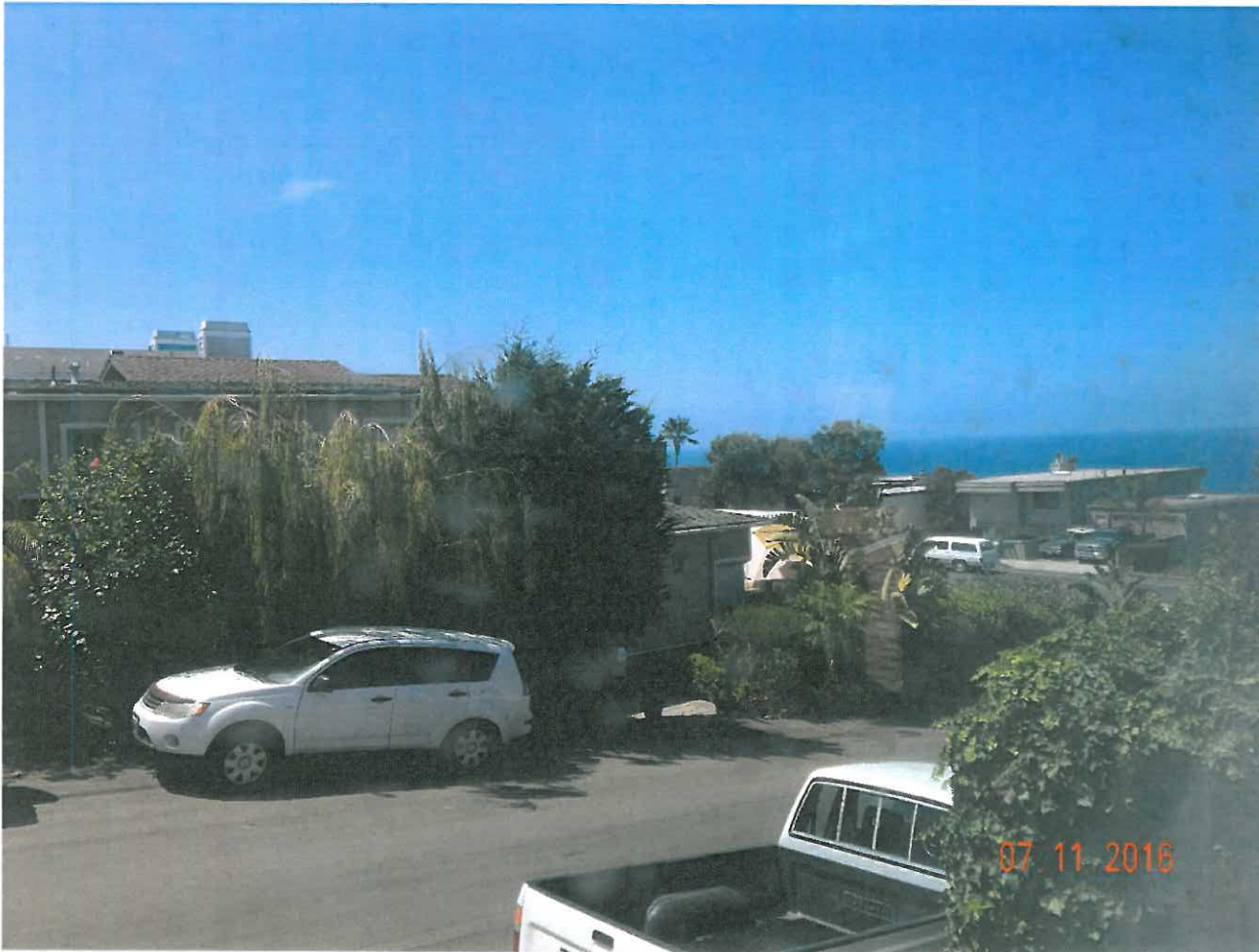
31991 Virginia Way

The photograph above was taken from the Master bedroom on the lower/ground floor of the primary residential structure.