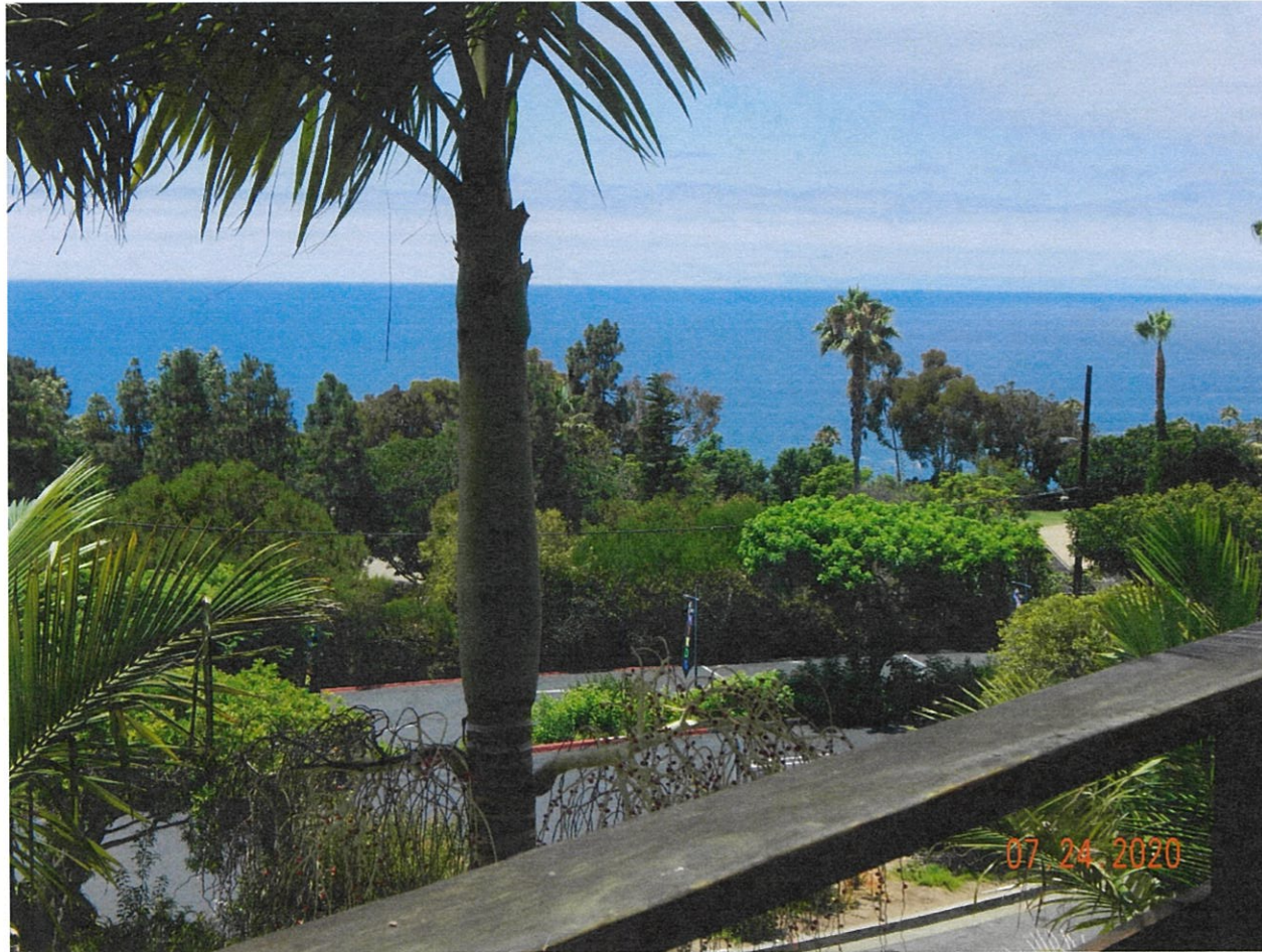
30882 Driftwood Drive

The photograph above was taken from the master bedroom on the upper level of the primary residential structure.