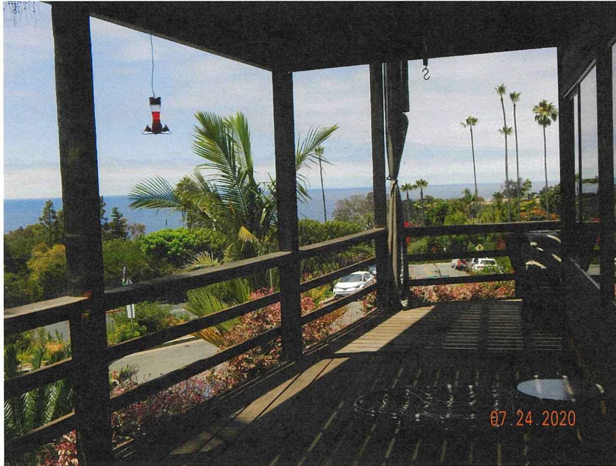
30882 Driftwood Drive

The photograph above was taken from the dining room on the main level of the primary residential structure.