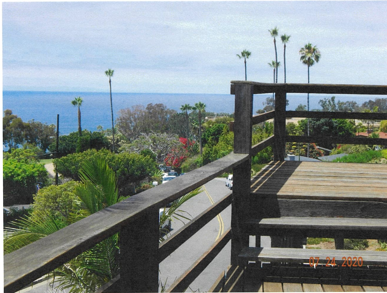
30882 Driftwood Drive

The photograph above was taken from the master bedroom on the upper level of the primary residential structure.