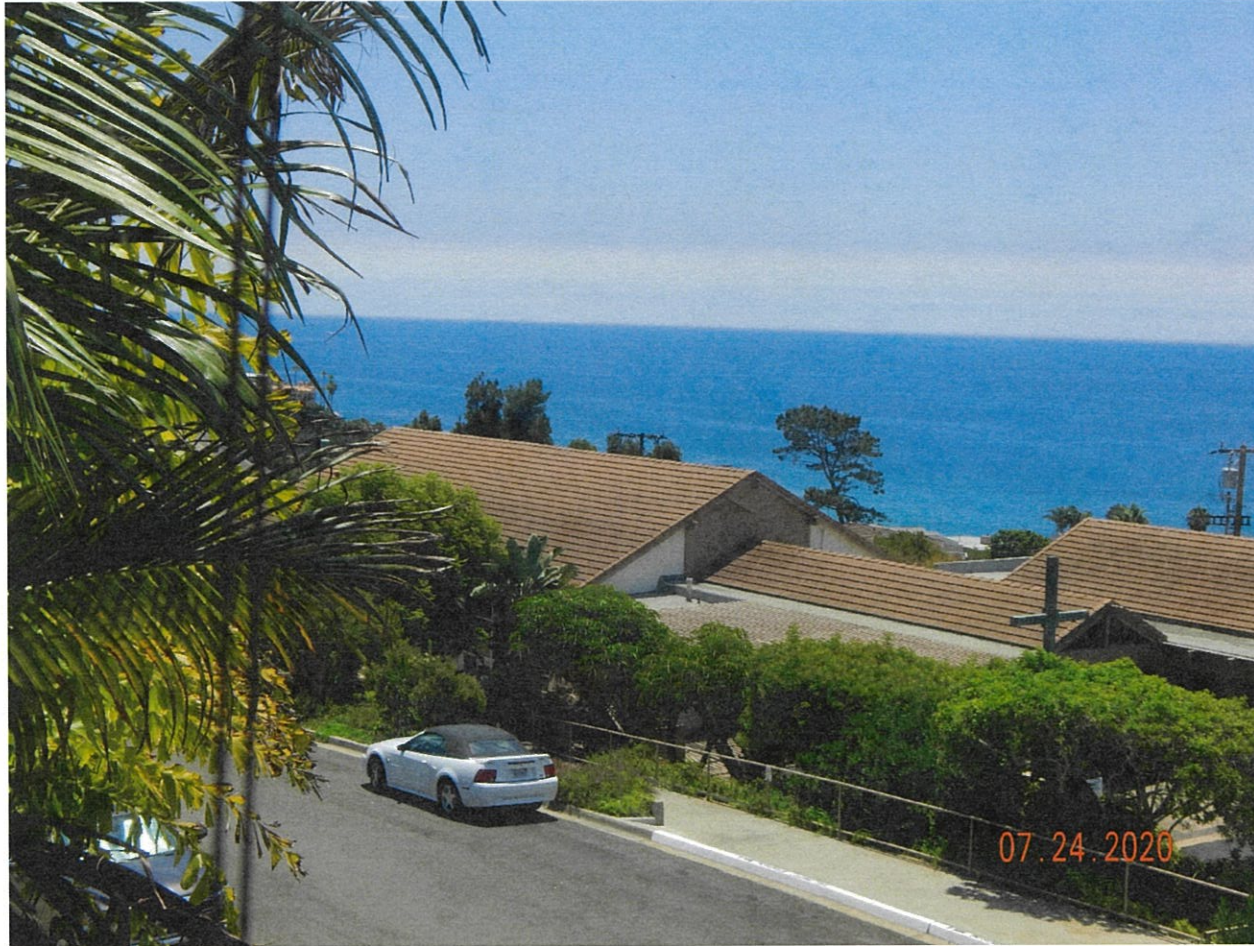
30882 Driftwood Drive

The photograph above was taken from the master bedroom on the upper level of the primary residential structure.