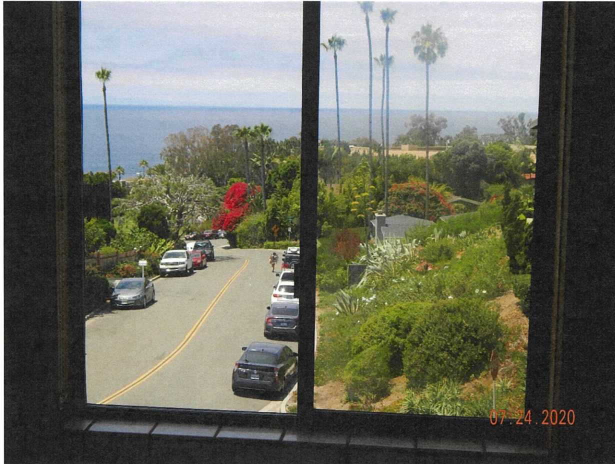
30882 Driftwood Drive

The photograph above was taken from the spa in the den on the upper level of the primary residential structure.