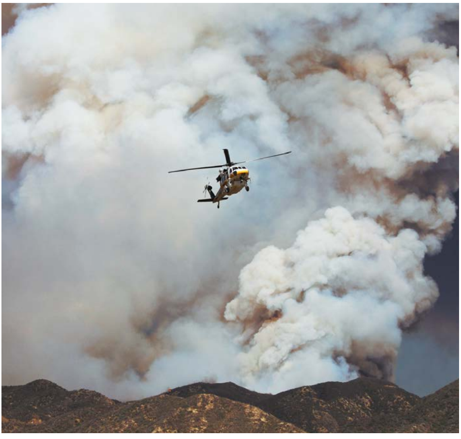
The services of helicopters able to drop water on fires are often employed in this area—most recently during the recent Silverado and Blue Ridge fires.

Were you able to get adequate information from websites/media to