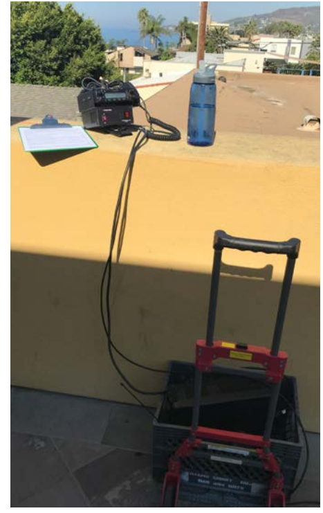
Equipment readied to test at ShakeOut drill.

At precisely 10:15 am, we practiced passing a test message via handheld radio from the Diamond/Crestview area to North Laguna. While on the surface this may not seem important to many, should an emergency such as an earthquake or other large-scale disaster strike Laguna Beach it is reassuring to know that our volunteers can relay critical information amongst ourselves and to first responders if necessary. Thank you to the radio team for taking the time to be prepared.