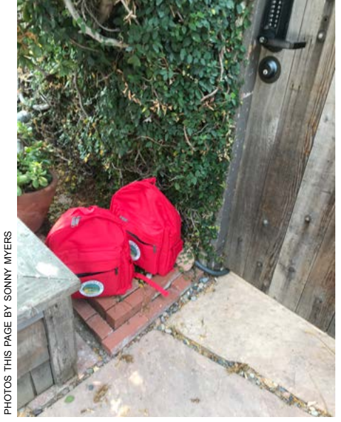
CERT delivers to your door!

o date, we have sold more than 1000 backpacks! We always see a spike in sales whenever there is an emergency, Red Flag announcement or earthquake. You