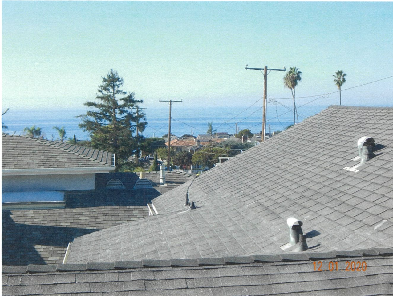
533 Brooks Street

The photograph above was taken from the child's bedroom on the upper level of the primary residential structure.