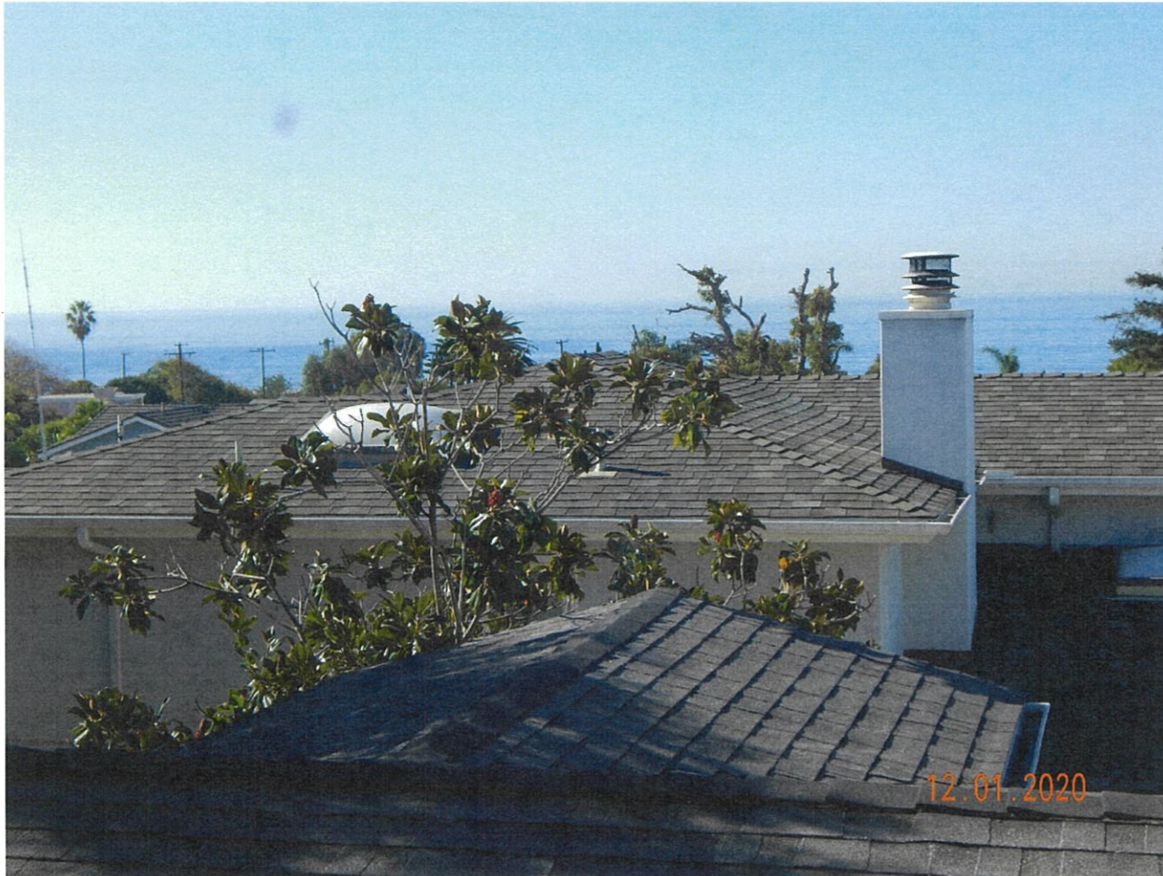
533 Brooks Street

The photograph above was taken from the master bedroom on the upper level of the primary residential structure.