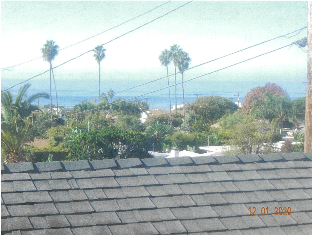
533 Brooks Street

The photograph above was taken from the office on the upper level of the primary residential structure.