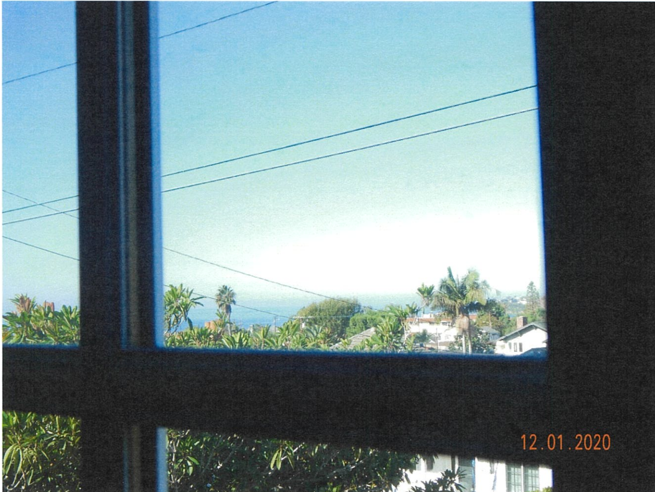
533 Brooks Street

The photograph above was taken from the front child/guest bedroom on the upper level of the primary residential structure.