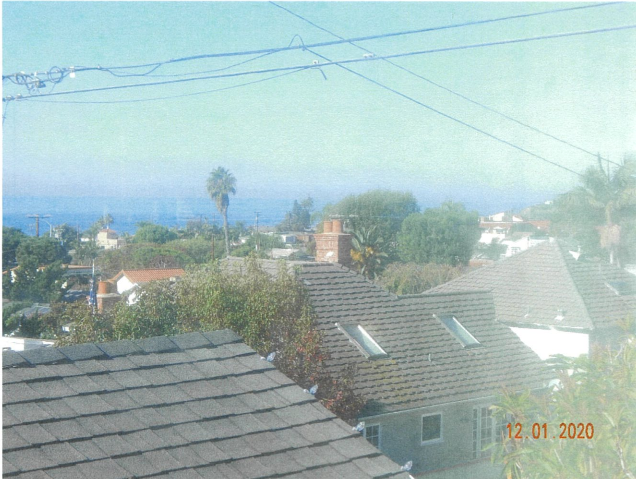
533 Brooks Street

The photograph above was taken from the office on the upper level of the primary residential structure.