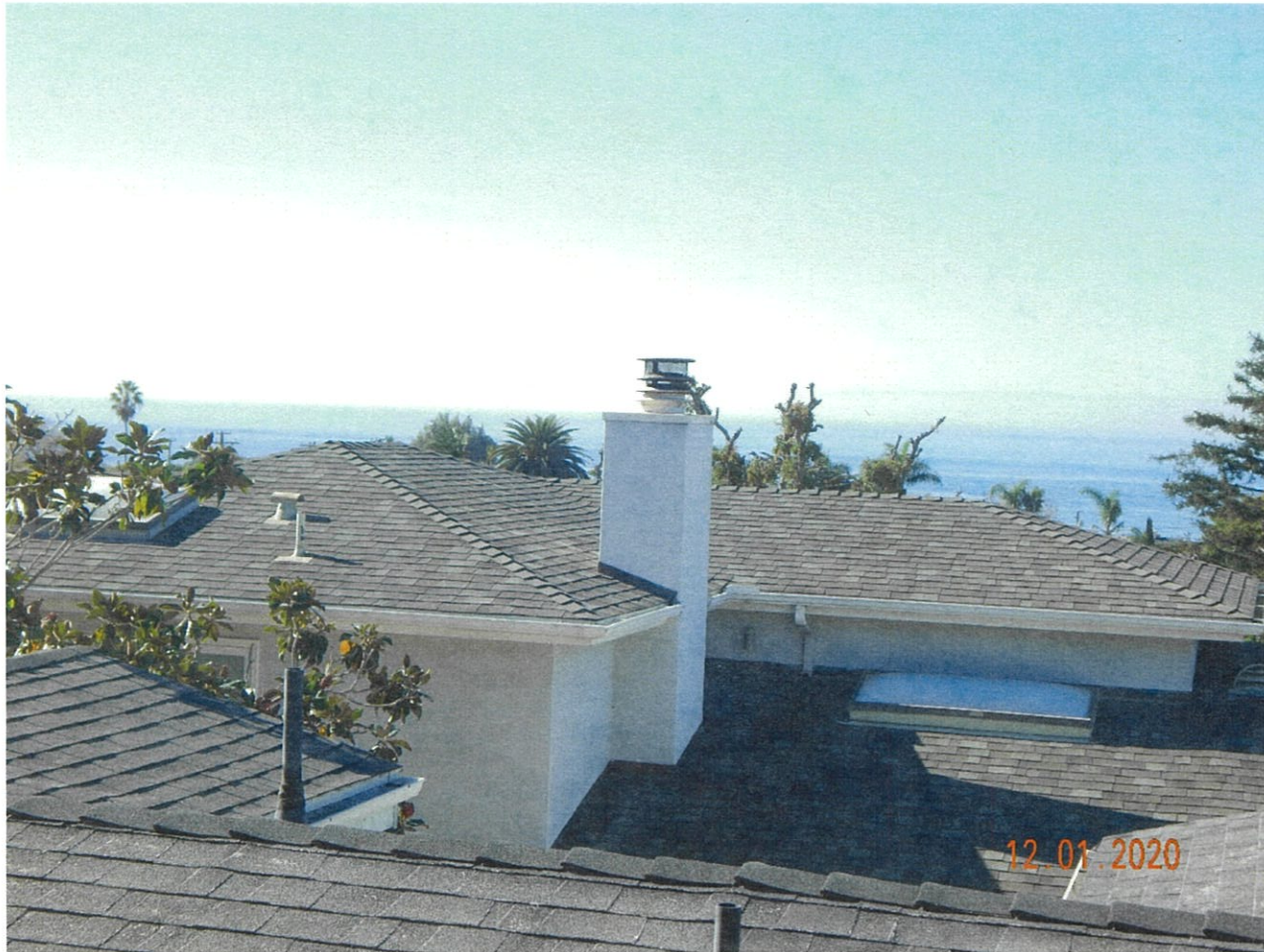
533 Brooks Street

The photograph above was taken from the child's bedroom on the upper level of the primary residential structure.