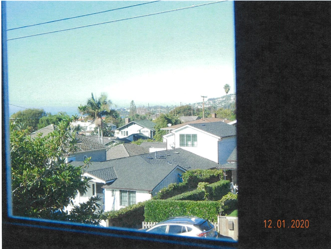
533 Brooks Street

The photograph above was taken from the front child/guest bedroom on the upper level of the primary residential structure.