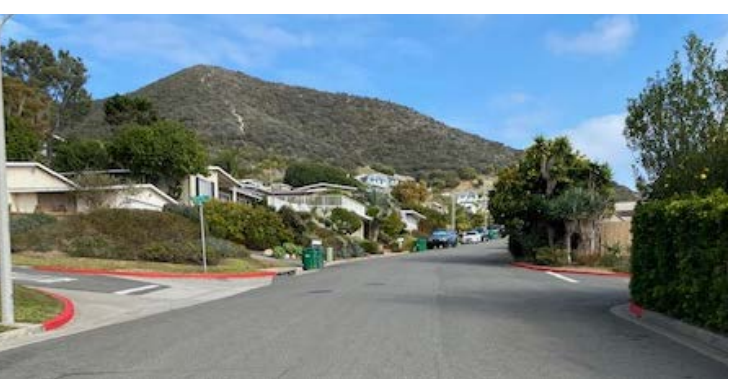
Wesley district residents along and adjacent to Ocean Vista Way worked with LBPD and LBFD to improve access through the addition of new 'red curb' zones.