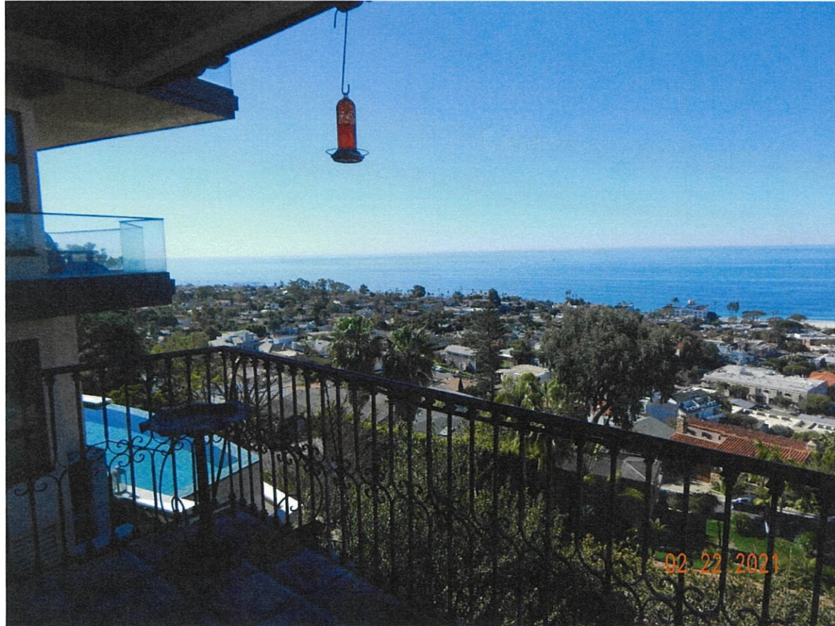
592 Mystic Way

The photograph above was taken from the guest unit on the lower floor of the primary residential structure.