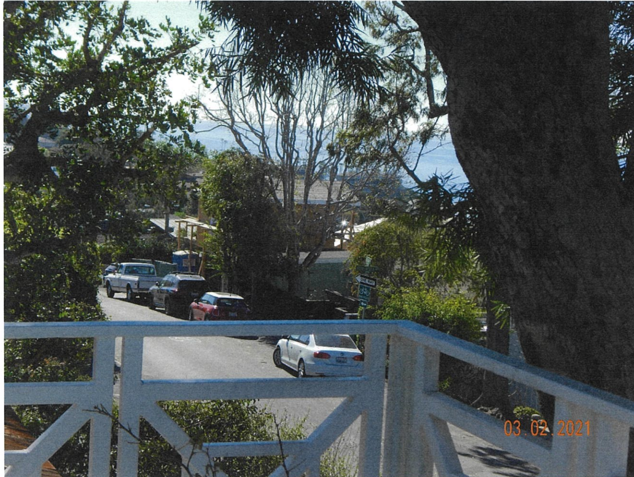
2696 Solana Way

The photograph above was taken from the master bedroom from the upper floor of the primary residential structure.