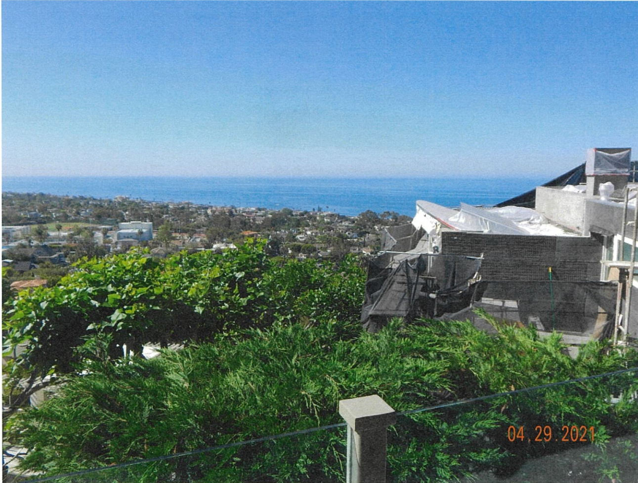
600 Vista Lane

The photograph above was taken from the living room on the main floor of the primary residential structure.