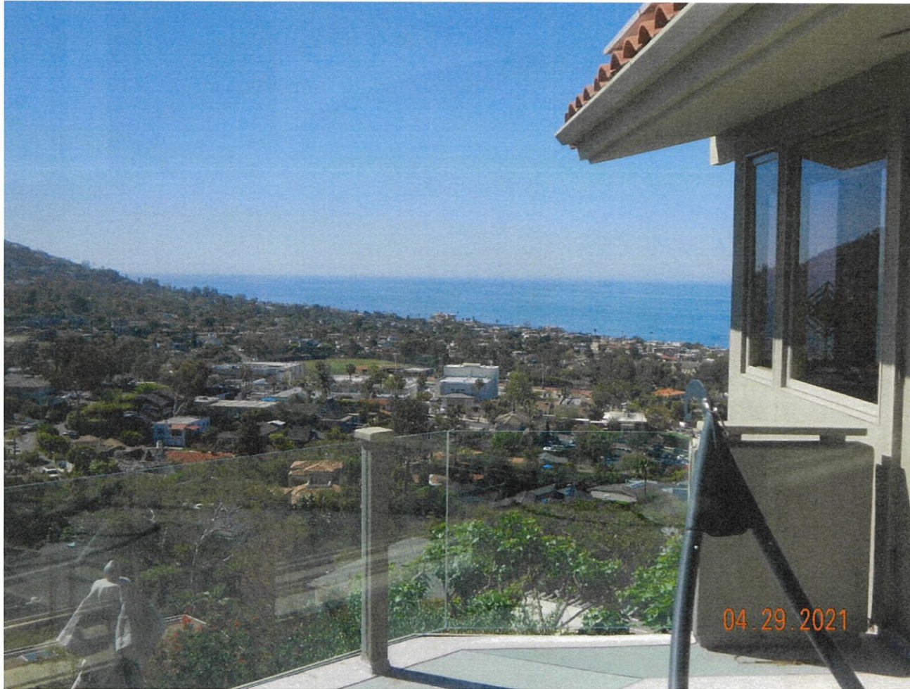
600 Vista Lane

The photograph above was taken from the master bedroom on the upper floor of the primary residential structure.