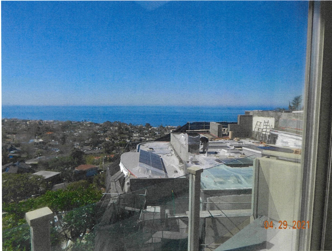
600 Vista Lane

The photograph above was taken from the family room on the upper floor of the primary residential structure.