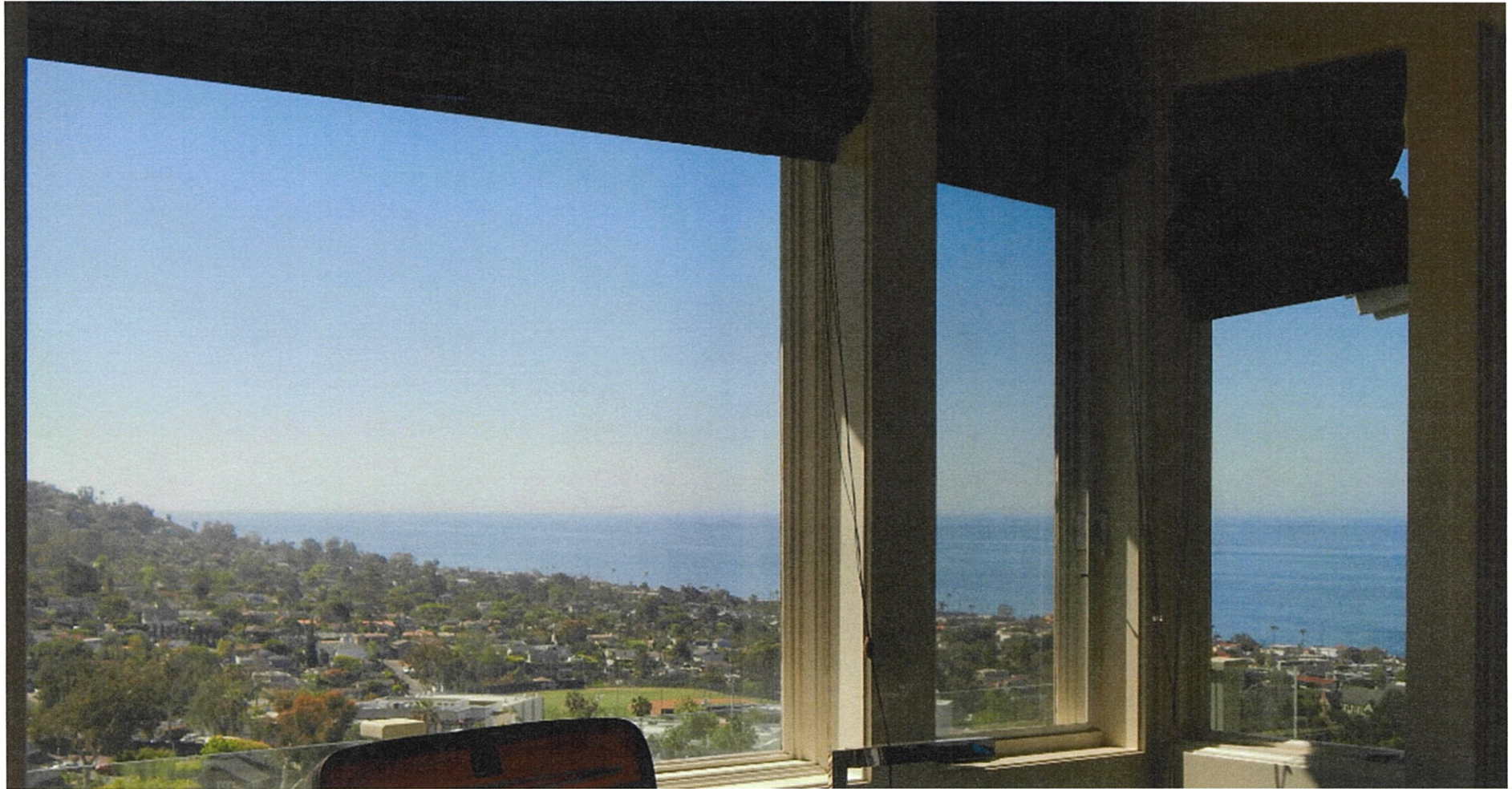
600 Vista Lane

The photograph above was taken from the master bedroom on the upper floor of the primary residential structure.