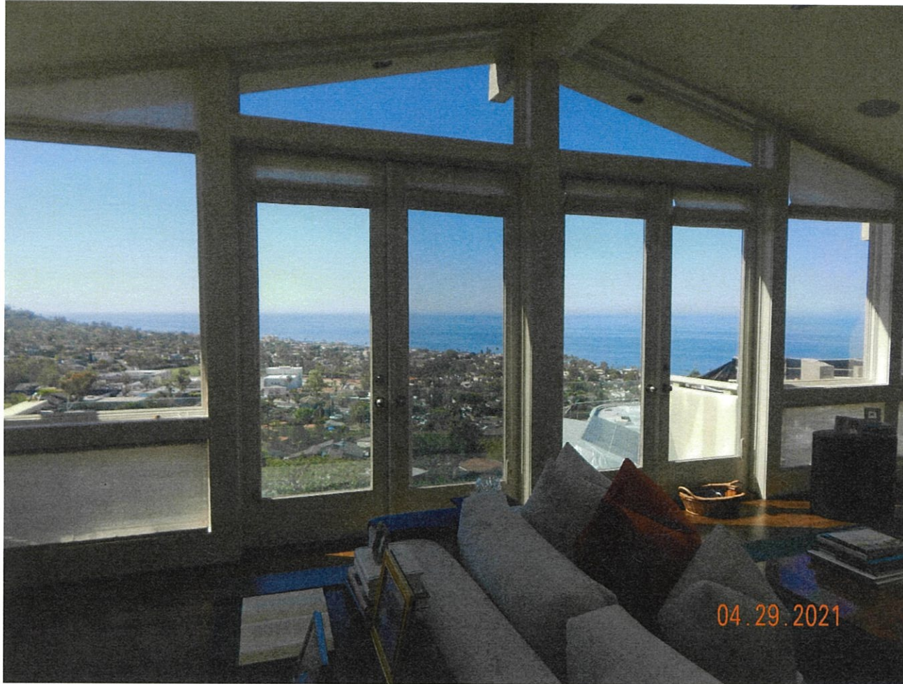
600 Vista Lane

The photograph above was taken from the family room on the upper floor of the primary residential structure.