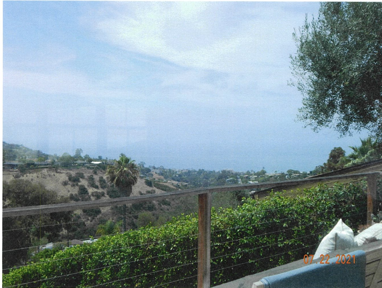
1945 Upper Rim Rock Rd.

The photograph above was taken from the living room on the main level of the primary residential structure.