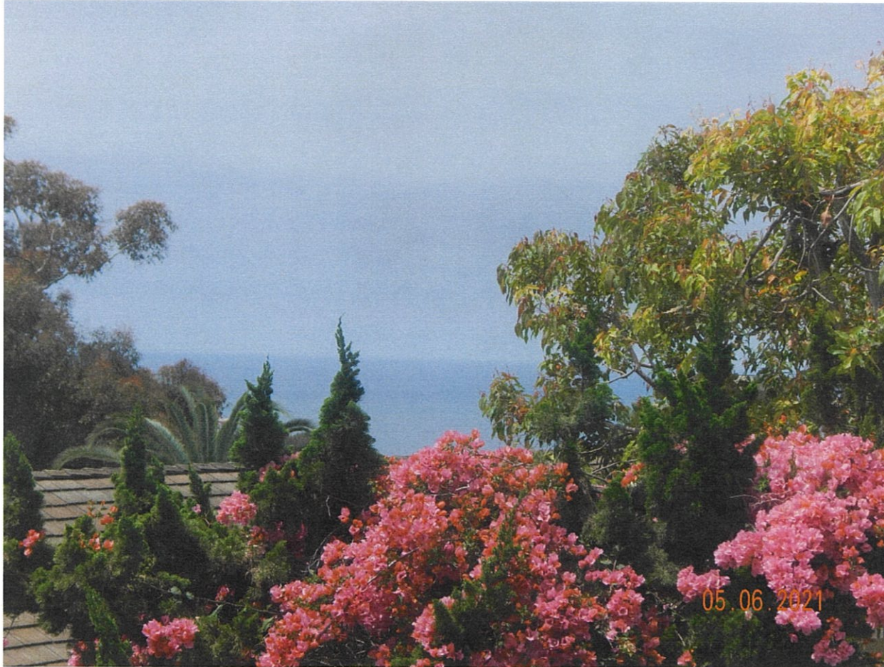
1450 Bluebird Canyon Dr.

The photograph above was taken from the guest bedroom on the lower floor of the primary residential structure.