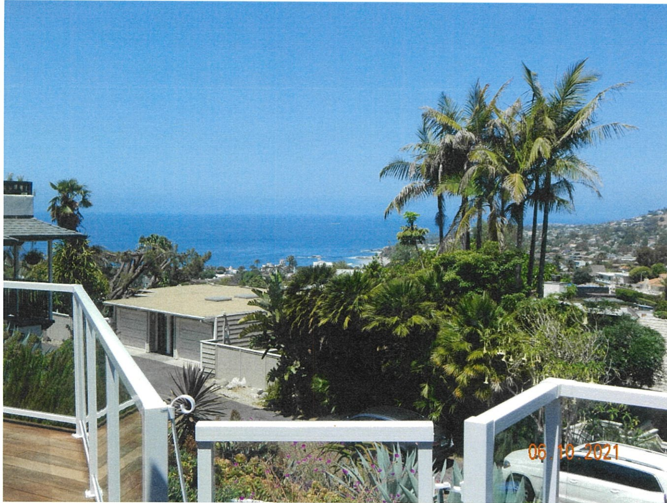
660 Temple Hills Drive

The photograph above was taken from the living room on the main floor of the primary residential structure.