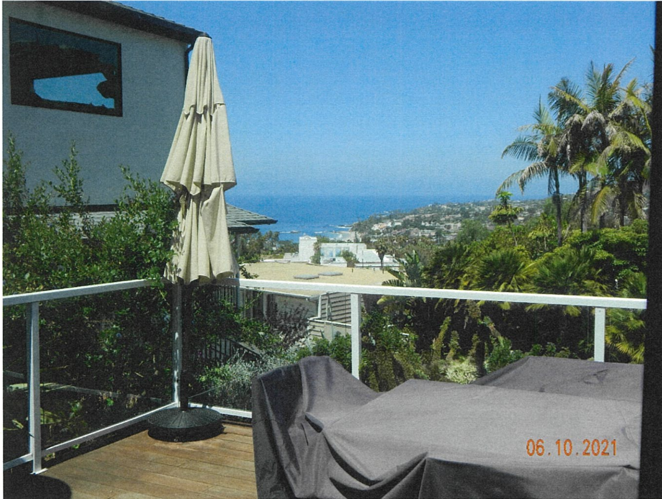
660 Temple Hills Drive

The photograph above was taken from the kitchen on the main floor of the primary residential structure.