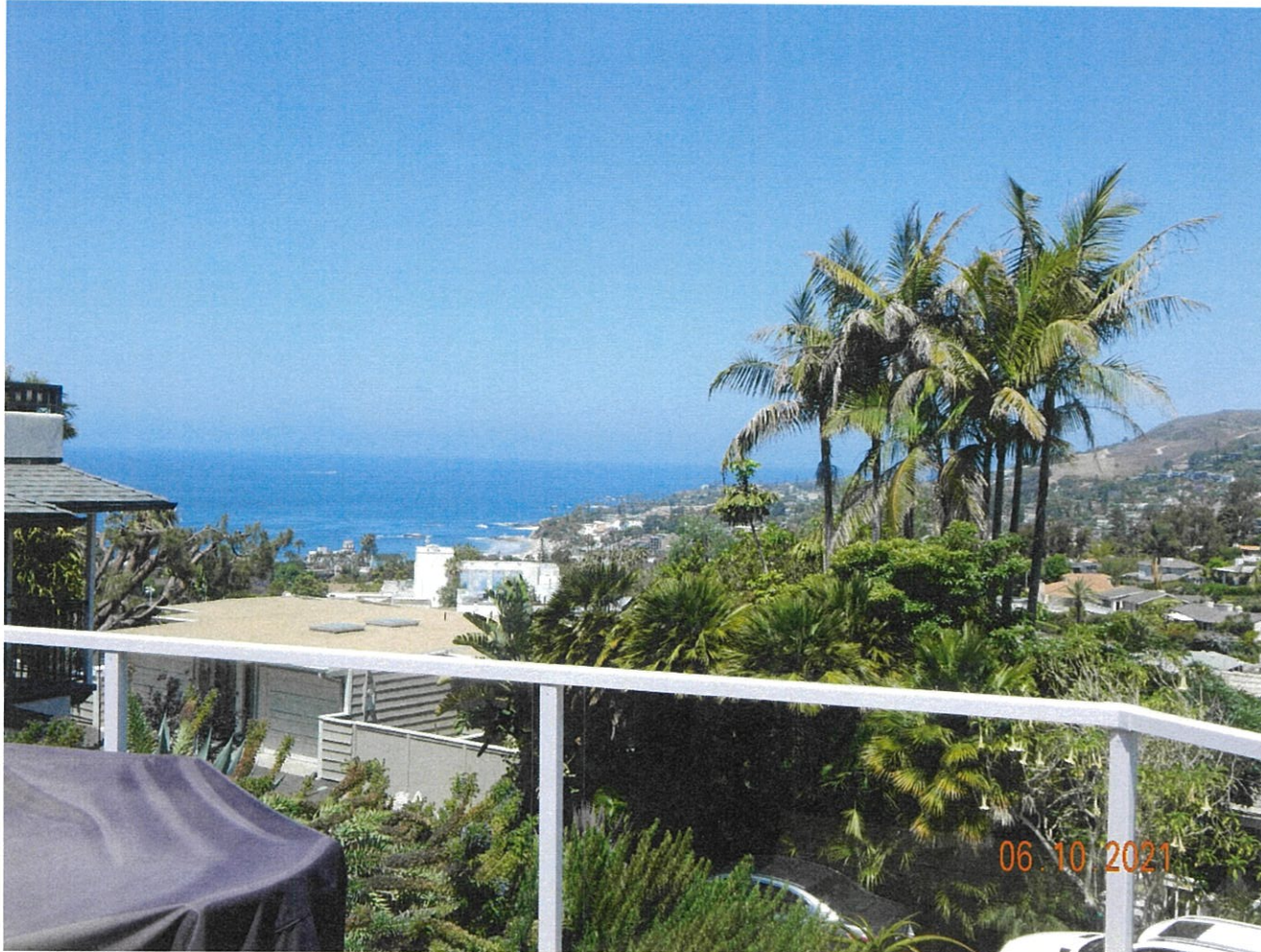
660 Temple Hills Drive

The photograph above was taken from the dining room on the main floor of the primary residential structure.