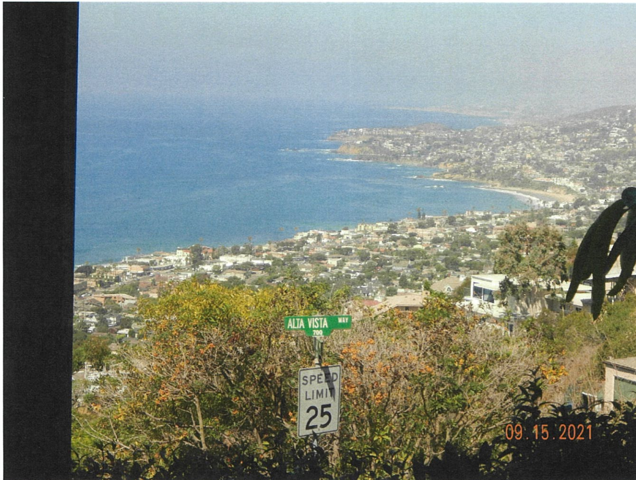
785 Alta Vista Way

The photograph above was taken from the living room on the main level of the primary residential structure.