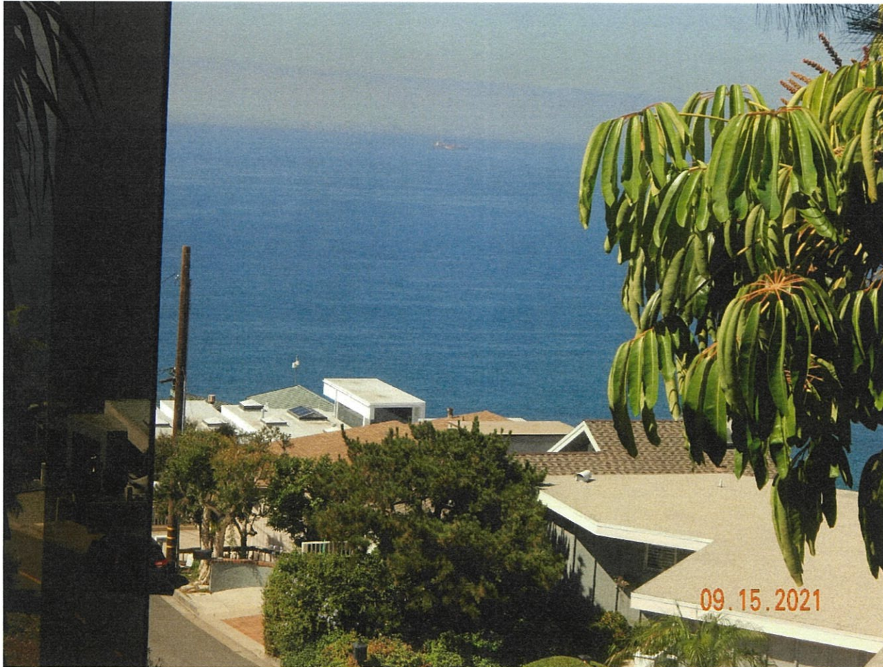
785 Alta Vista Way

The photograph above was taken from bedroom 3 on the upper level of the primary residential structure.